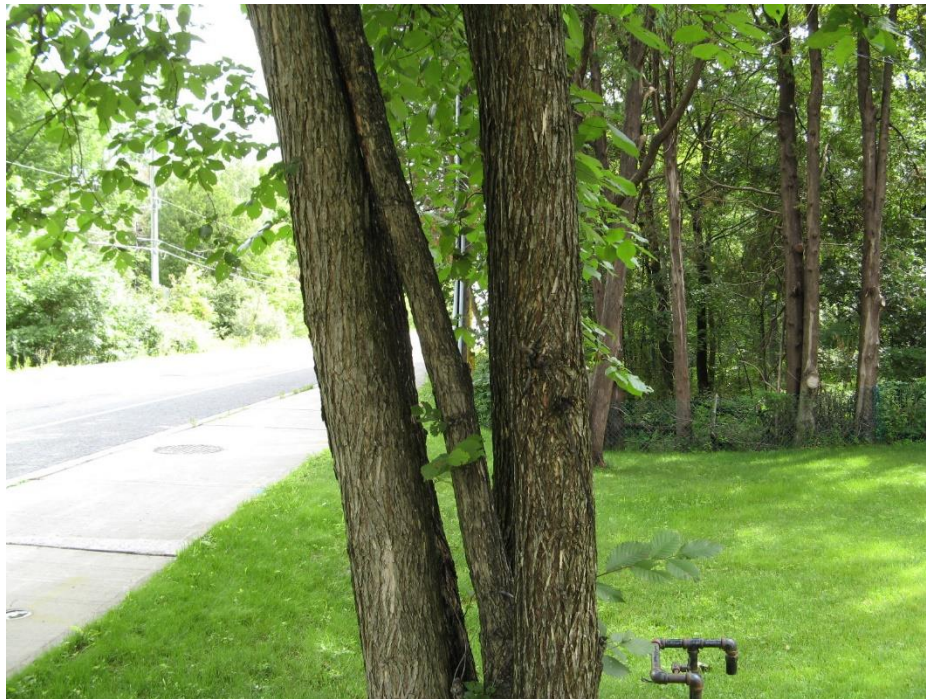
Photo 2 – Coppice white elm and manicured lawn in the front (north) portion of 3044 Innes Road. Note elm is likely on City property but is planned to be retained. View looking east