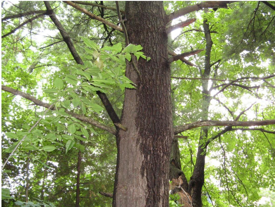
Photo 4 – Mature white pine in the southwest portion of 3044 Innes Road. View looking west