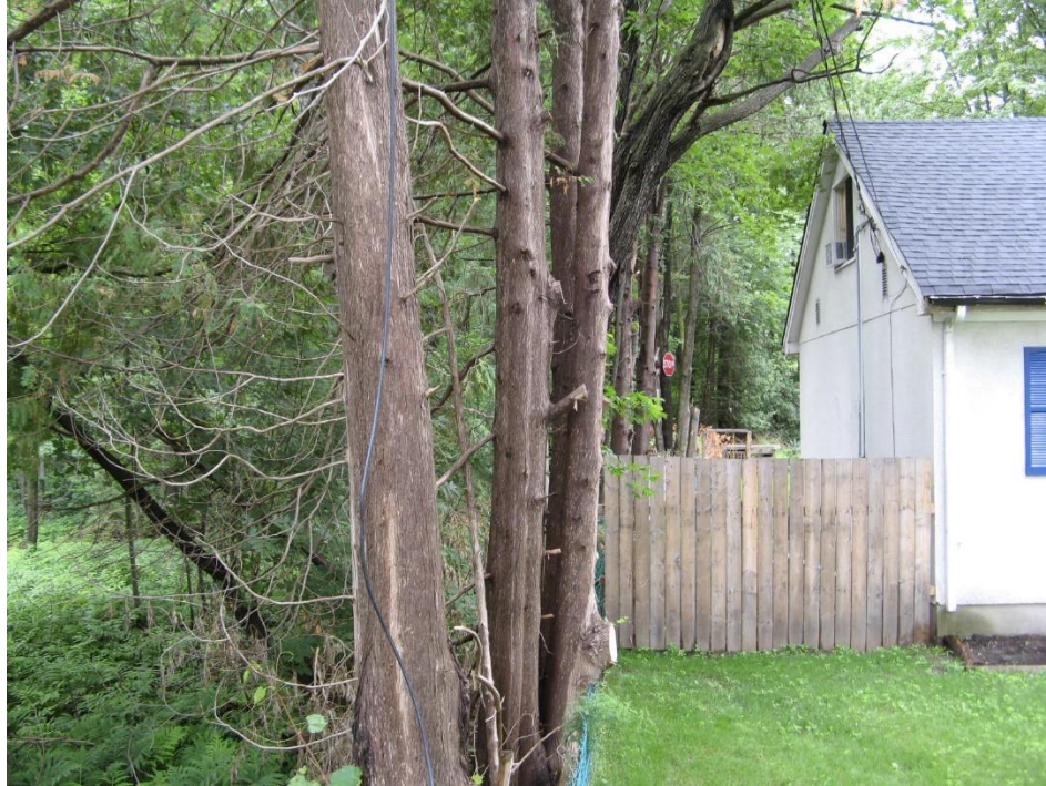
Photo 5 – White cedars along the east fenceline of 3044 Innes Road, south of Innes Road. Front cedars are on City property but will be retained. View looking south.