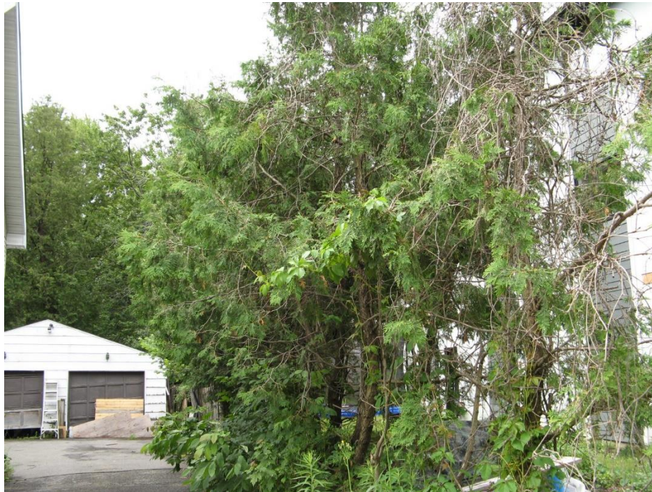
Photo 8 – White cedars between 3040 and 3044 Innes Road. View looking south