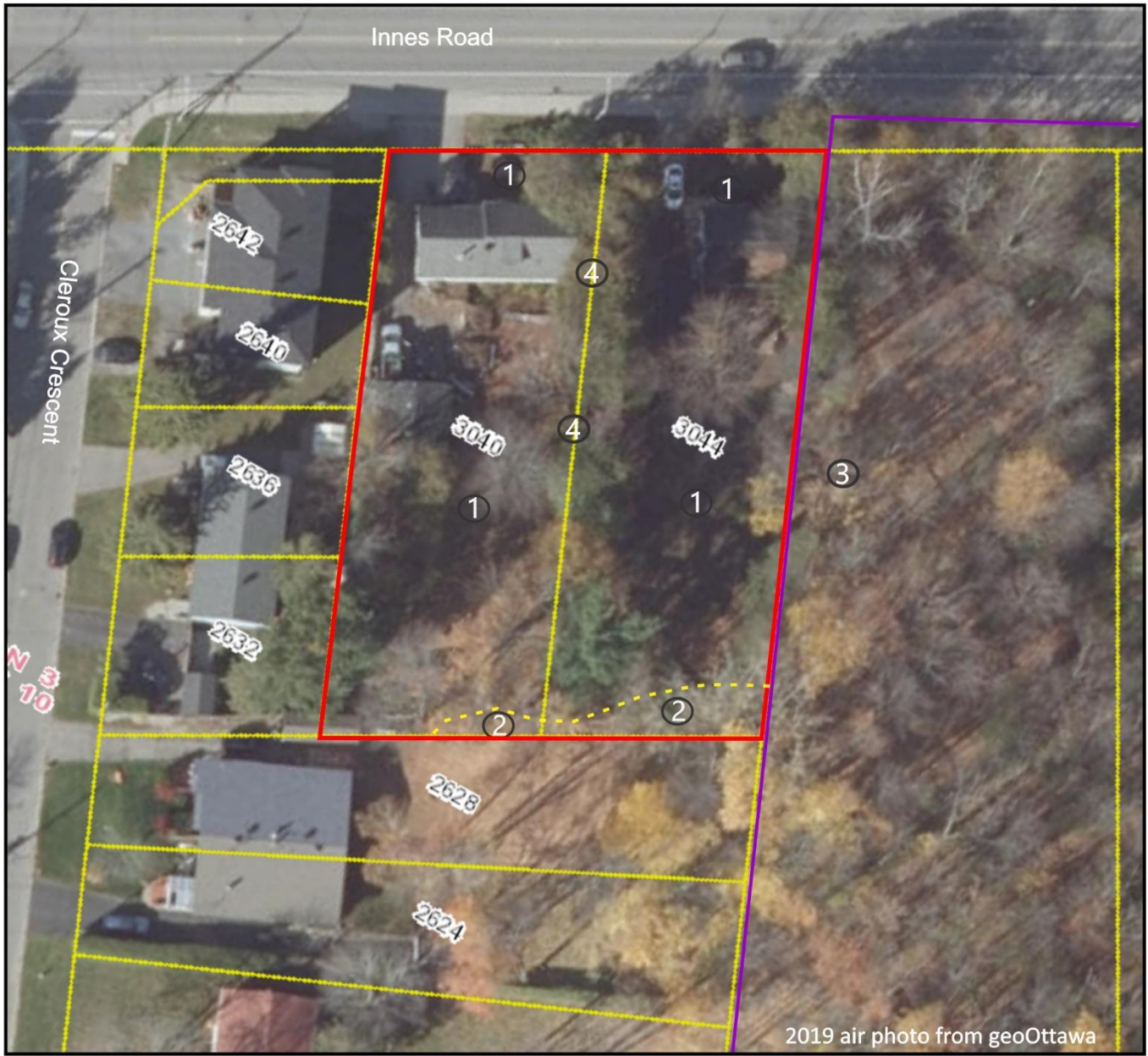
2019 air photo from geoOttawa