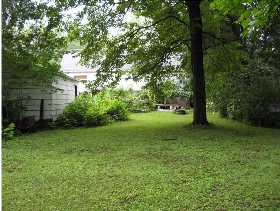
Photo 7 – Manicured lawn and one of the mature red maples in the south half of 3040 Innes Road. View looking north