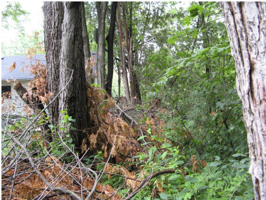
Photo 6 - Maples and cedars along the south portion of the east fenceline of 3044 Innes Road. In forefront is mature sugar maple east of site with critical root zone extending onto the site. View looking north