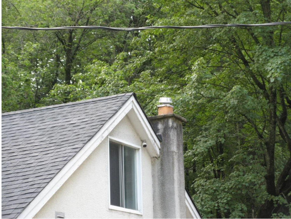
Photo 1 – Chimneys on the residences (this example is 3044 Innes Road) are vented, preventing potential chimney swift access. View looking southeast