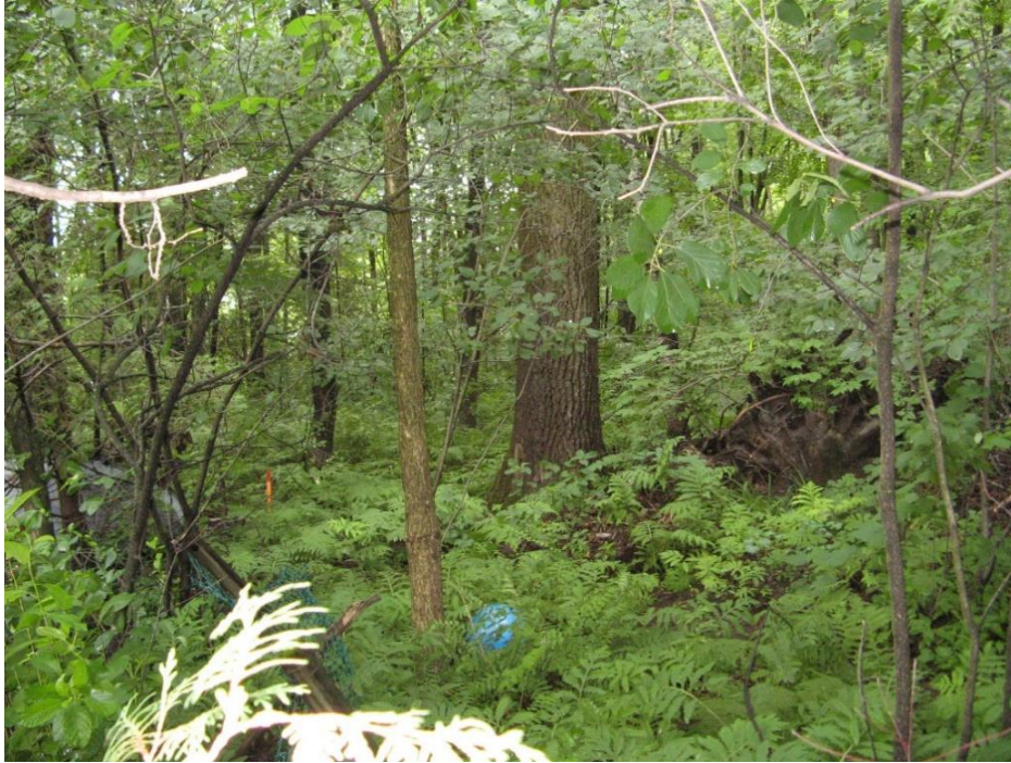
Photo 9 - Mature eastern cottonwood to the south of the southeast corner of the site (note stake). View looking east