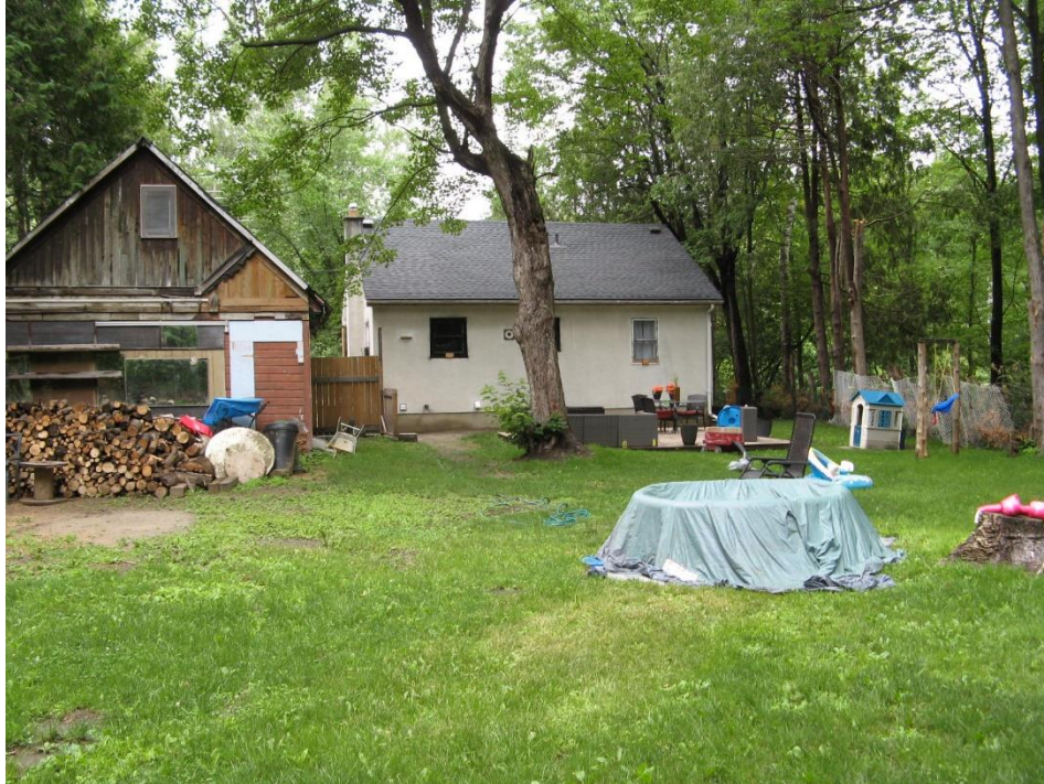
Photo 3 – Rear yard of 3044 Innes Road. View looking north to red maple in apparently poor condition.