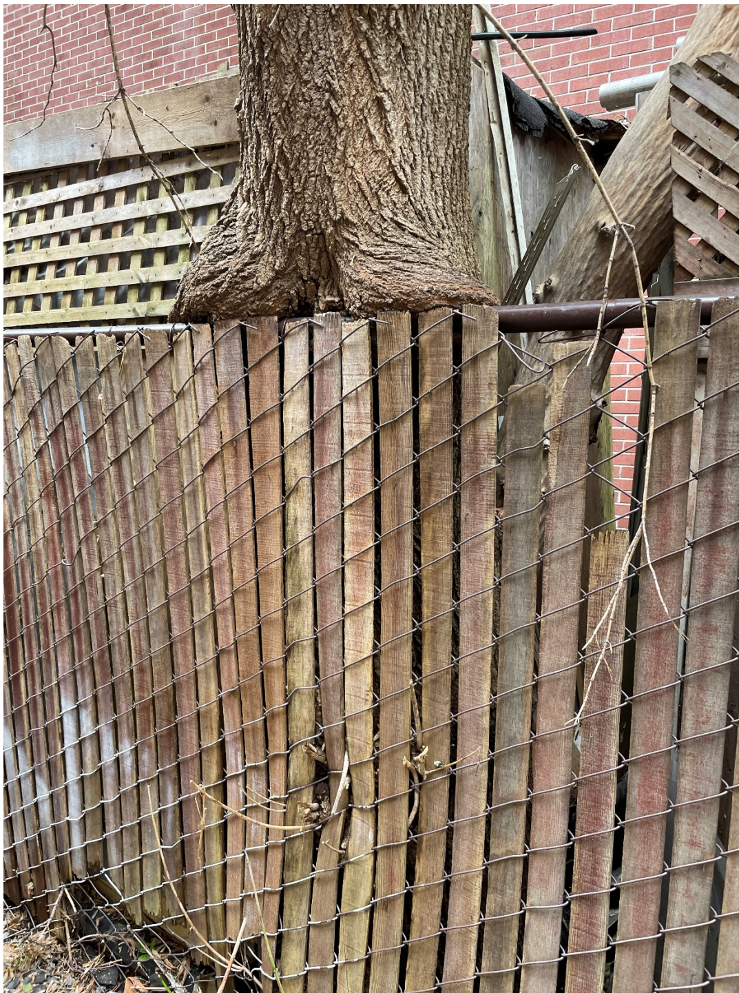
Figure 3: Tree 2, close-up of trunk growing into metal fence