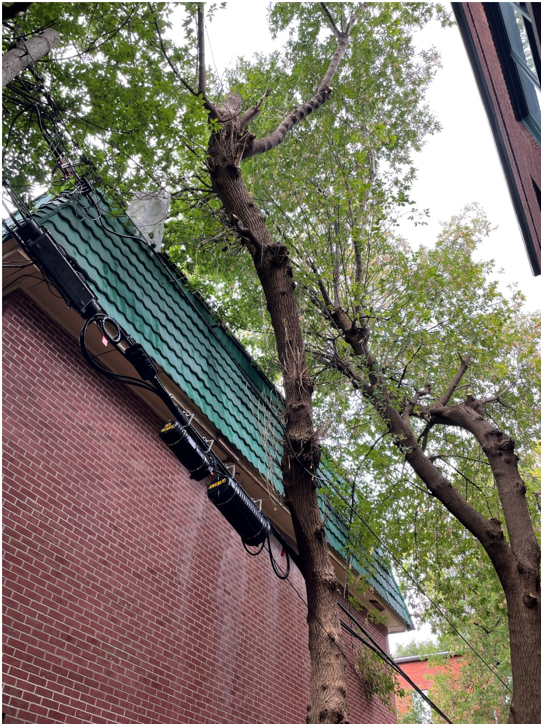
Figure 4: Tree 3 (left), Manitoba maple to be removed