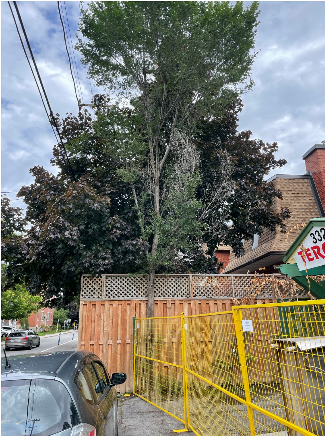
Figure 1: Tree 1, Siberian elm in the city right of way to be removed