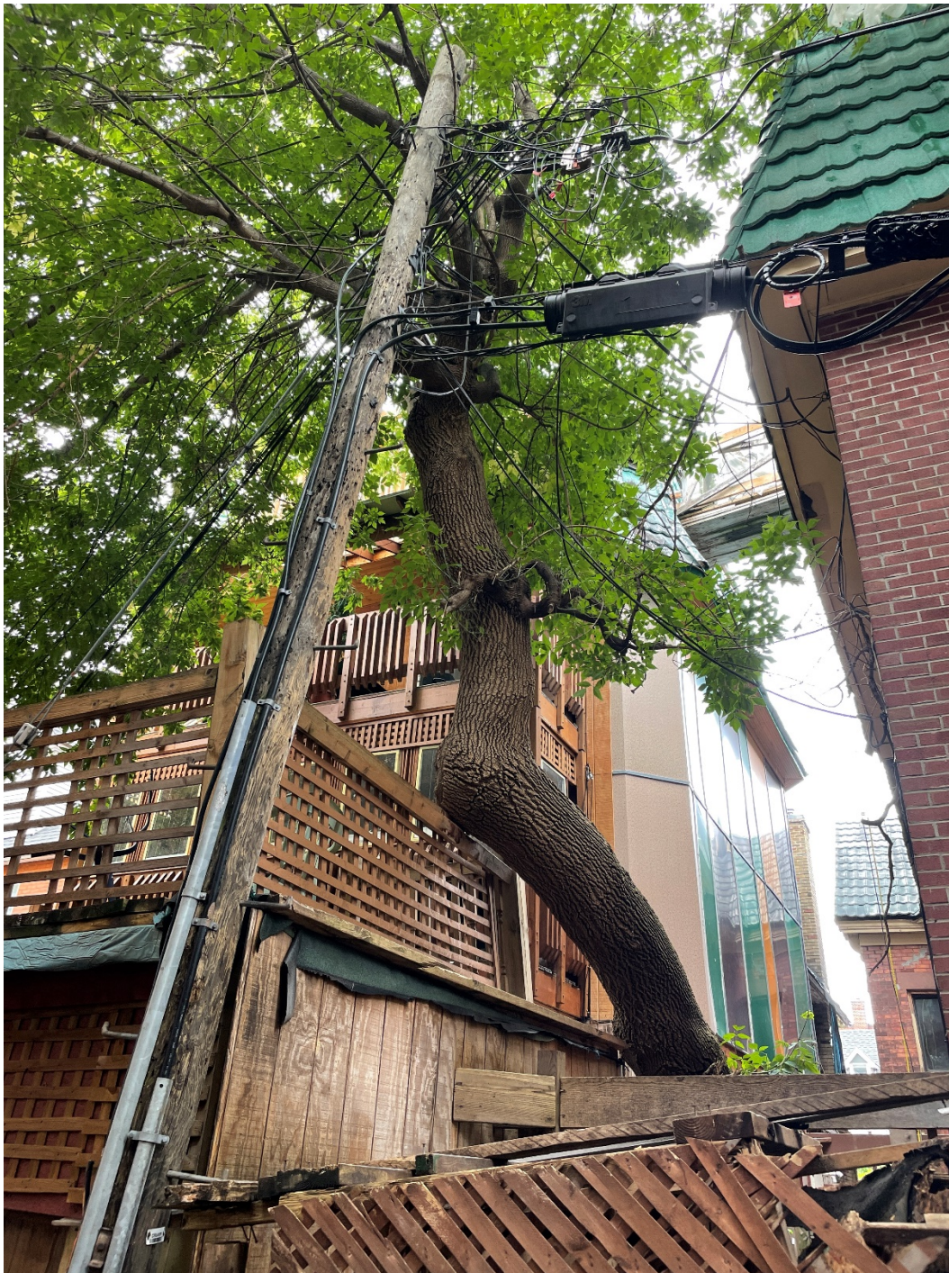
Figure 5: Tree 4, Manitoba maple to be removed