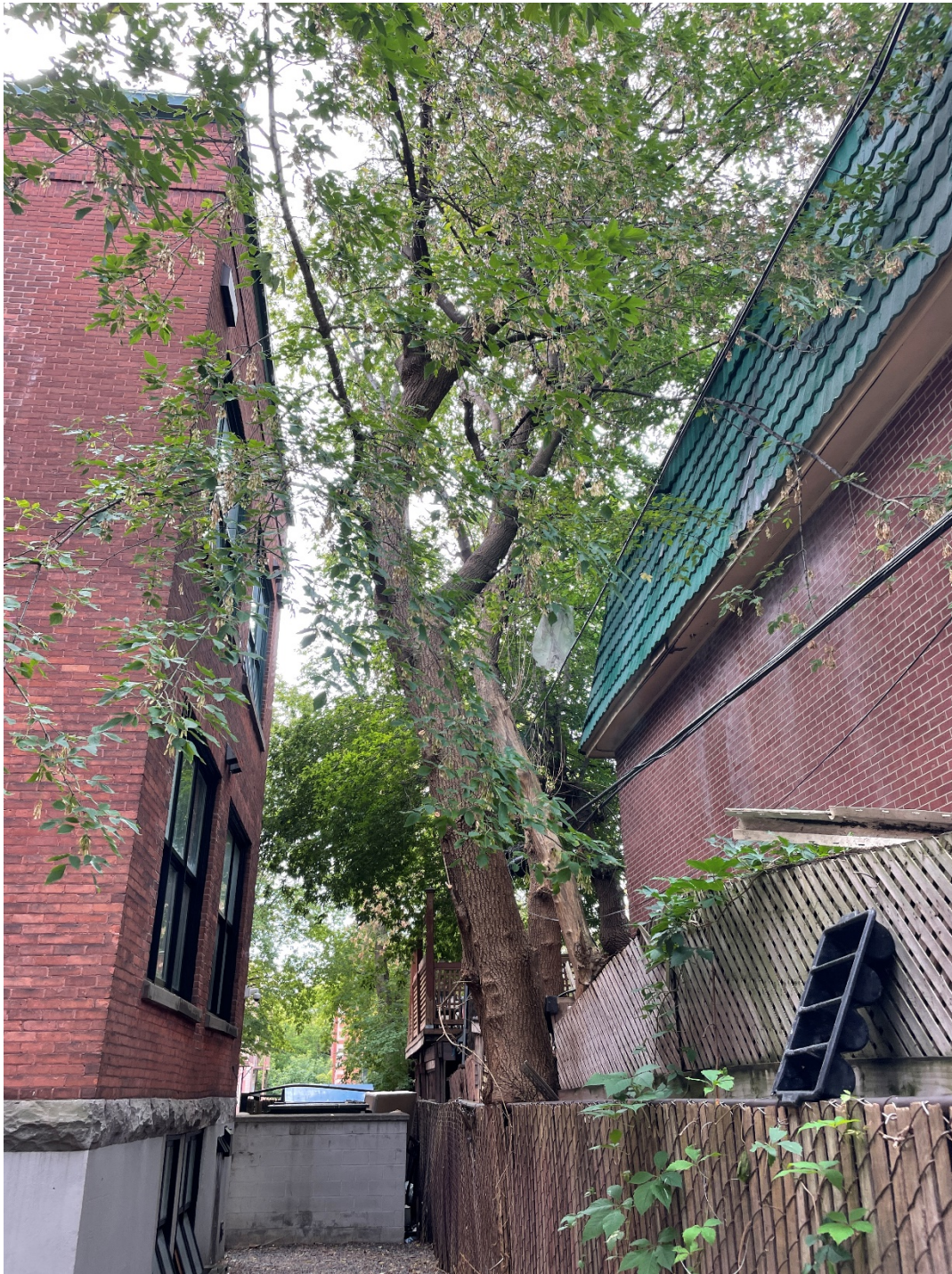
Figure 2: Tree 2, Manitoba maple, to be removed