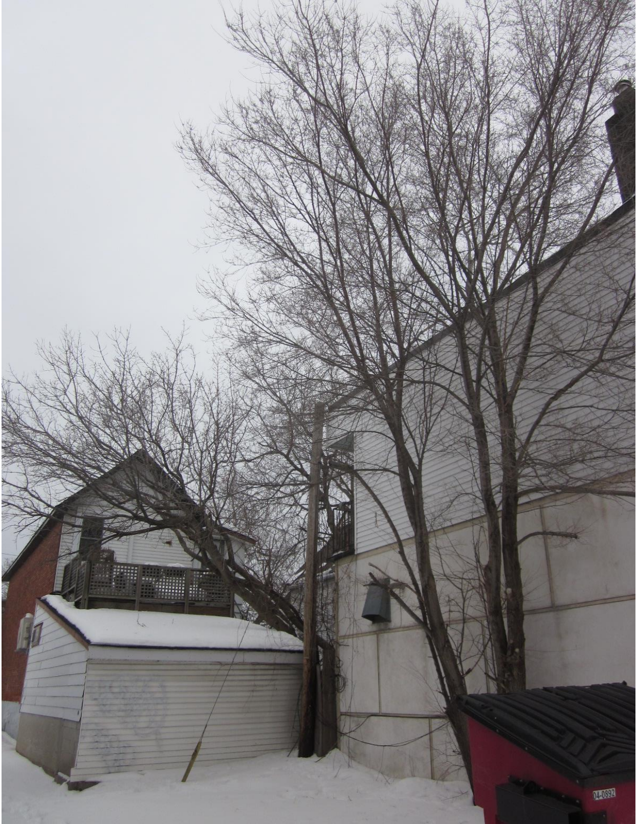
Picture 3. Trees #5 (right) and 6, private Siberian elm and Manitoba maple at 979 Wellington Street