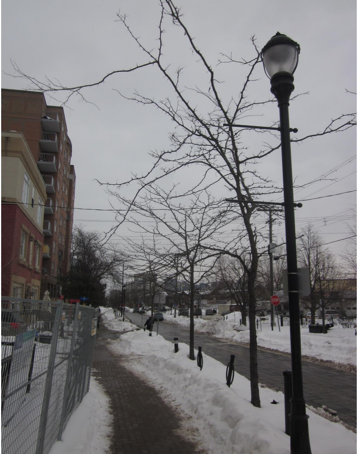
Picture 2. Trees #2, 3 and 4 (background to foreground), honey-locusts on City property adjacent to 979 Wellington Street