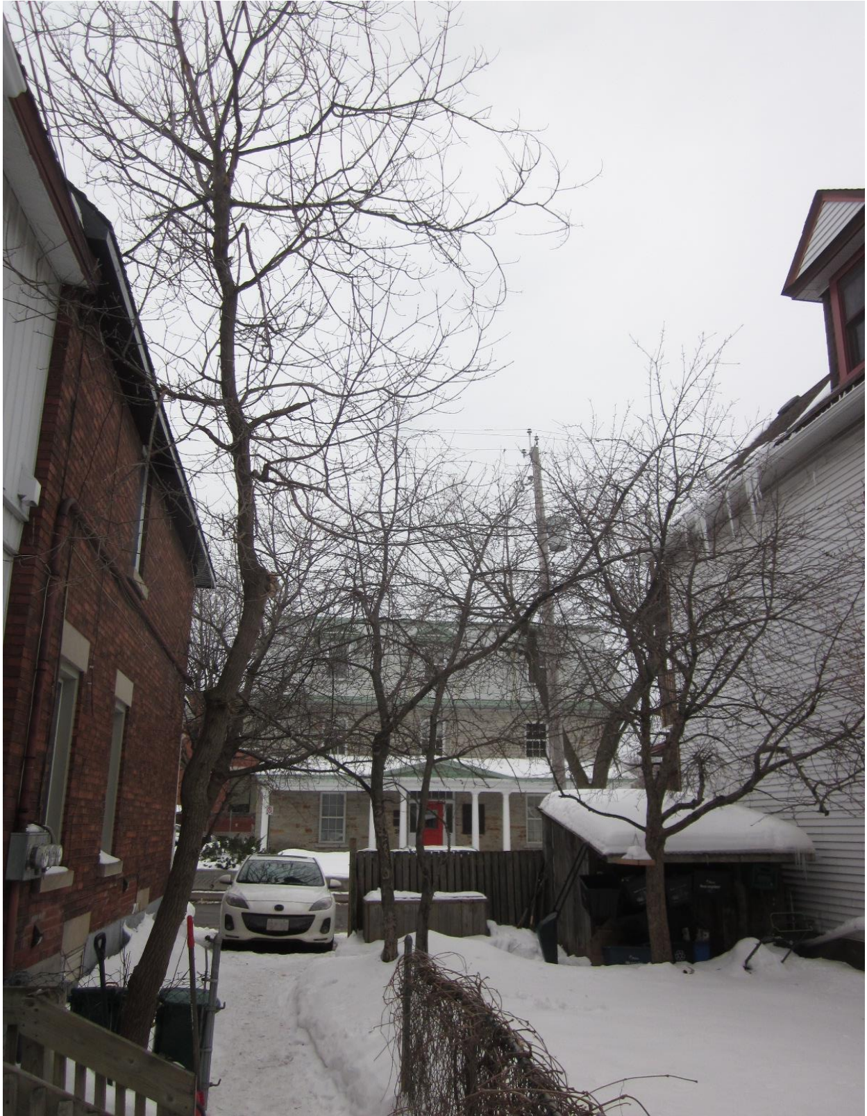
Picture 4. Trees #9, 10 and 11 (left to right), private Manitoba maple and crab apples at 979 Wellington Street