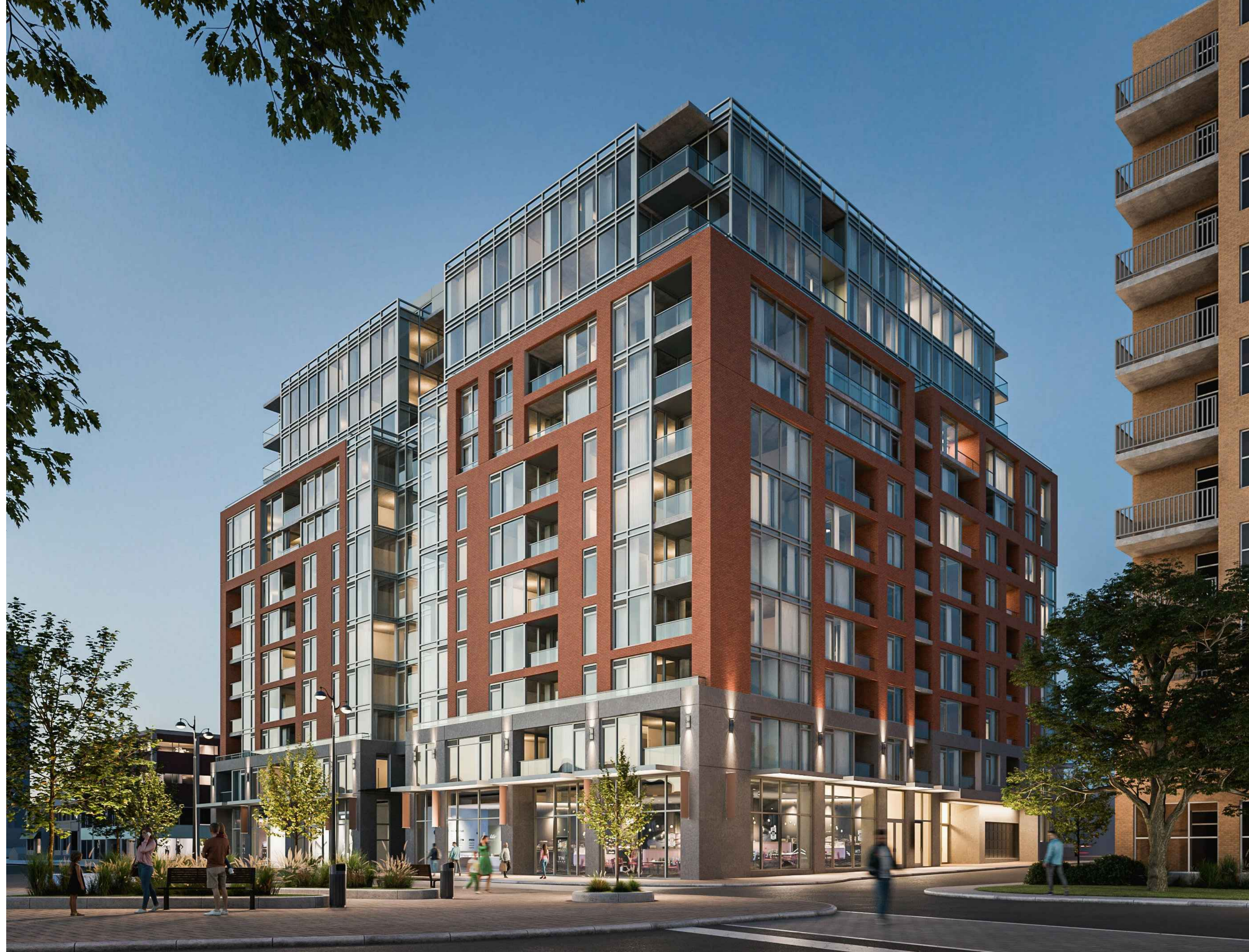
IMAGE CONCEPTUELLE. LES SPÉCIFICATIONS DES PLANS ET DEVIS PEUVENT VARIER

24 Mont-Royal O. Bureau 801 Montréal Québec H2T 2S2 T: 514.849.7700 F: 514.849.2027 info@projetpaysage.com