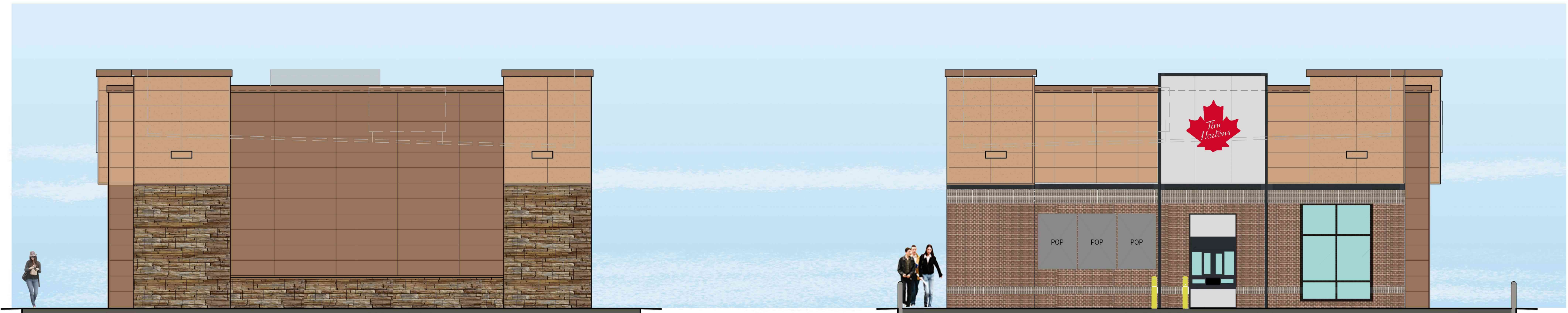
3 "SIDE" (SOUTH) ELEVATION SCALE: 3/16" = 1'-0"