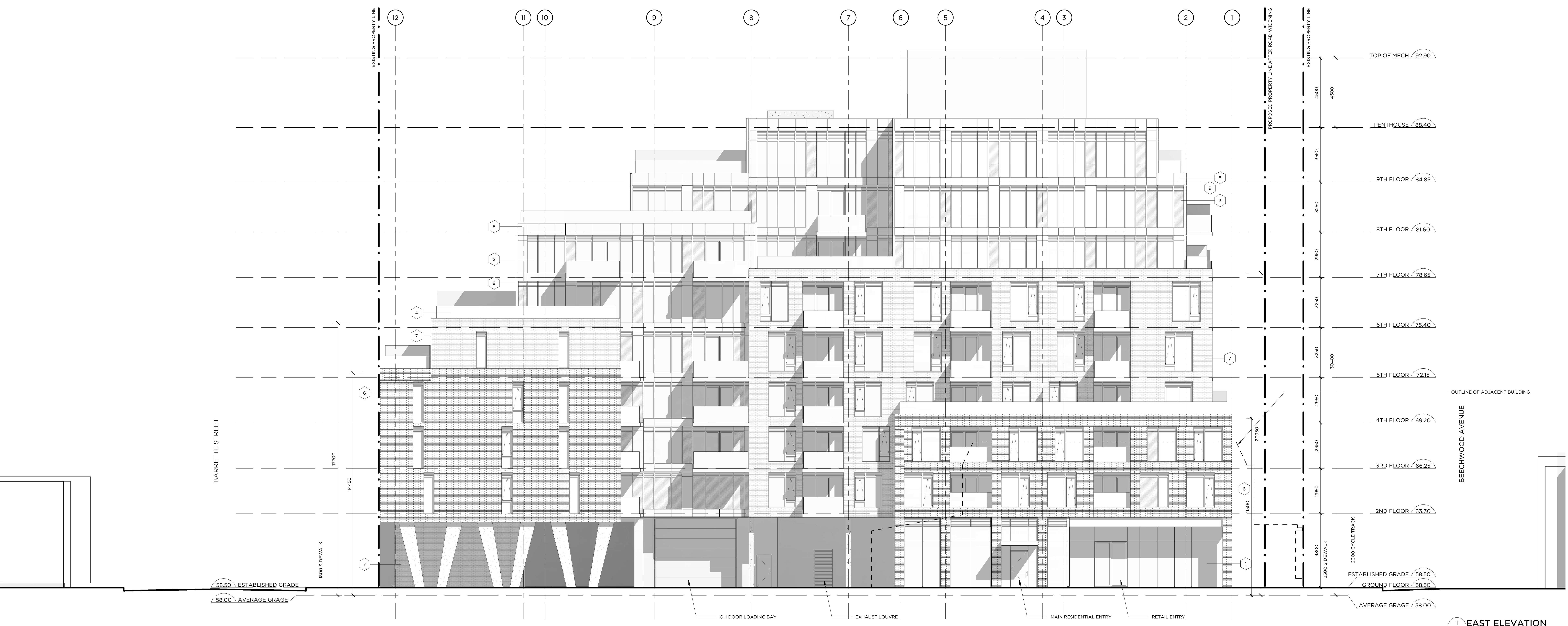
1 EAST ELEVATION A402 1:100