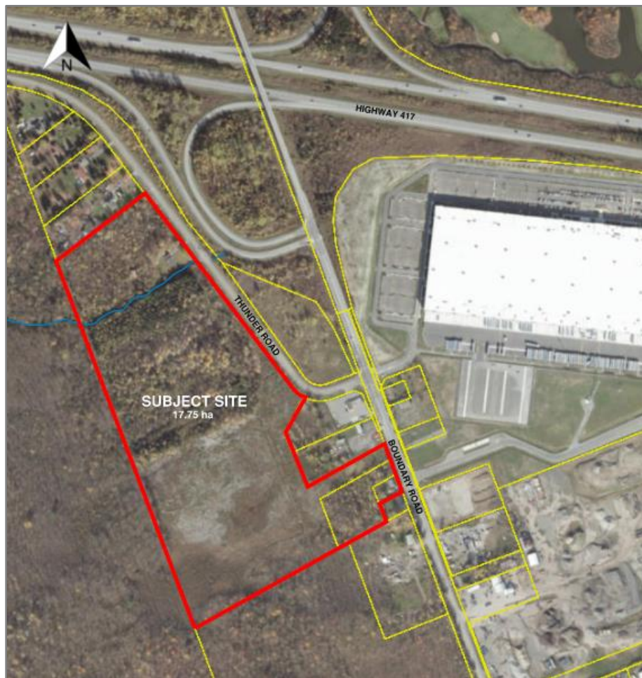
Figure 1: Aerial View of Subject Lands

LRL Associates Ltd. was retained by Avenue 31 to prepare a functional serviceability report to support the Official Plan Amendment and Zoning By-law amendment application for the property located at the south west corner of the intersection of Boundary Road and Thunder Road in Ottawa ON. The subject land encompasses three (3) separate properties as shown in Figure 1 below. The civic address' for the parcels are 6150 Thunder Road, 5368A Boundary Road and 5368B Boundary Road.