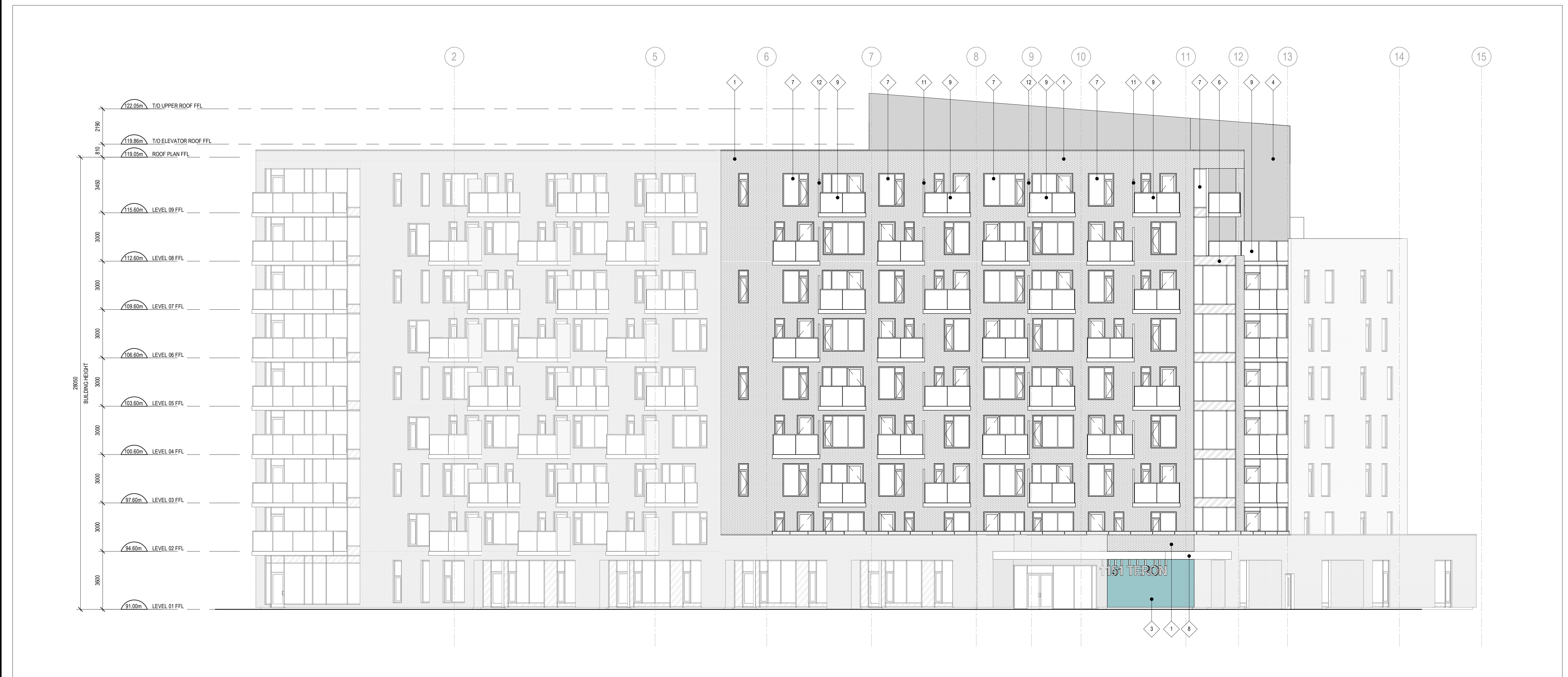
CLADDING LEGEND SCALE: 1 : 125