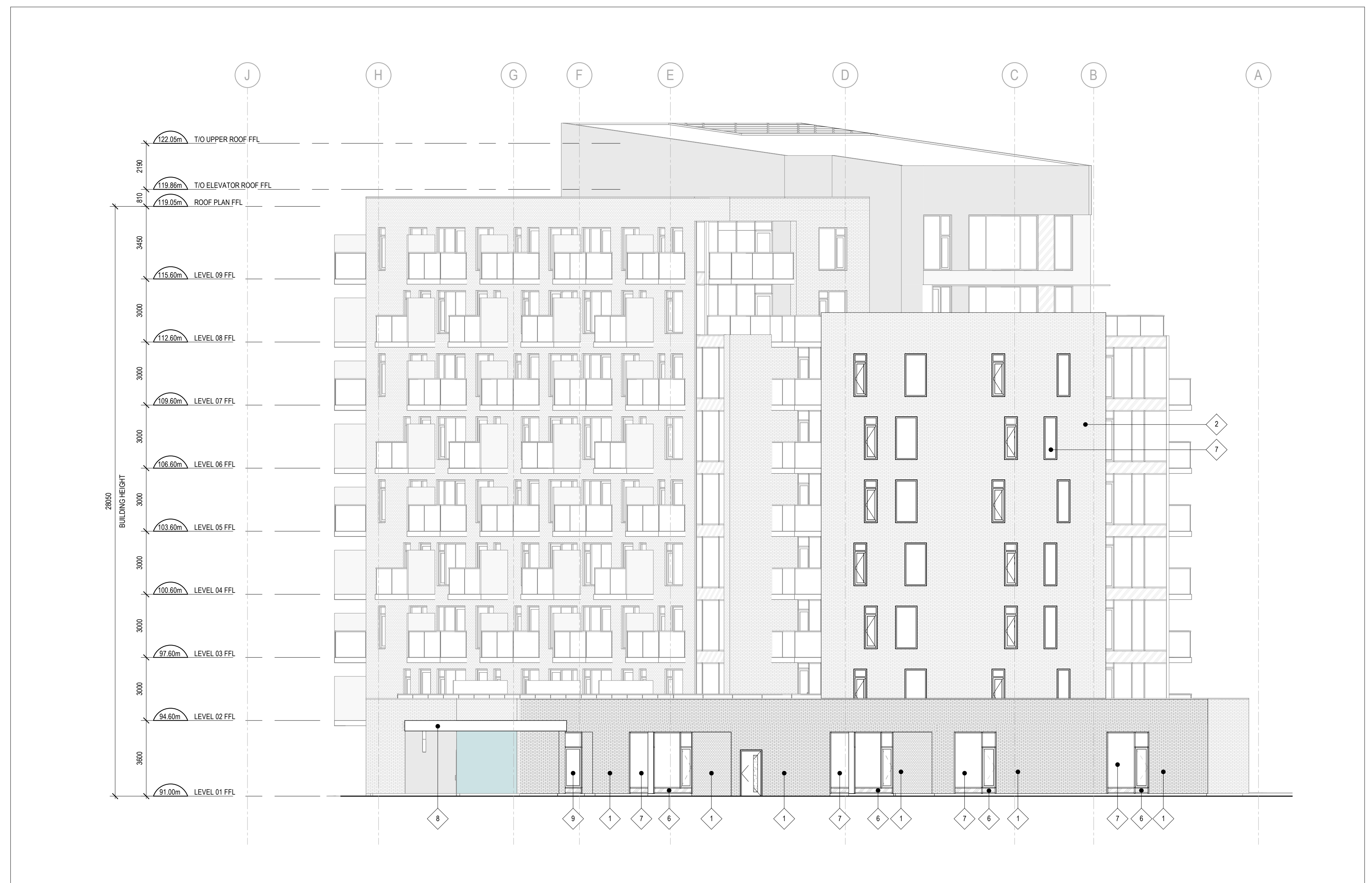
1 SOUTHEAST ELEVATION A202 SCALE: 1 : 125