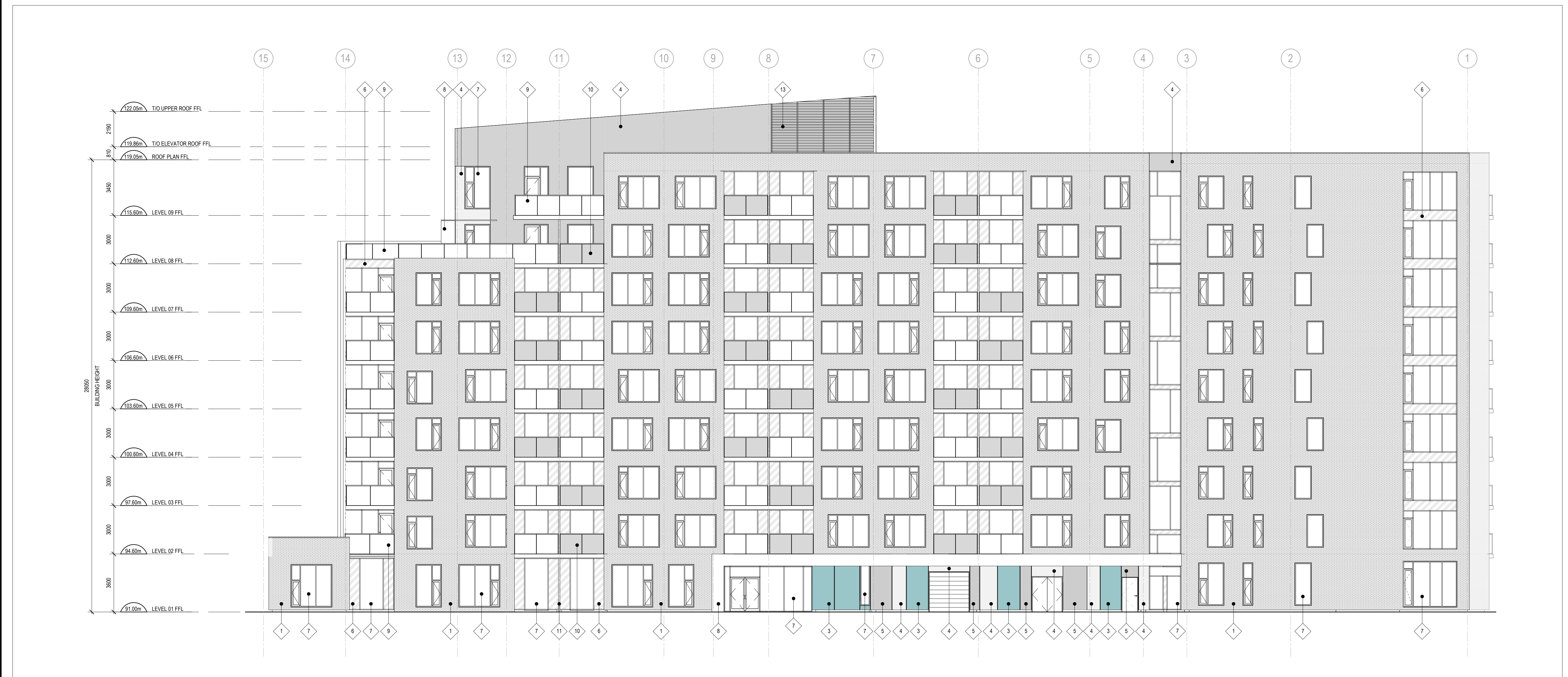
1 NORTH ELEVATION SCALE: 1 : 125