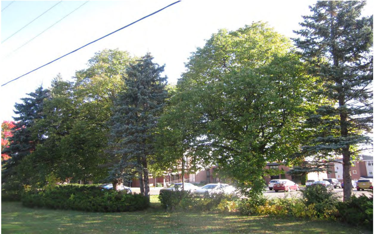
Picture 2. Private trees # 9 through 14 (right to left) at 2345 Alta Vista Drive (looking northward)