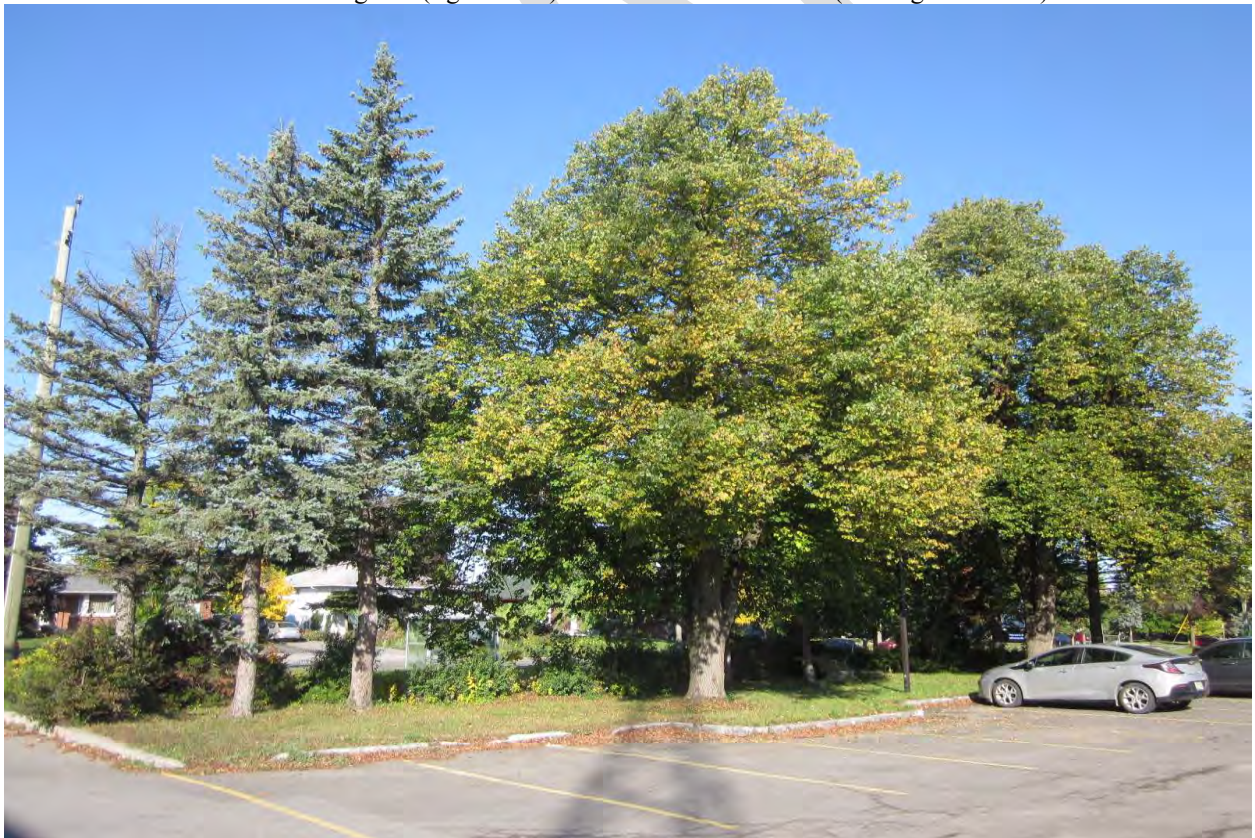
Picture 3. Private trees #8, 9, 10, 11 and 14 (left to right) at 2345 Alta Vista Drive (looking westward)