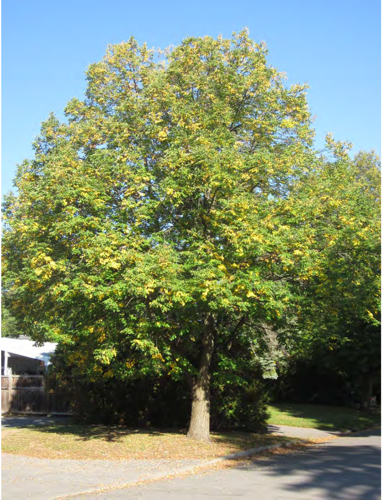
Picture 9. City tree #36 adjacent to 2270 Braeside Avenue (tree is to be removed for new driveway)