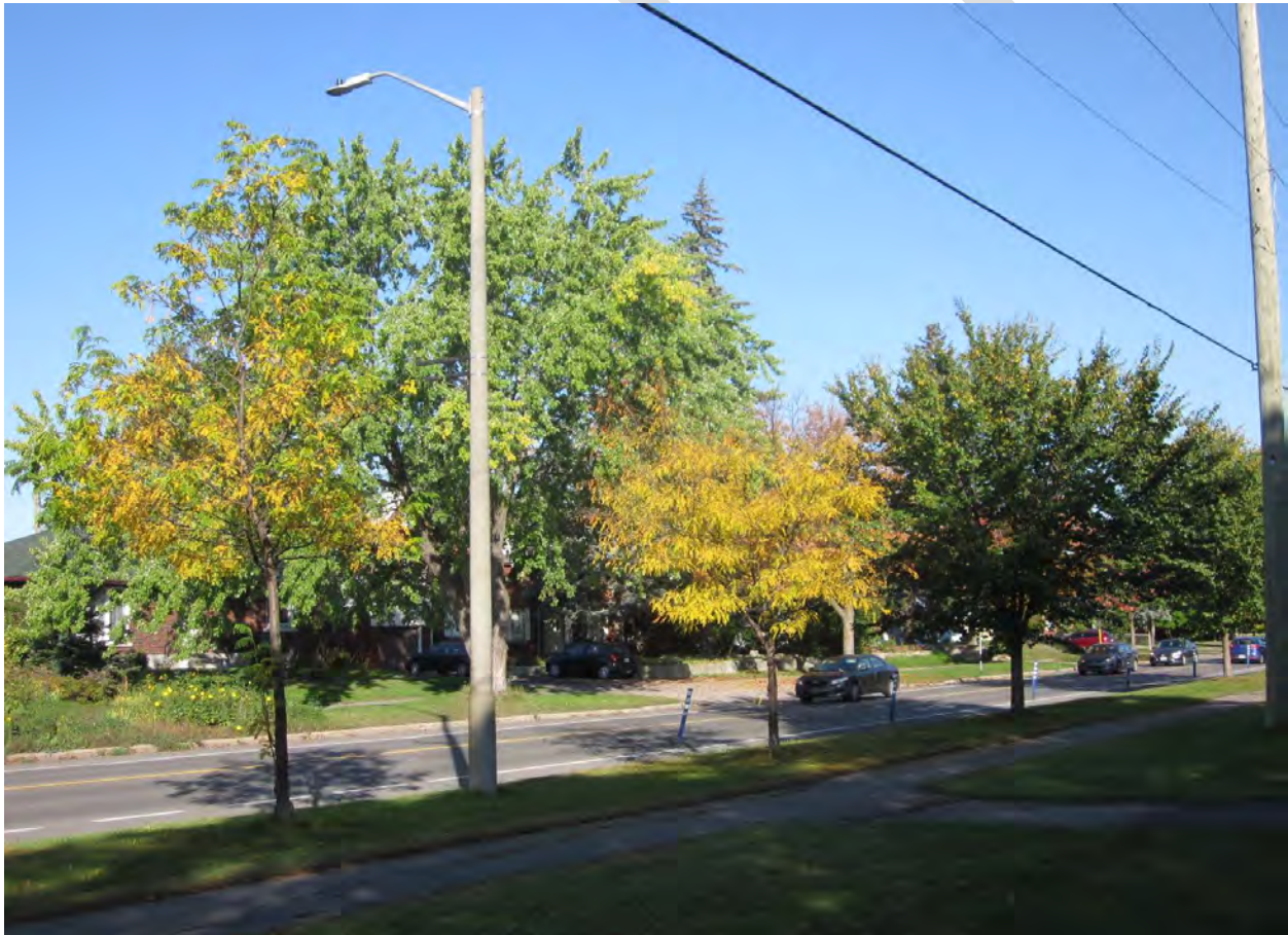
Picture 1. City trees #3, 4 and 5 (right to left) adjacent to 2345 Alta Vista Drive