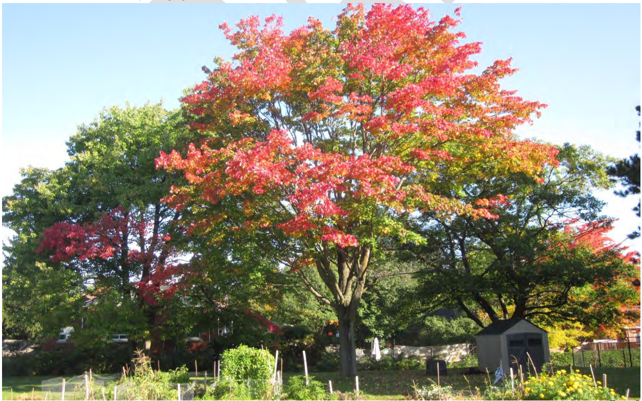
Picture 5. Private tree #20, 21 and 22 (left to right) at 2345 Alta Vista Drive