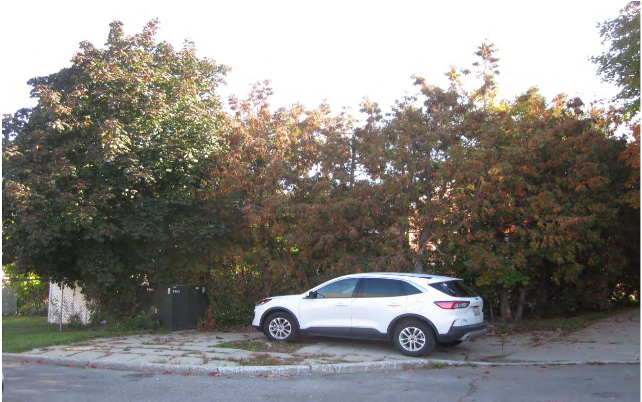
Picture 7. Private trees #25 and 26 (left to right) at 2270 Braeside Avenue