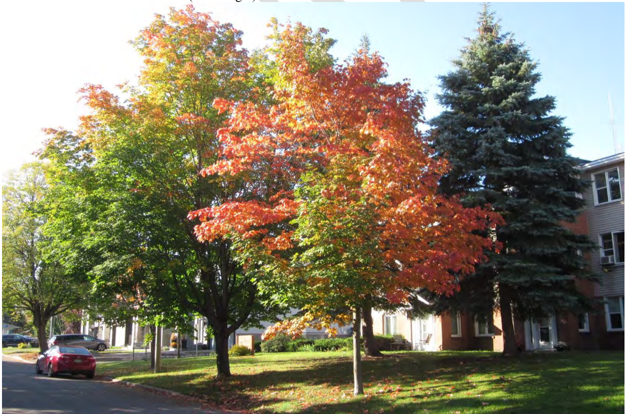
Picture 8. City trees #30 and 33 and private tree #32 (left to right) at 2270 Braeside Avenue