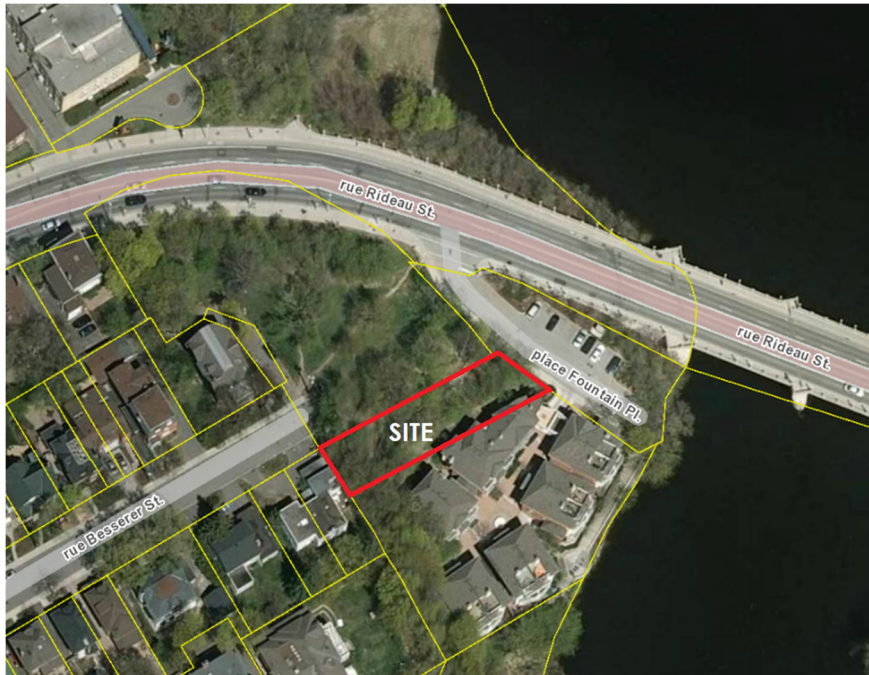
Figure 1: Location Plan

TC United Group have commissioned Stantec Consulting Ltd. to prepare a servicing study in support of the Site Plan Control submission of the proposed development located at 244 Fountain Place (formerly 244 Rideau Place). The site is situated southwest of the intersection of Rideau Street and Fountain Place within the City of Ottawa. The proposed infill development would replace a vacant property with a three-storey apartment building comprising a total of 20 residential units. The conceptual site development plan used for the purpose of this servicing brief is shown as Figure 1 . The 0.072ha (0.177 acre) site is currently vacant property. The site is presently zoned residential fifth density, subzone B, which permits the proposed development plan. The intent of this report is to provide a servicing scenario for the site that is free of conflicts, provides on-site servicing in accordance with City of Ottawa design guidelines, and utilizes the existing local infrastructure in accordance with the guidelines outlined per consultation with City of Ottawa staff.