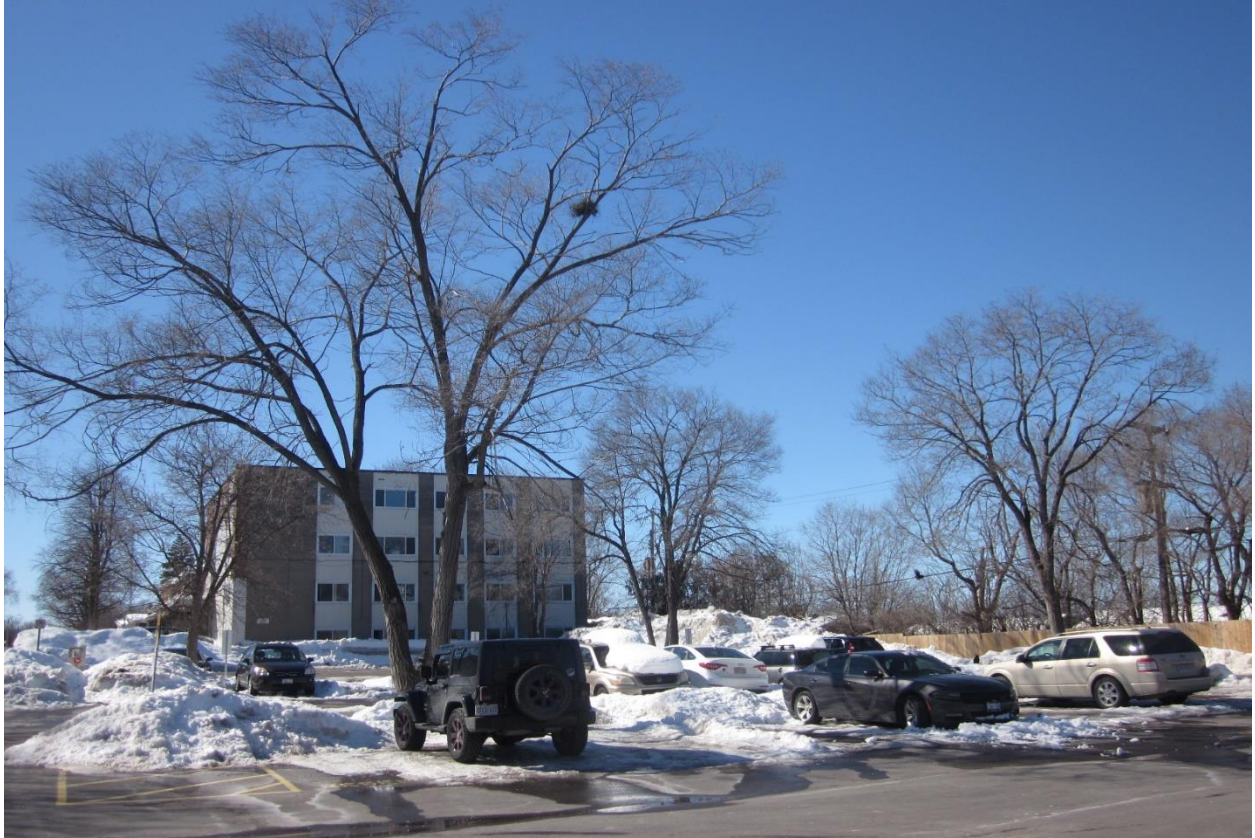
Picture 1. Private trees #1-5 located at 1435 & 1455 Morisset Avenue