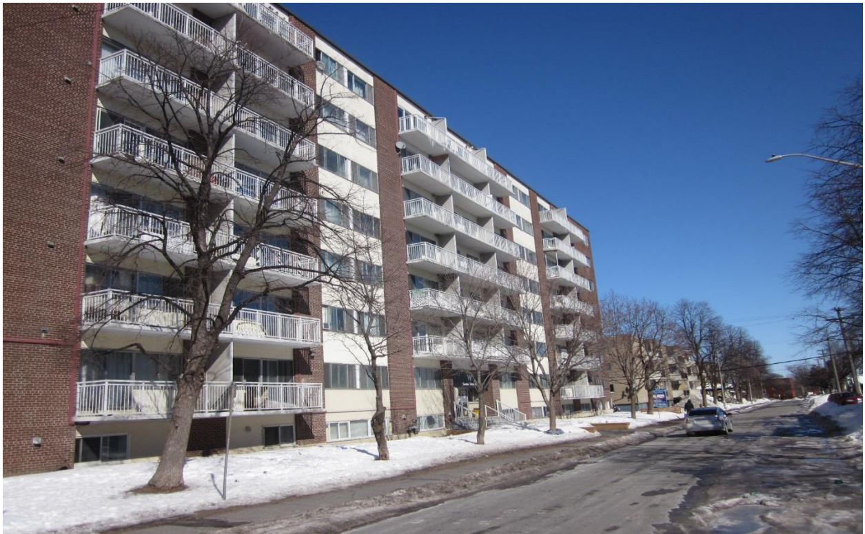
Picture 2. City owned trees #9-14 (left to right) adjacent to 1435 Morisset Avenue