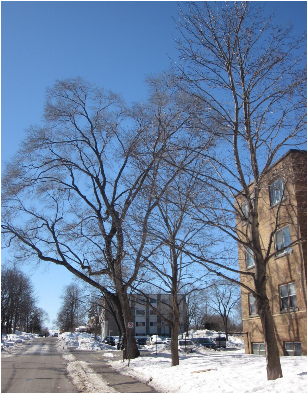
Picture 3. City owned trees #6, 7 and 8 (left to right) adjacent to 1455 Morisset Avenue