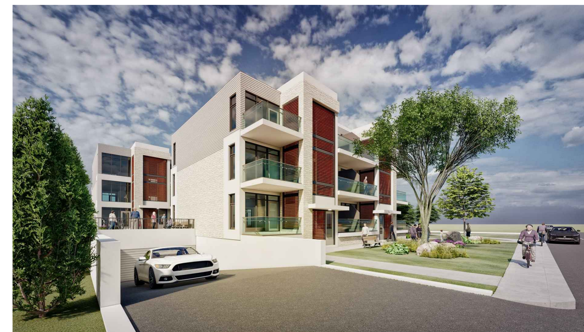
3 VIEW FROM THE SOUTH- EAST ( CHEMIN TENTH LINE ROAD) A401 SCALE = N/A