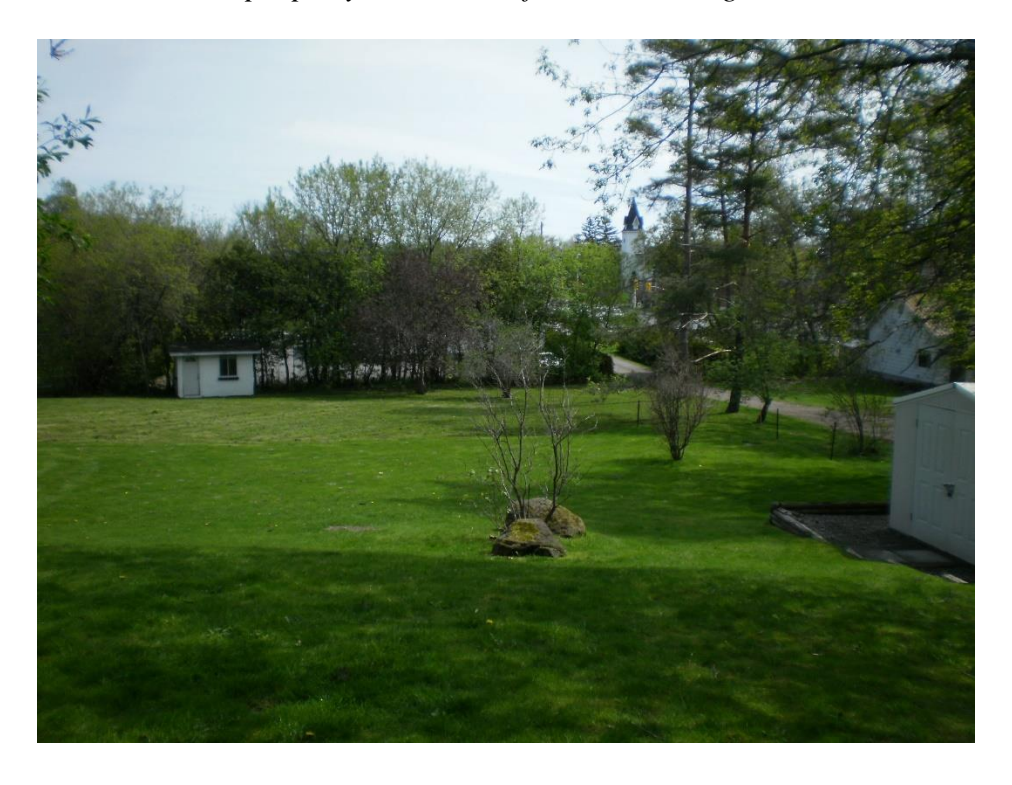
Photo 4 – South portion of the site. View looking east from west site edge