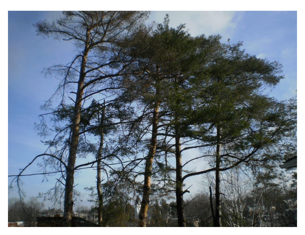
Photo\ 2-Scot's\ pines\ between\ 1164\ and\ 1166\ Highcroft\ Drive,\ south\ of\ Highcroft\ Drive. View\ looking\ east