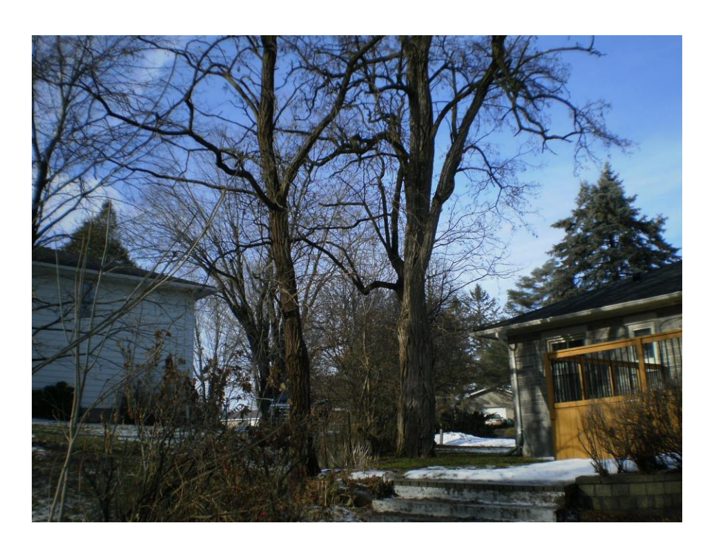
Photo 3 – Mature locust in the west portion of 1166 Highcroft Drive, with smaller locust along the west property line to the left. View looking northwest