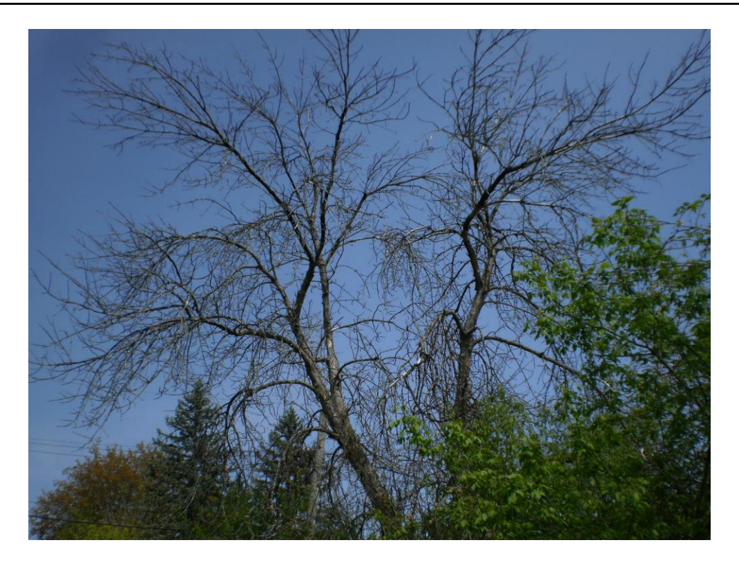
Photo 7 – White ash with no live buds of note, smaller Manitoba maple, and vines along the east property line south of Highcroft Drive. View looking north to Highcroft