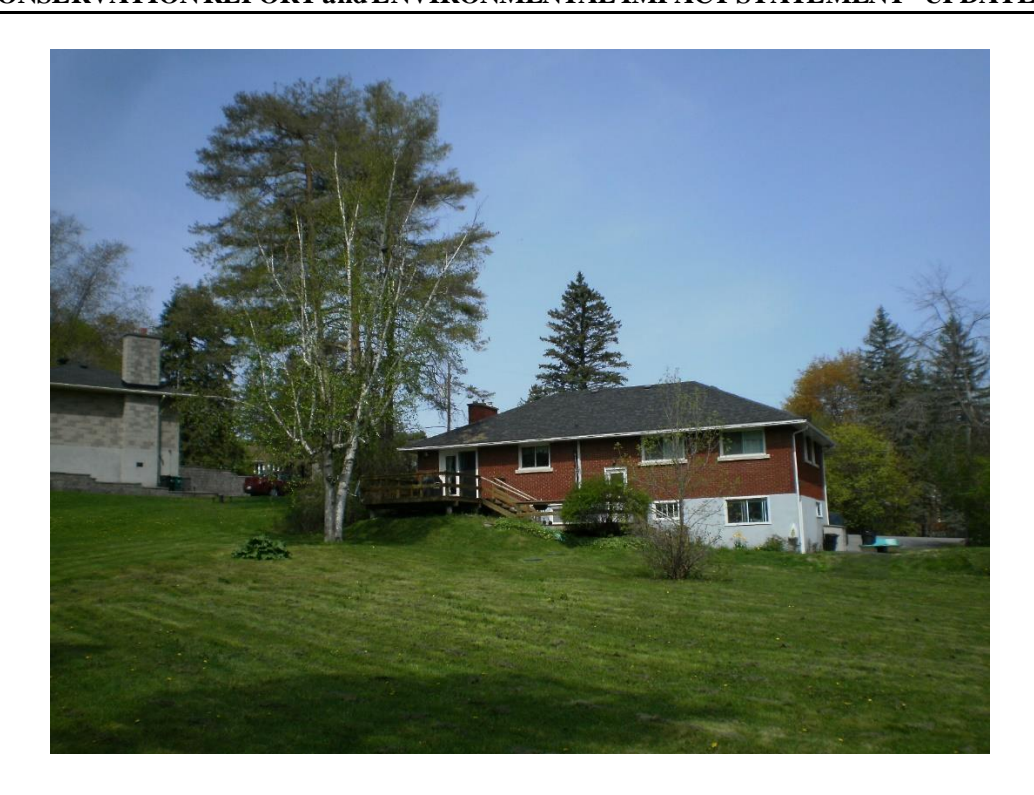
Photo 5 – South portion of 1164 Highcroft Drive. From southeast corner of the site view looking north to residence to be removed