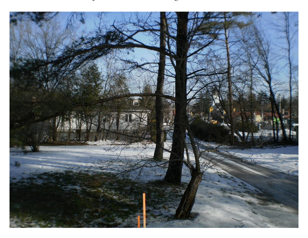
Photo 6 – Scot's pines immediately to the south of the site. View looking east