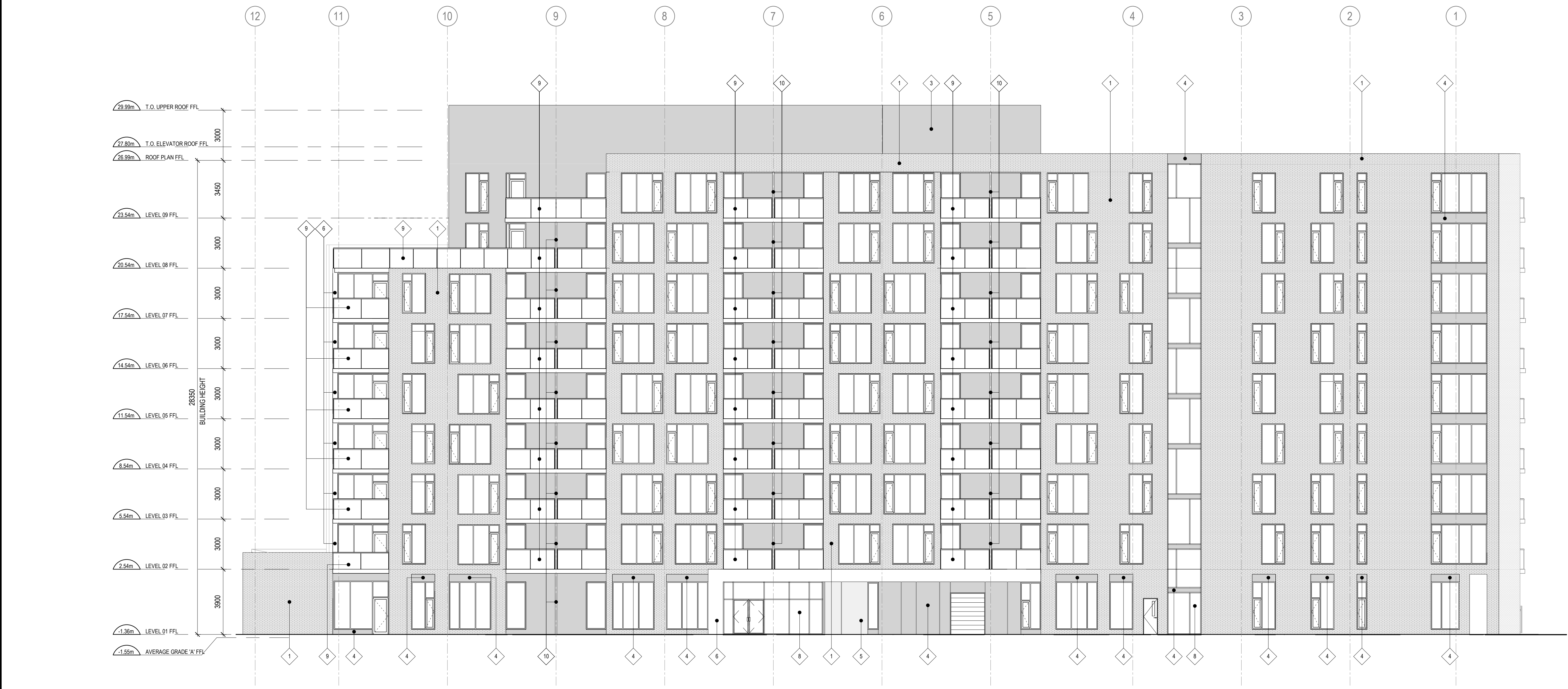
1 NORTH ELEVATION A201 SCALE: 1 : 125