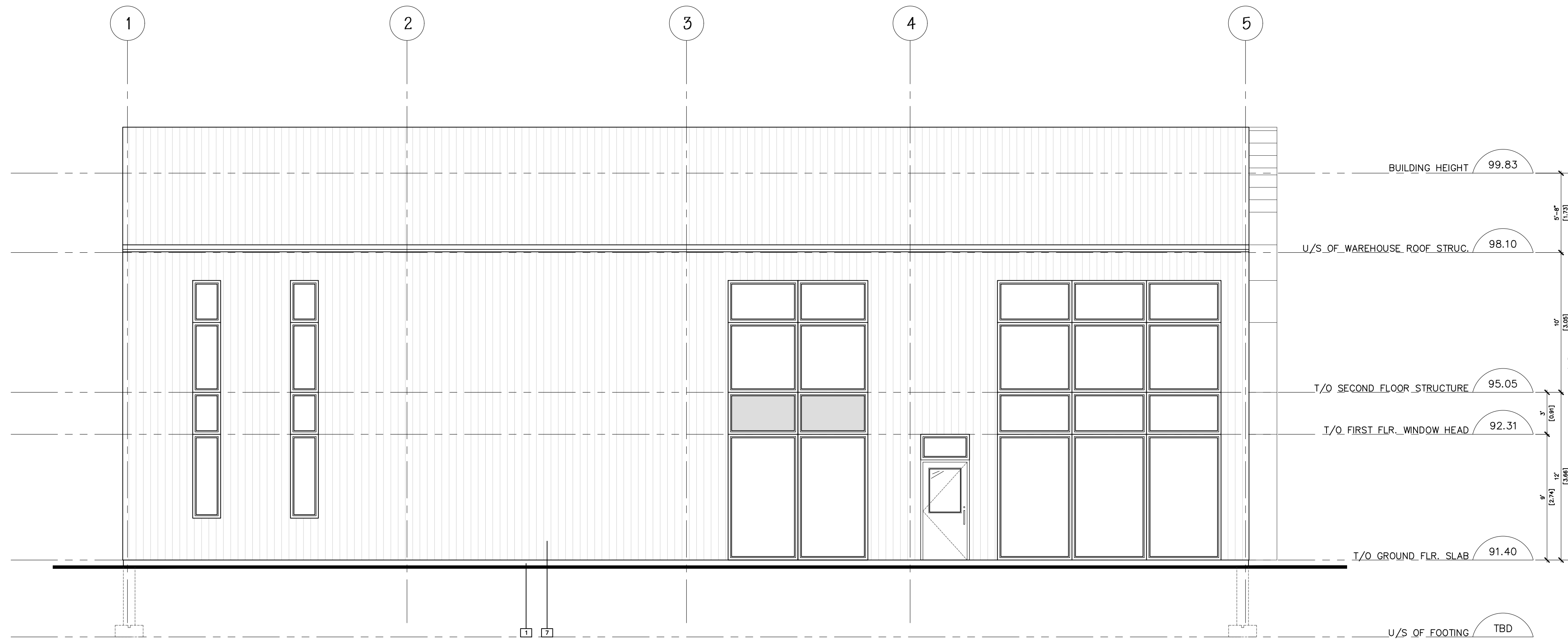
02 SIDE [EAST] ELEVATION A4.1 SCALE: 3/16" = 1'-0"