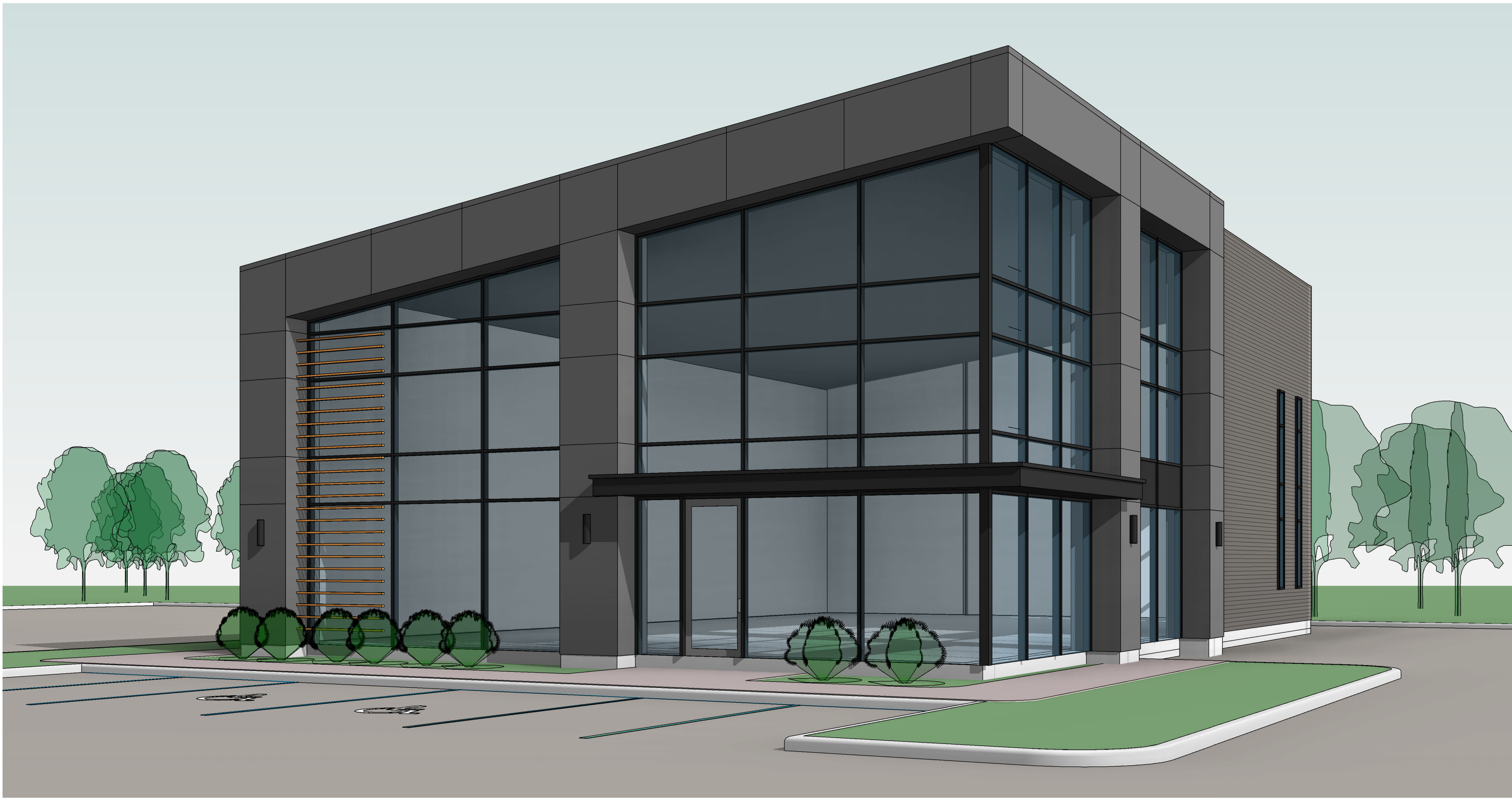
1 OPTION 6 A4.2 SCALE