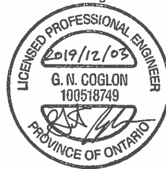
Mechanical Engineer's Seal