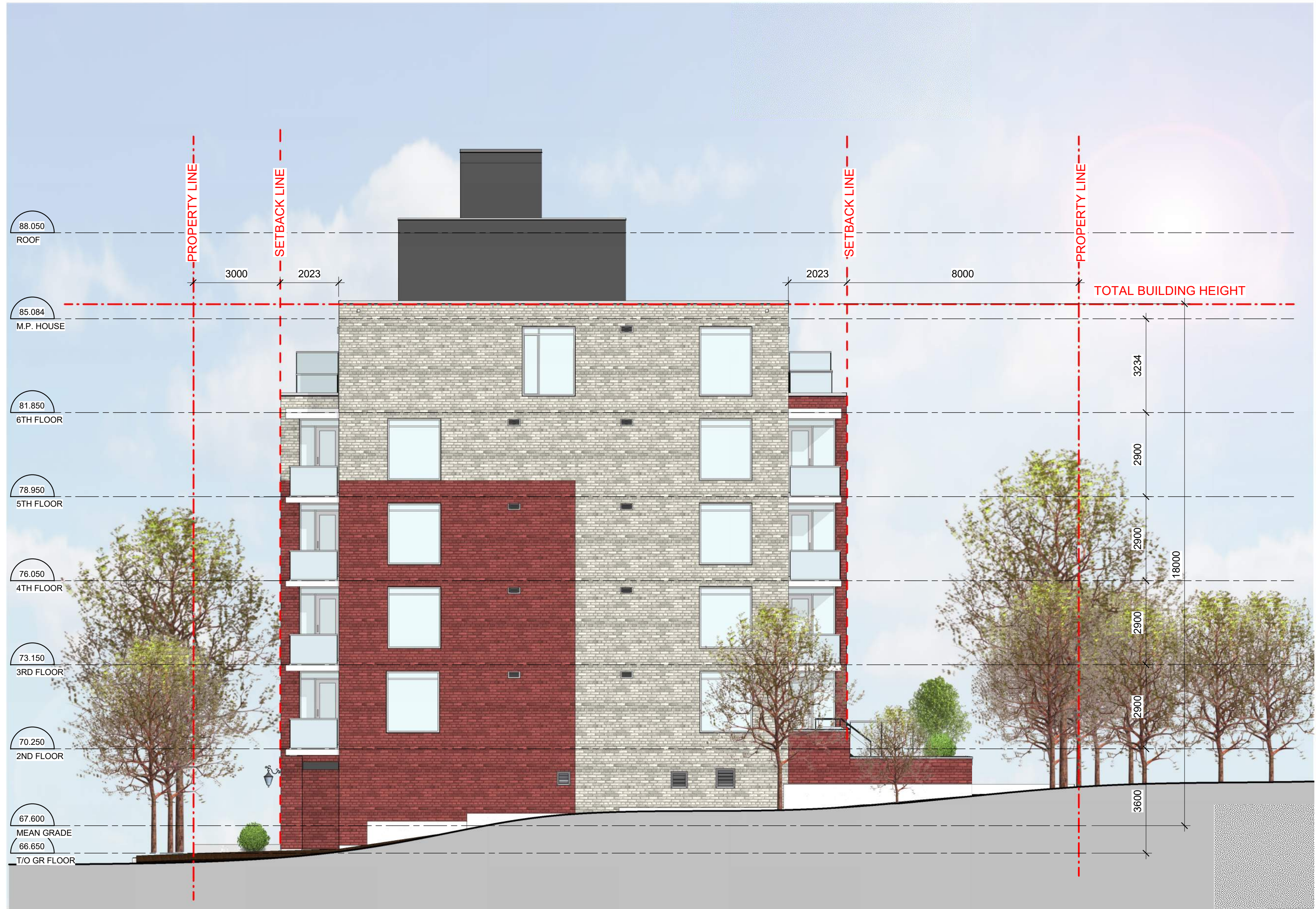
2 A 202 WEST ELEVATION. 1 : 100

IT IS THE RESPONSIBILITY OF THE APPROPRIATE CONTRACTOR TO CHECK AND VERIFY ALL DIMENSIONS ON SITE AND TO REPORT ALL ERRORS AND/OR OMISSIONS TO THE ARCHITECT. ALL CONTRACTORS MUST COMPLY WITH ALL PERTINENT CODES AND BY-LAWS. THIS DRAWING MAY NOT BE USED FOR CONSTRUCTION UNTIL SIGNED BY THE ARCHITECT. DO NOT SCALE DRAWINGS. COPYRIGHT RESERVED.