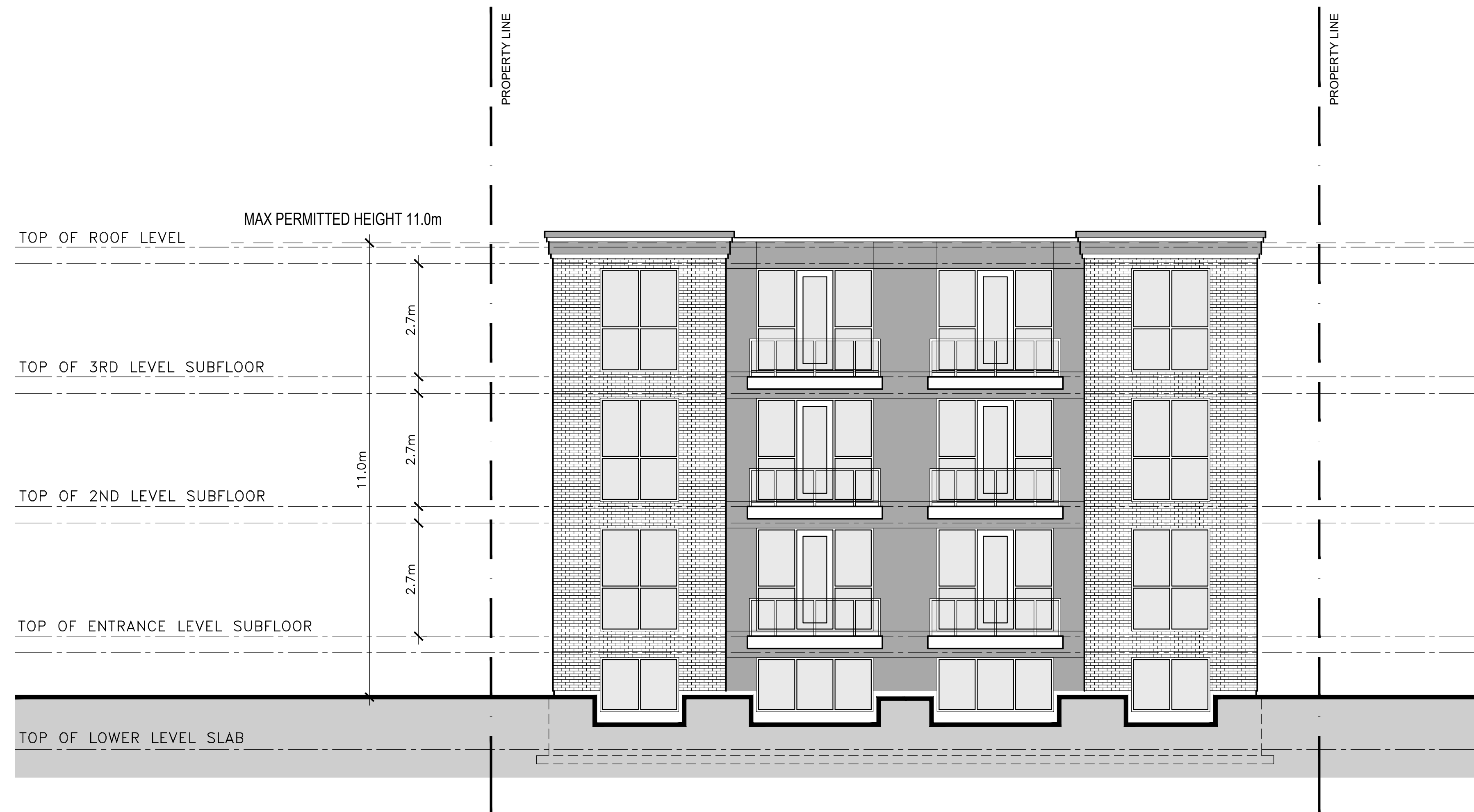
1 REAR ELEVATION SCALE = 1:75