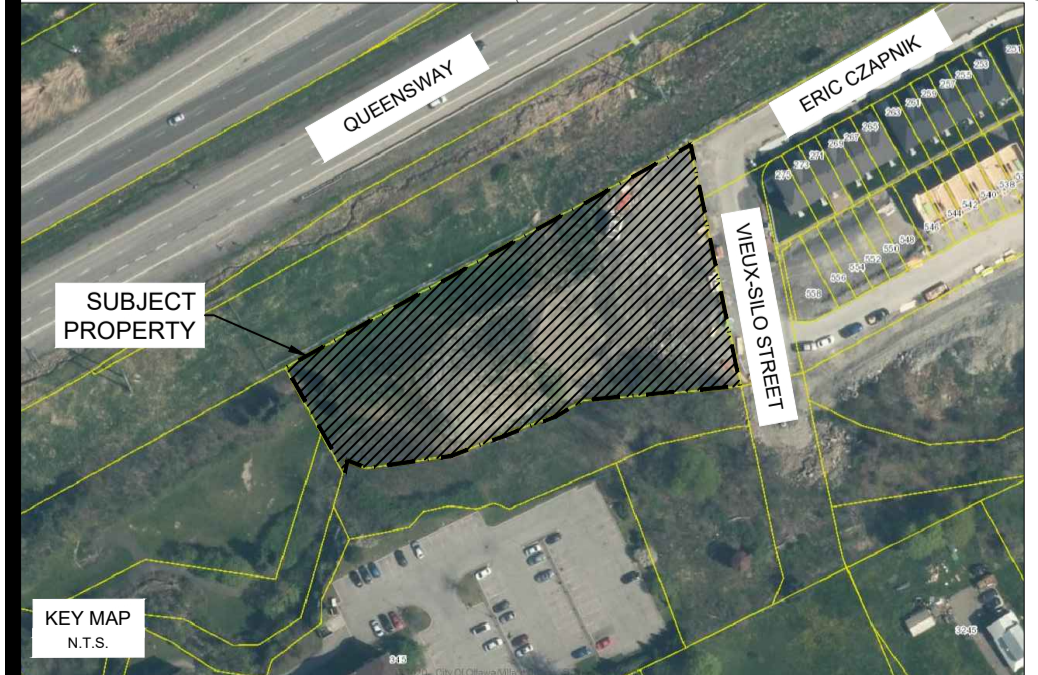
KEY MAP N.T.S.

PROJECT NO. 200041 DATE: APRIL 2020 C601