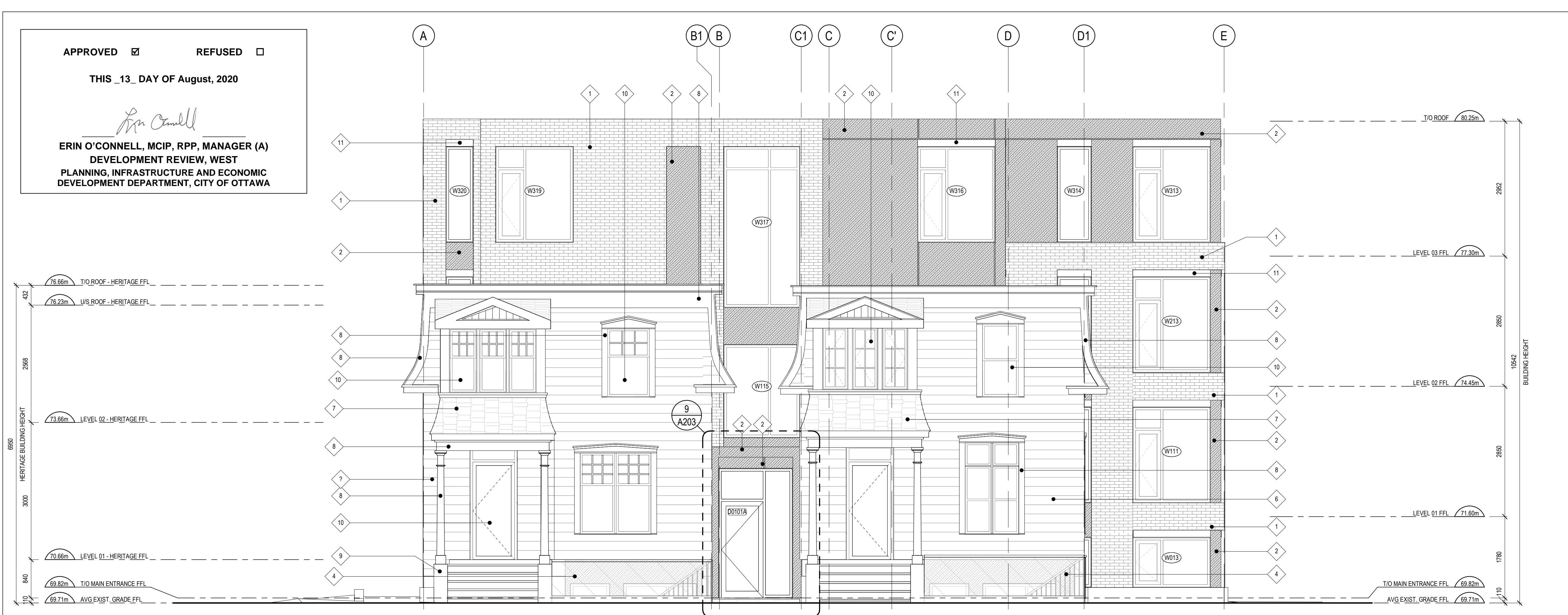
2 WEST ELEVATION A201 SCALE: 1 : 50