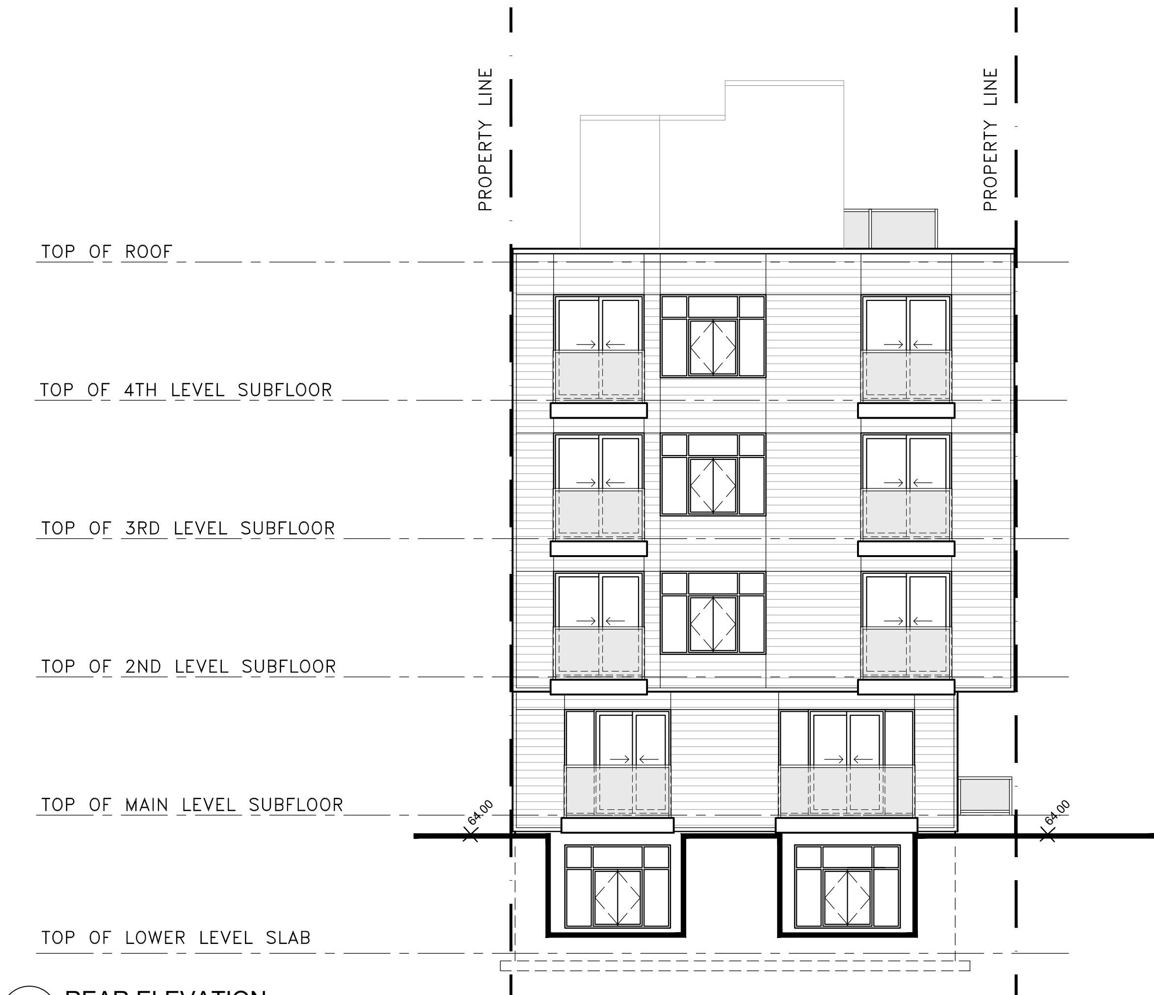
1 REAR ELEVATION SCALE = 1:75 A201