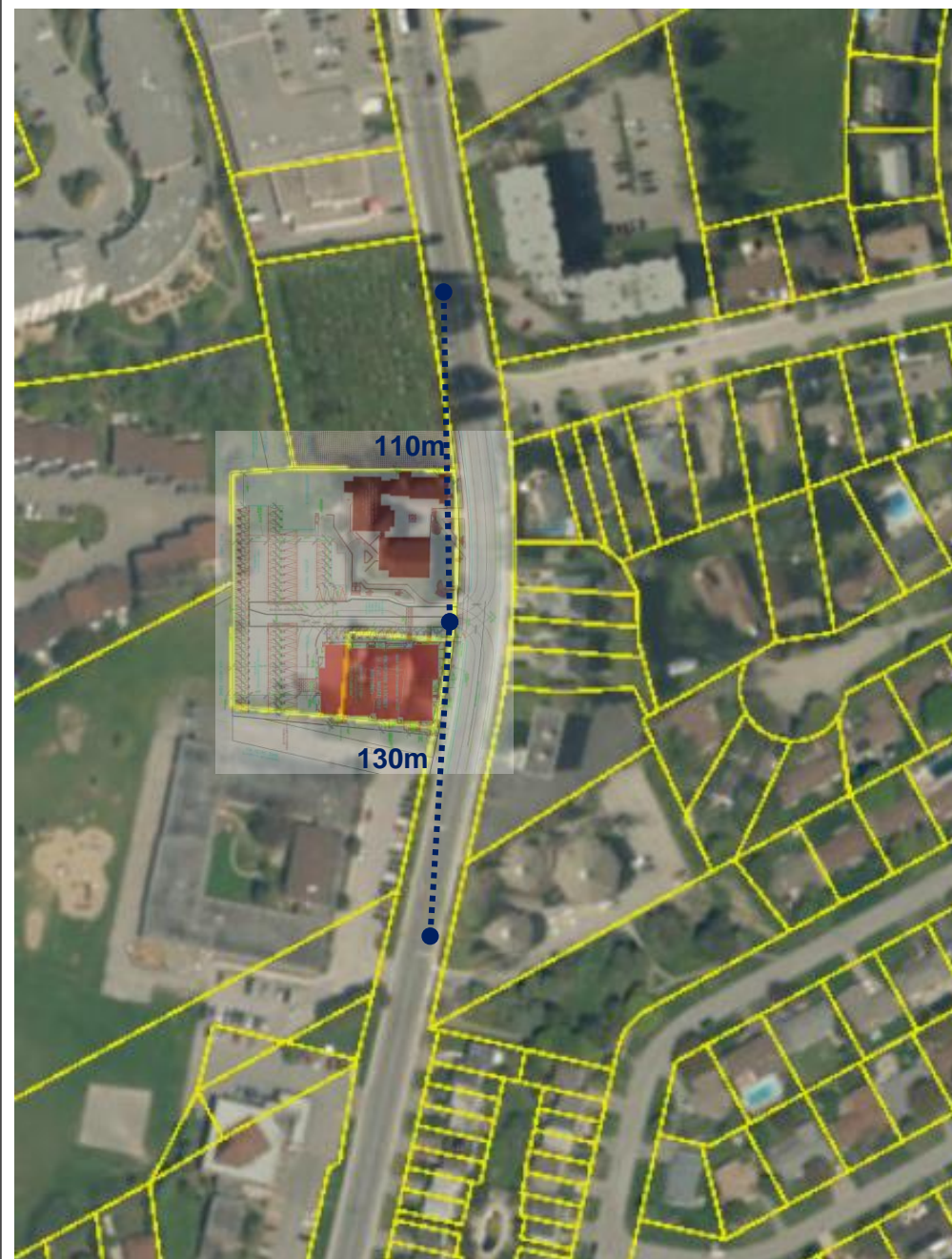
Intersection Sight Distance