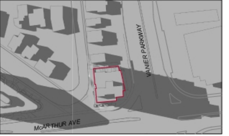
JUNE 20, 5:30pm