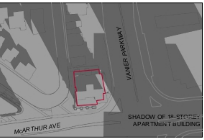
DEC 20, 10:00am

Rosaline J. Hill Architect Inc. Architect & Development Consultant www.rjhill.ca | info@rjhill.ca