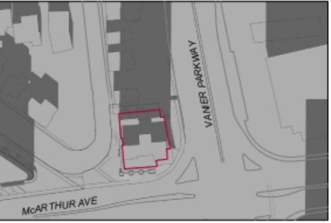
DEC 20, 12:00pm