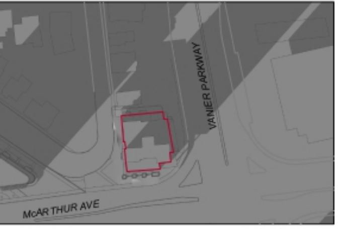
DEC 21, 3:00pm