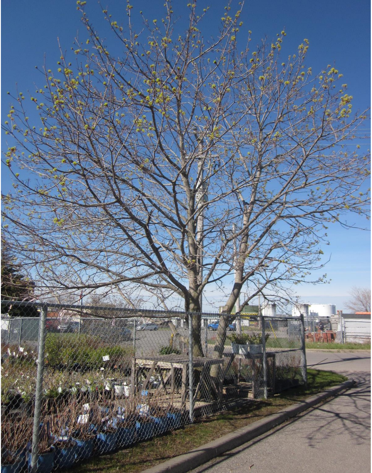
Picture 1. Norway maple adjacent to 7 Tristan Court / 35 Gifford Street