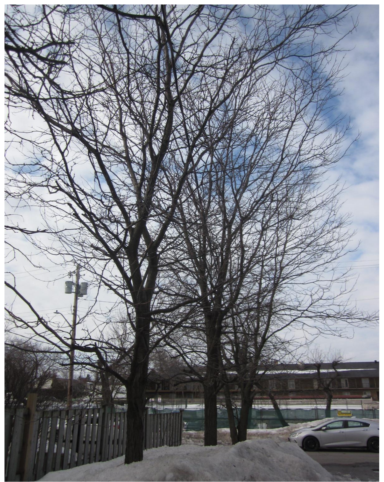
Picture 1. Trees #1, 2 and 3 (background to foreground) located at 1330 Carling Avenue, Ottawa