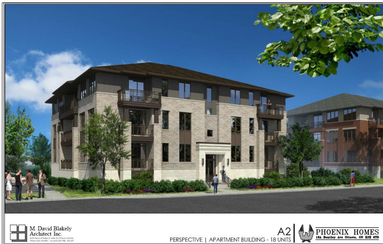
Figure 4- Perspective, Apartment Units