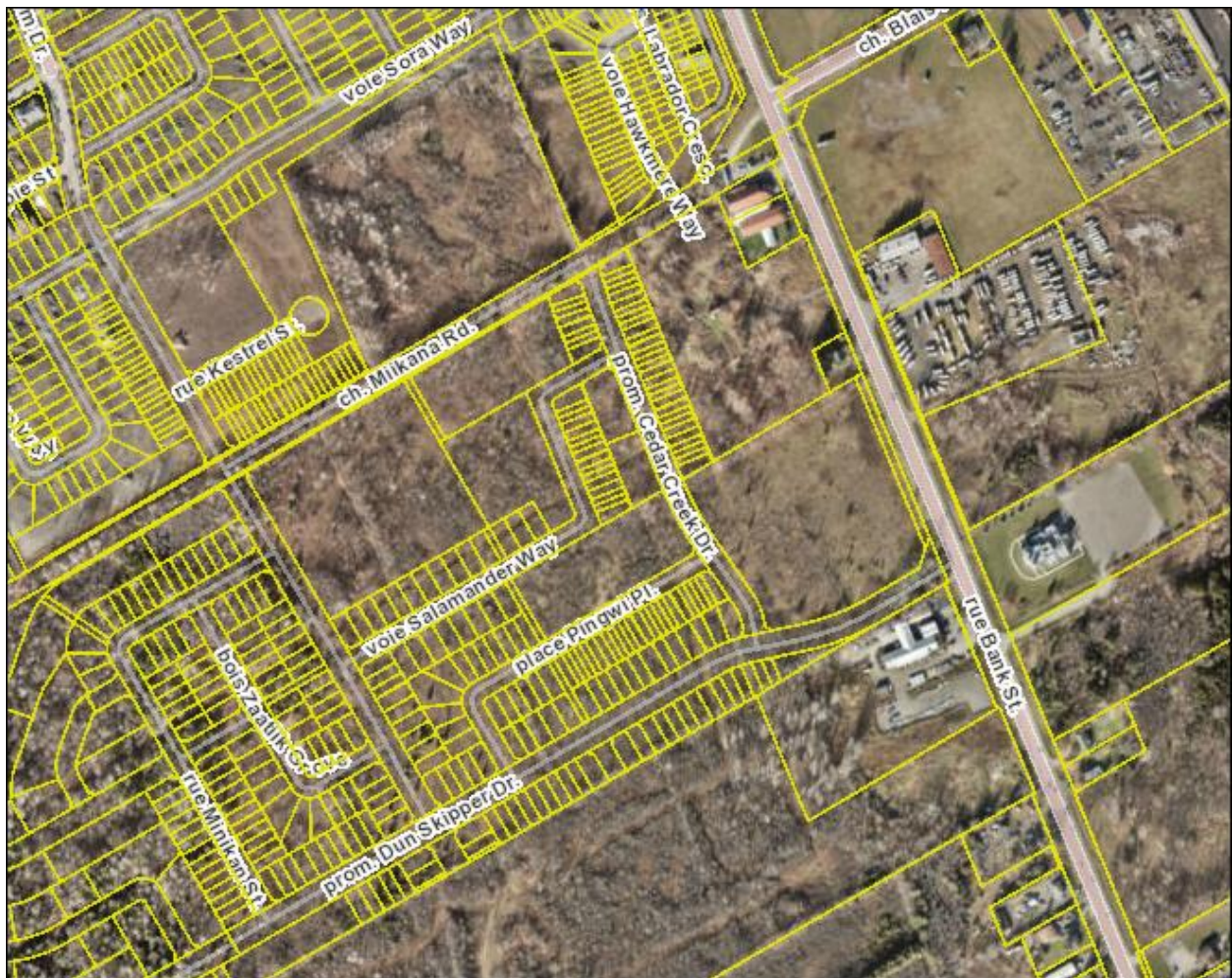
Figure 2. Pathways Subdivision Surrounding Development Environment

The subdivision plan was registered in February 2019 following the adoption, in 2017, of a comprehensive zoning by-law amendment in association with the draft plan of subdivision approval. Block 232 is zoned Residential R4Z [2370] and is