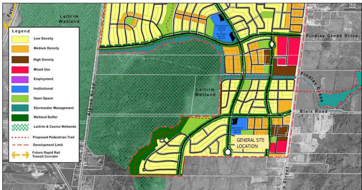
Figure 6. Excerpt, Leitrim Community Design Plan-General Site Location

The proposed development is consistent with the intent of the CDP which emphasizes “..a mix of land uses and housing types, in a compact and mixed-use form, that cluster neighbourhood facilities and services, and that have excellent pedestrian and transit connections.”