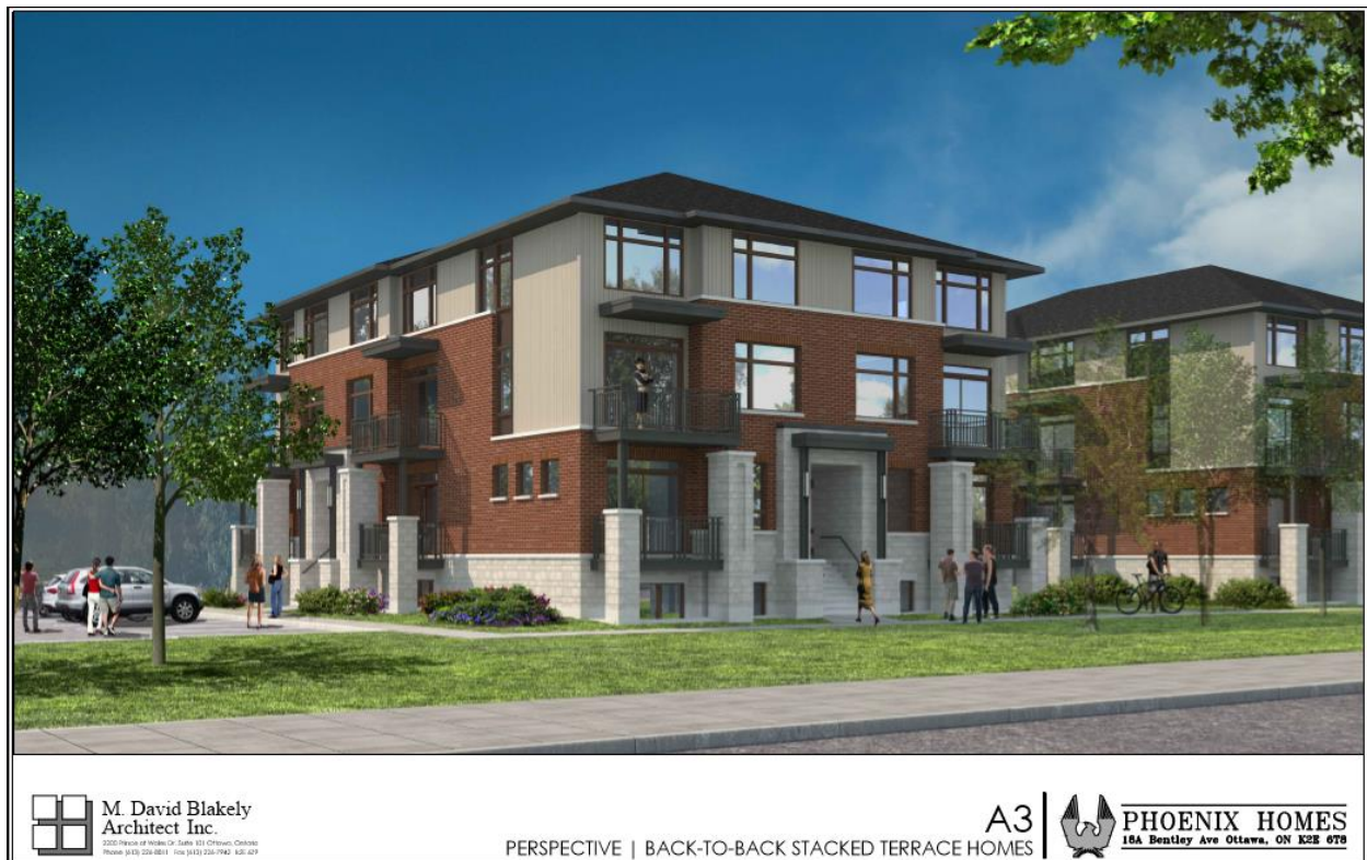
Figure 4- Perspective, Apartment Units

The architectural detail of each building type will complement the contemporary character of other developments within the Pathways development and will contribute positively to the urban design objectives that are advocated by the Leitrim Community Design Plan.