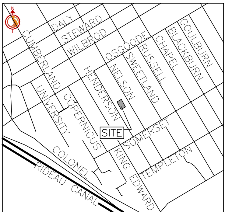
KEY PLAN N.T.S.