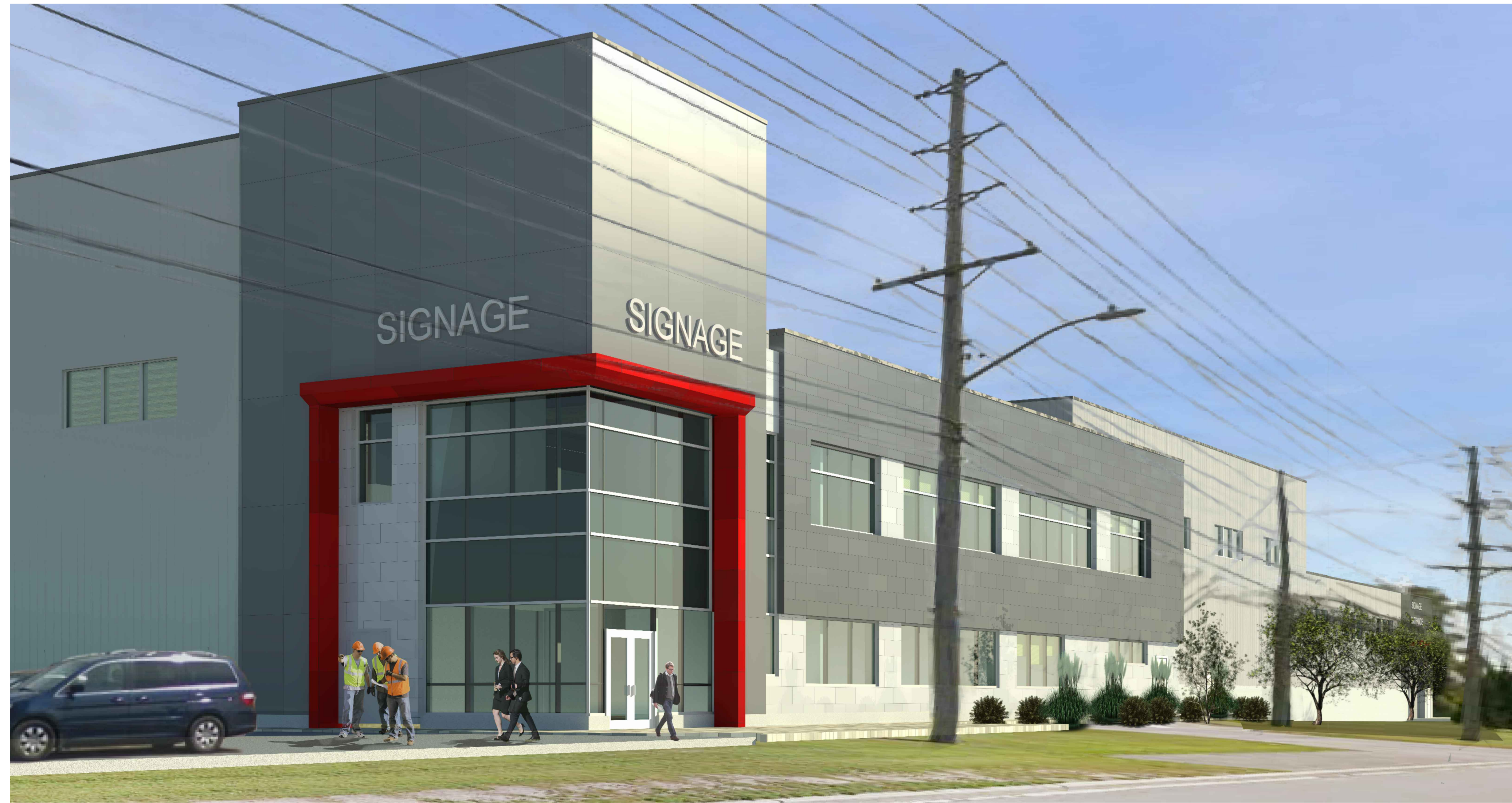
VIEW FROM SHEFFIELD ROAD