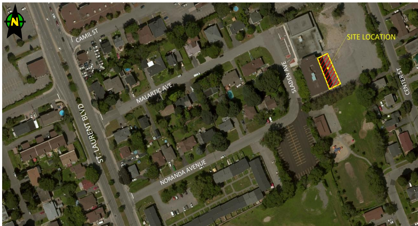
Figure 1: Key Map: 641 Sladen Avenue, Ottawa

The proposed development consists of a 335 m 2 3-Storey school addition to the existing building. Existing parking and drive aisles will remain throughout the site along with landscaping. The existing site accesses for the development will be maintained.