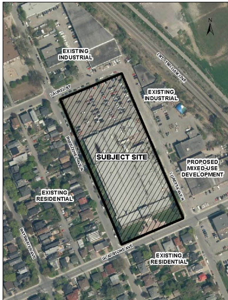
Figure 2 – Surrounding Context

of approximately 211 metres along Gladstone Ave. The subject parcel currently has one existing building which is used for light industrial, warehousing and office uses. This existing building represents approximately 54% of the total land area of the subject parcel. For the purpose of this application, the Site Plan and associated drawings represent the area immediately north of the existing building where the development is to occur. The parcel is currently fully serviced by municipal water and sanitary sewers along with stormwater management facilities. The site is presently fully developed by the client. This application is to alter the existing developed area.