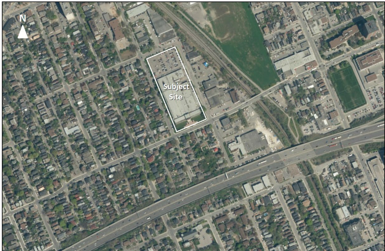
Figure 1 – Aerial View of the Canada Bank Note Property

The land that is the subject of this application for Site Plan Control is currently owned and utilized by Canada Bank Note. The entire property is known municipally as 975 Gladstone Avenue. The land is legally described as Lots 12 to 28 on Plan 92. There is currently no site plan approval.