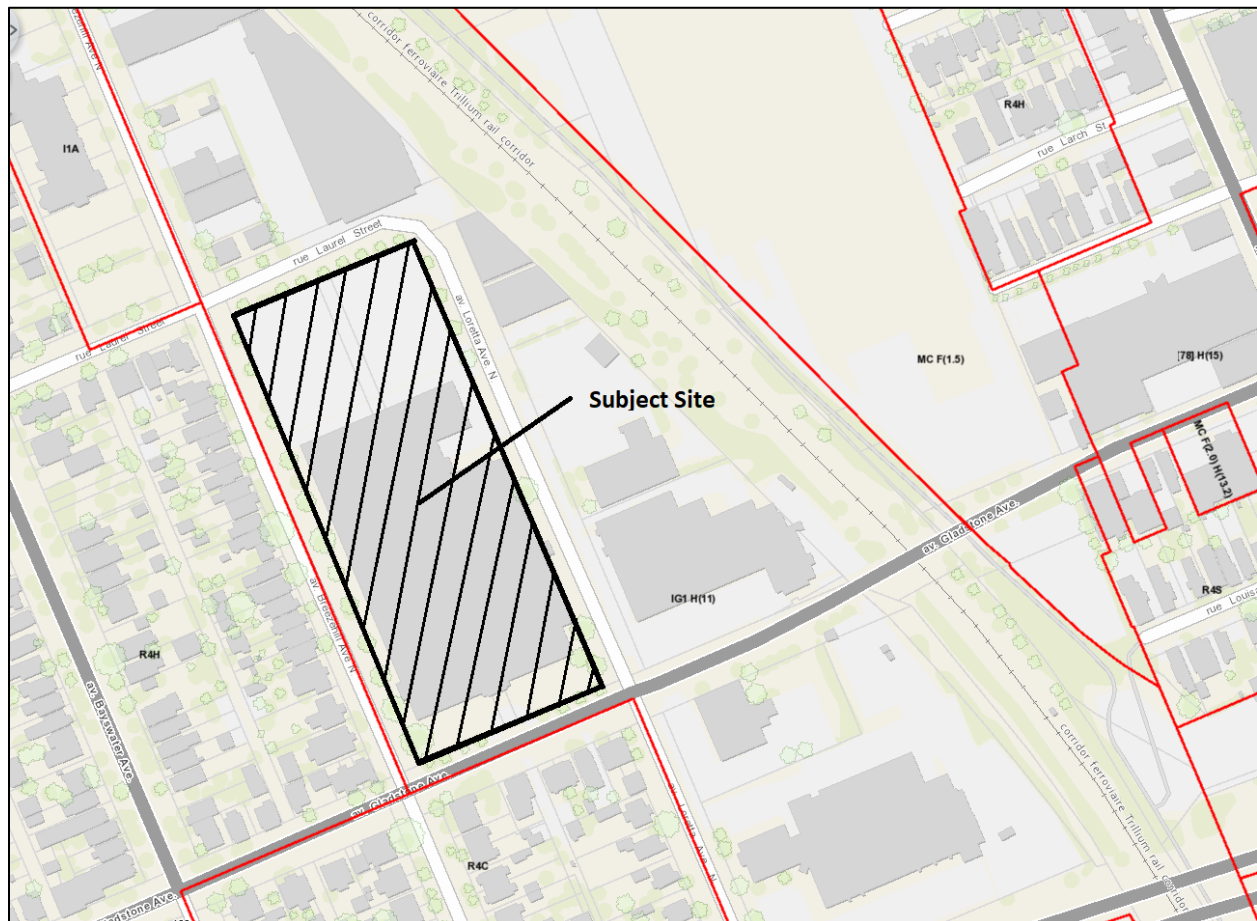
Figure 5 – City of Ottawa Zoning By-law 2008-250: IG1 H(11)

The required zoning provisions are indicated in a zoning matrix (Appendix 'B'), along with the provisions proposed for the development. The proposed Site Plan has been designed to comply with the zoning standards of the IG1 zone and all other relevant provisions including the General, Parking and Loading requirements.