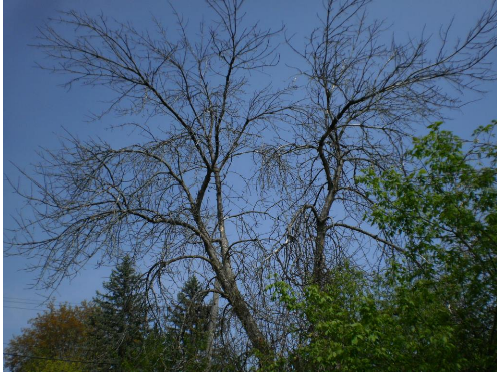
Photo 7 – White ash with no live buds of note, smaller Manitoba maple, and vines along the east property line south of Highcroft Drive. View looking north to Highcroft