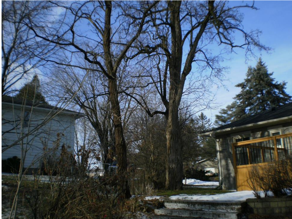
Photo 3 – Mature locust in the west portion of 1166 Highcroft Drive, with smaller locust along the west property line to the left. View looking northwest