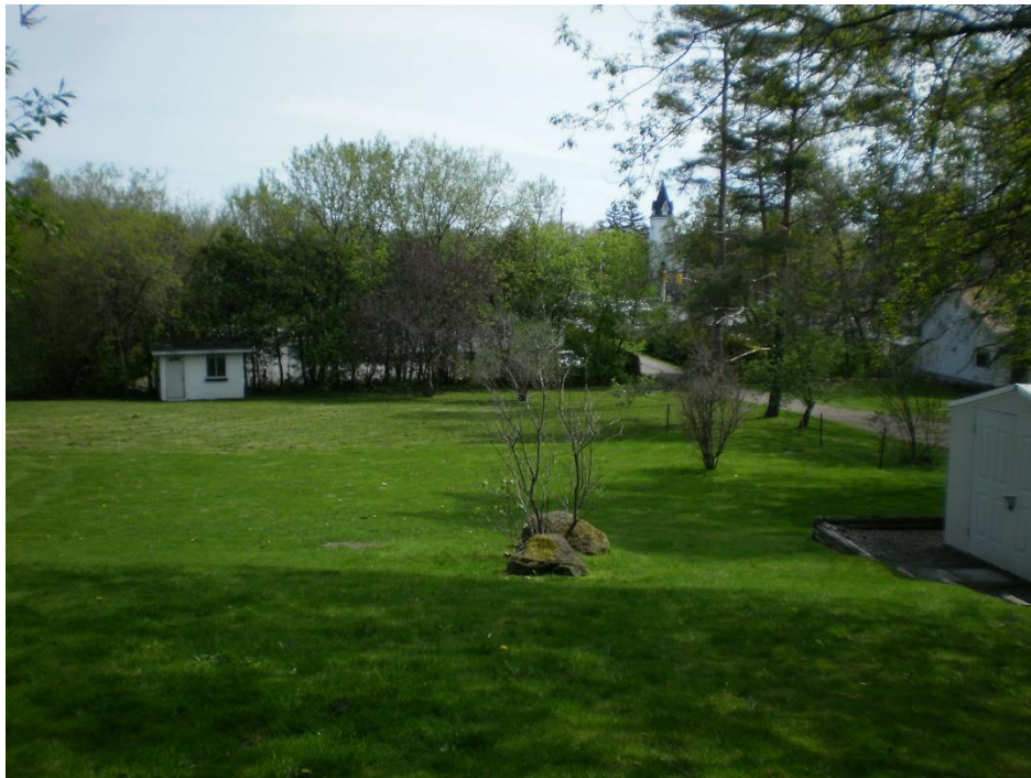
Photo 4 –South portion of the site. View looking east from west site edge