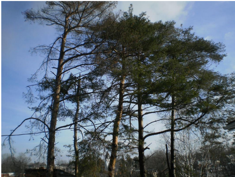
Photo 2 – Scot's pines between 1164 and 1166 Highcroft Drive, south of Highcroft Drive. View looking east