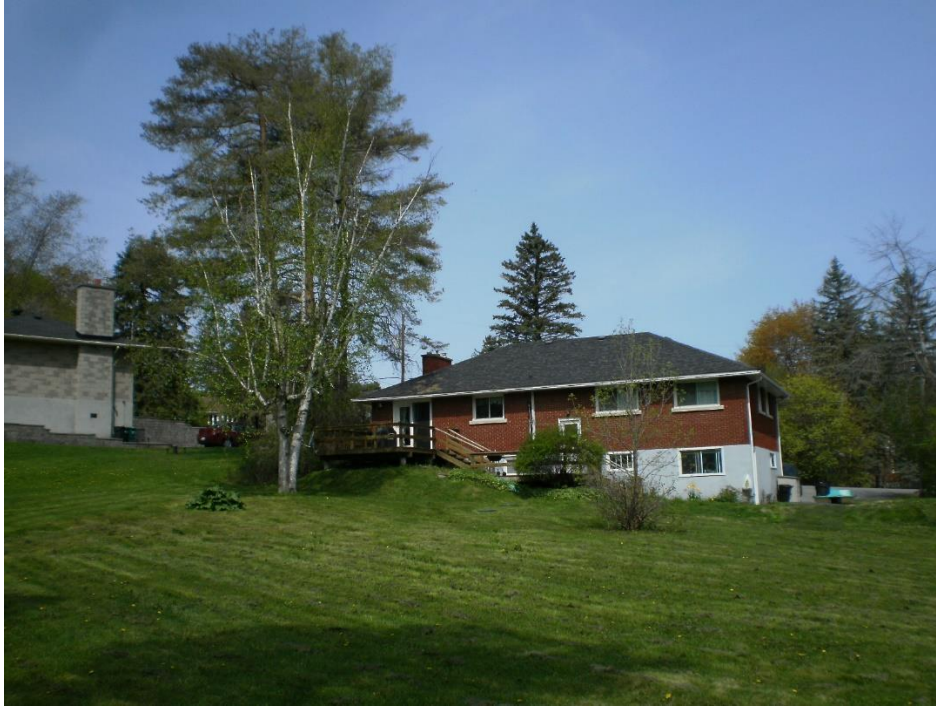
Photo 5 – South portion of 1164 Highcroft Drive. From southeast corner of the site view looking north to residence to be removed