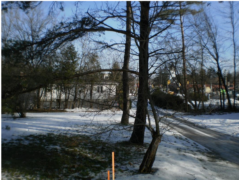
Photo 6 – Scot's pines immediately to the south of the site. View looking east