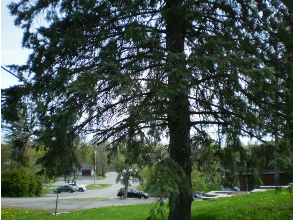
Photo 1 – Spruce tree in the front yard of 1166 Highcroft Drive. View looking east, with Highcroft Drive to the left