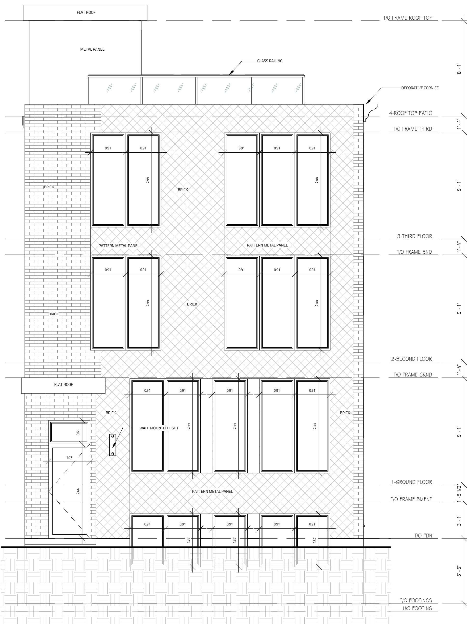
2 REAR ELEVATION SCALE: 1/4" = 1'-0"