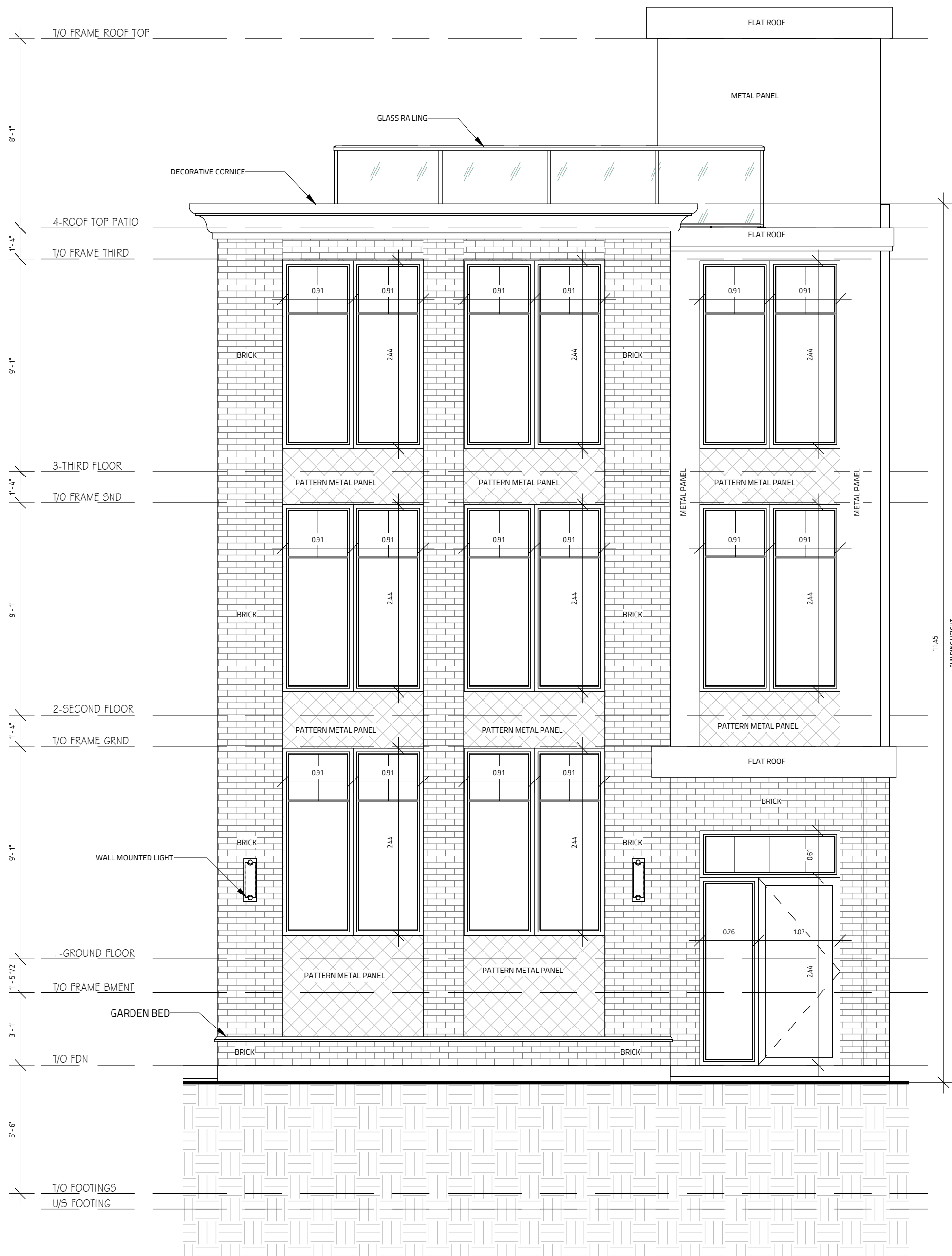
1 FRONT ELEVATION SCALE: 1/4" = 1'-0"