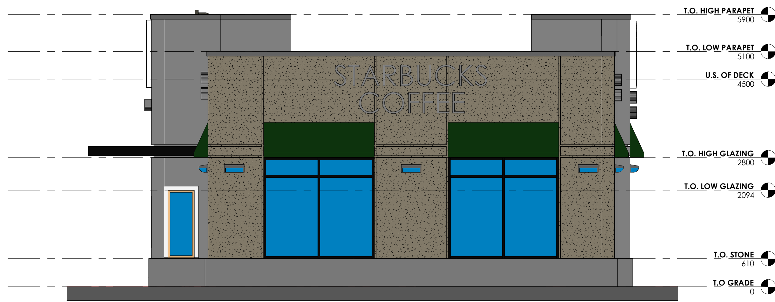
4 SOUTH ELEVATION A2.2 A3 1 : 50

All contractors and/or trades shall verify all dimensions, notes, site and report any discrepancies prior to commencement of the work. This drawing not to be scaled; all drawings, prints and related documents are the property of the architect and must be returned upon request. Reproduction of drawings and related documents in part or in whole is strictly forbidden without written consent. Drawings to be for the purpose for which they are issued.