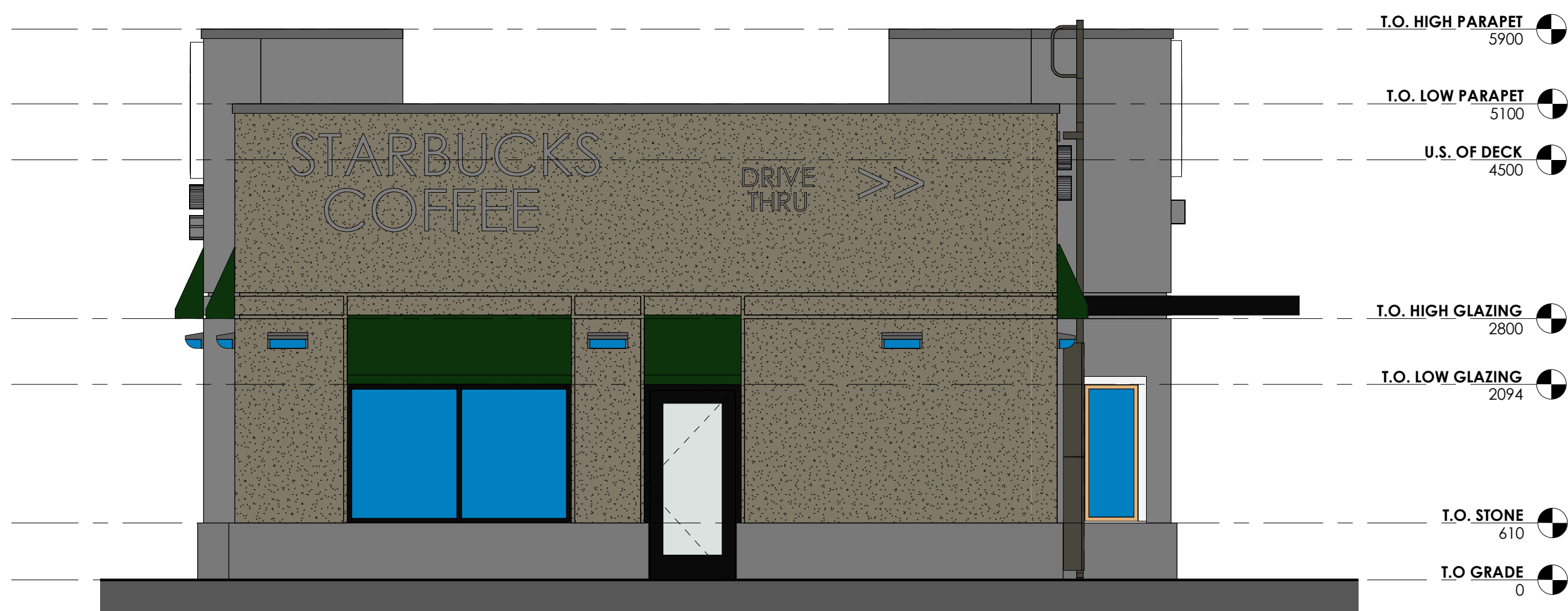
3 NORTH ELEVATION A2.2 A3 1 : 50