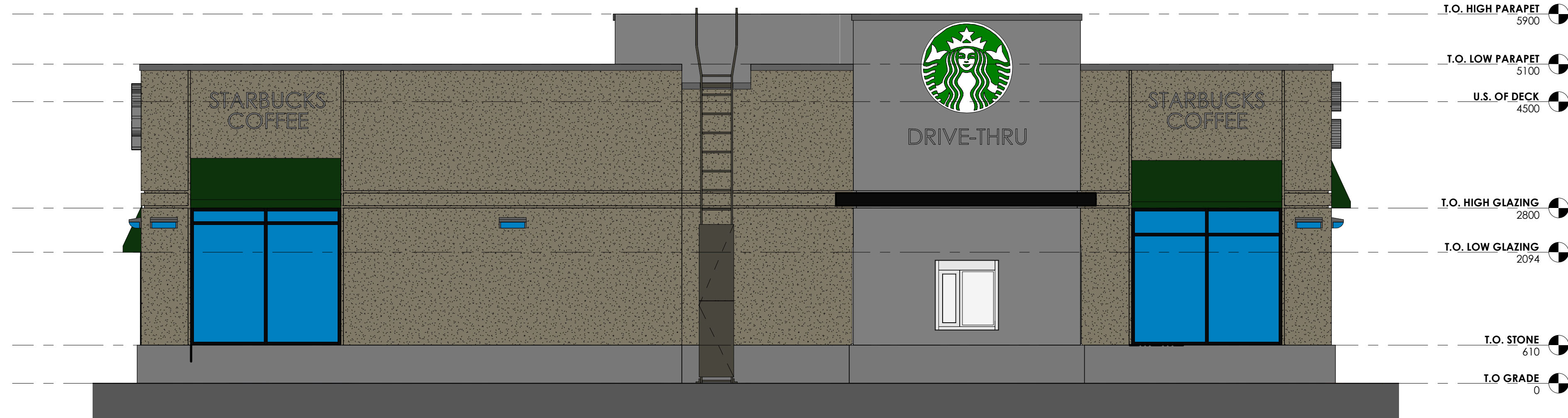
2 WEST ELEVATION A2.2 A3 1 : 50