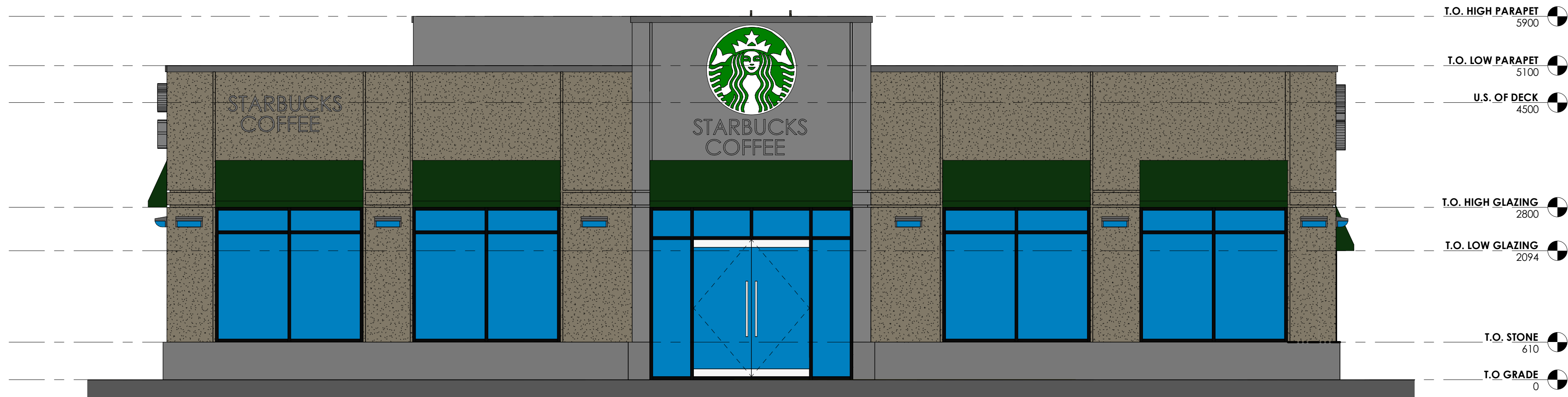
1 EAST ELEVATION A2.2 A3 1 : 50