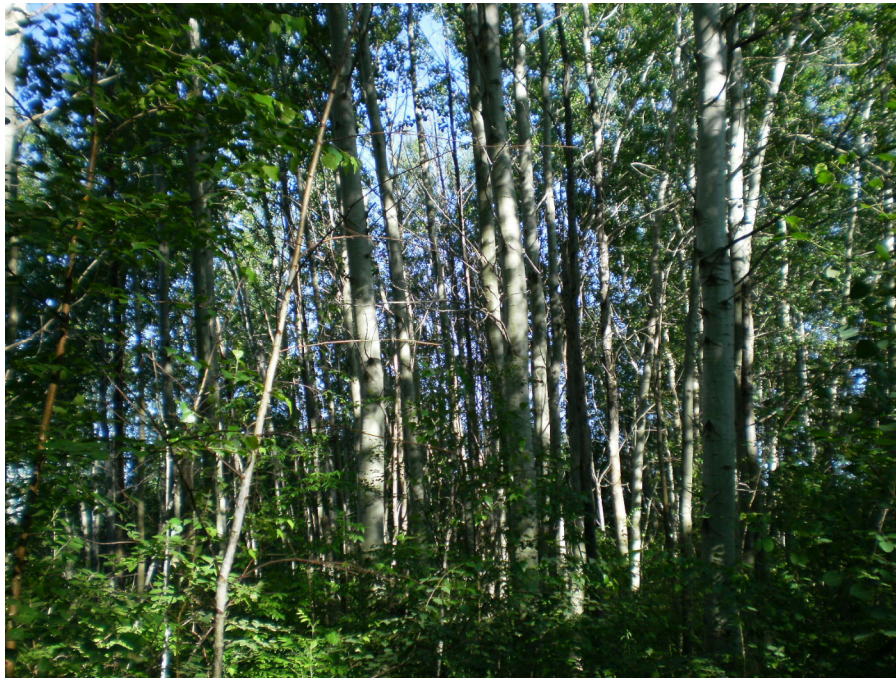
Photo 1 – Typical poplar trees in the centre portion of the upland deciduous forest. View looking northwest

east portion of the forest (Photo 9). No cavity trees, stick nests, or other evidence of raptor use were observed on or adjacent to the site.