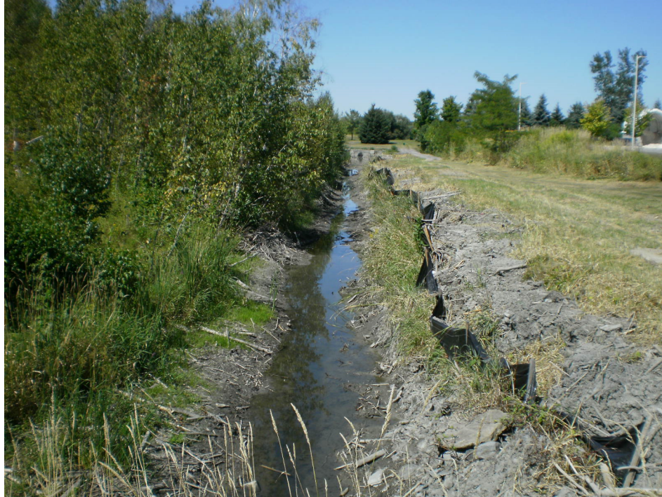
Photo 7 – North-south stormwater channel in the stormwater easement in the east edge of the site. View looking north from Solandt Road