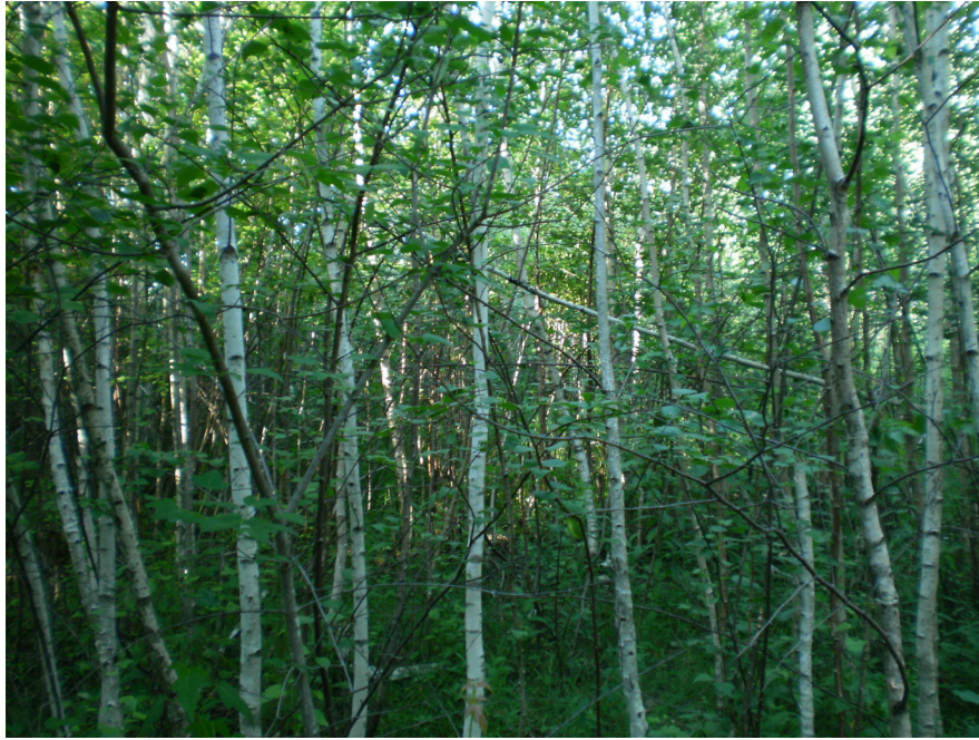
Photo 3 – Young birch were dominant in the west portion of the upland deciduous forest. View looking southwest