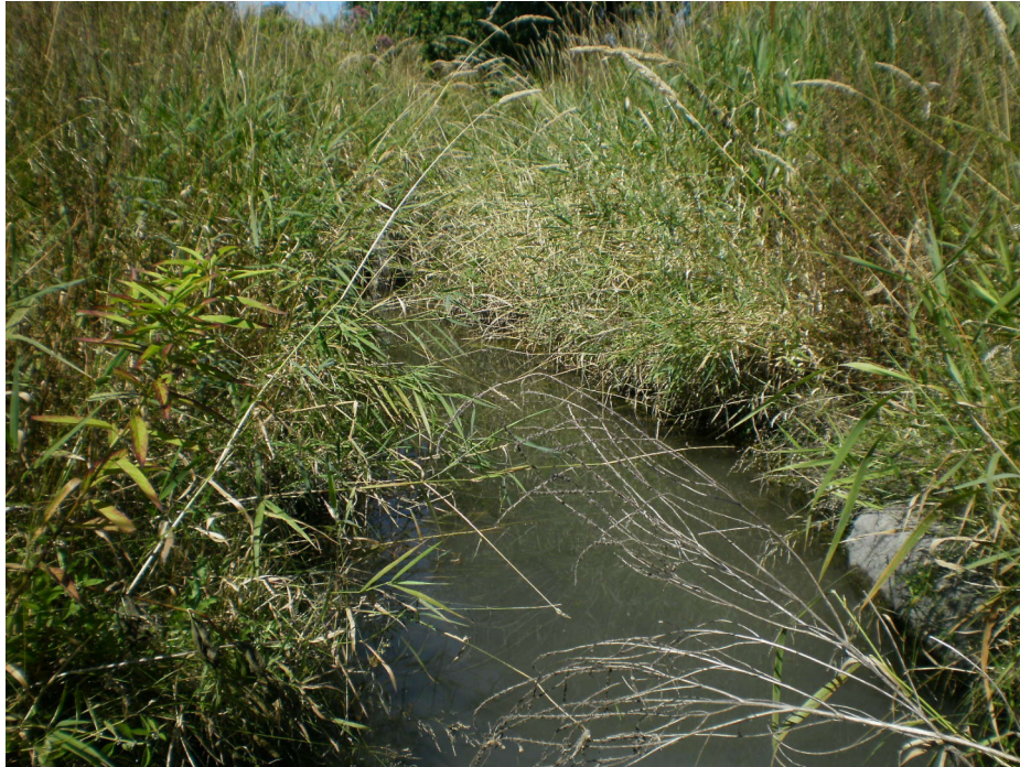
Photo 5 – Shirley’s Brook is the northwest edge of the site. View looking north