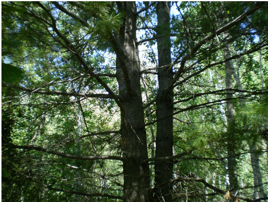
Photo 4 – The largest trees on-site were a couple of white pines in the south portion of the upland forest. This example is in the southwest corner of the site. View looking north