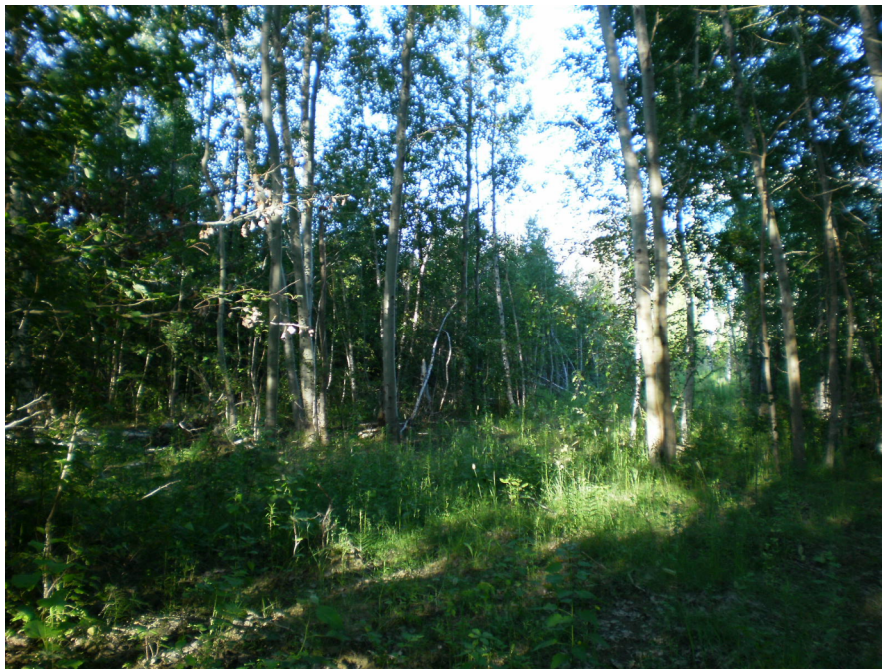
Photo 2 – There are many open areas in the upland deciduous forest. This example is in the central portion of the forest, with view looking west