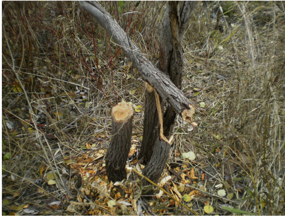
Photo 9 – Beaver cutting in the east edge of the site, west of the stormwater channel