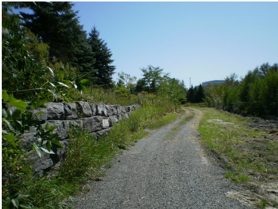
Photo 8 – Access trail, retaining, wall, berm and coniferous plantings on and adjacent to the east edge of the site. View looking south from the north property line