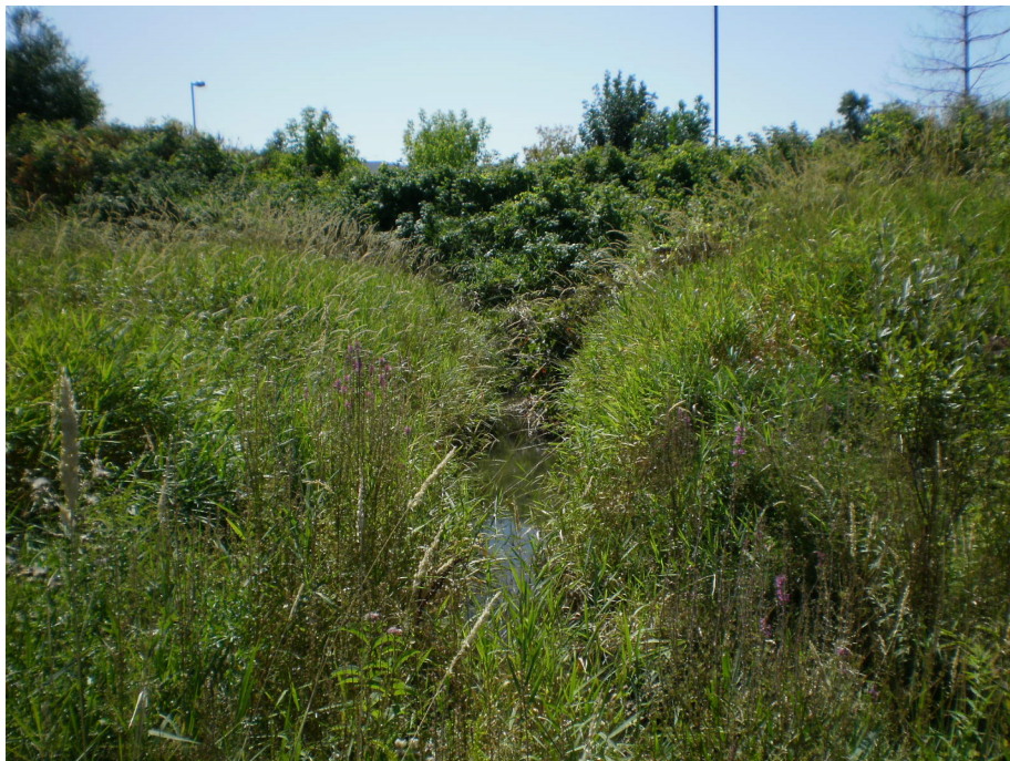
Photo 6 – Meadow habitat on-site to the east of Shirley’s Brook. View looking west