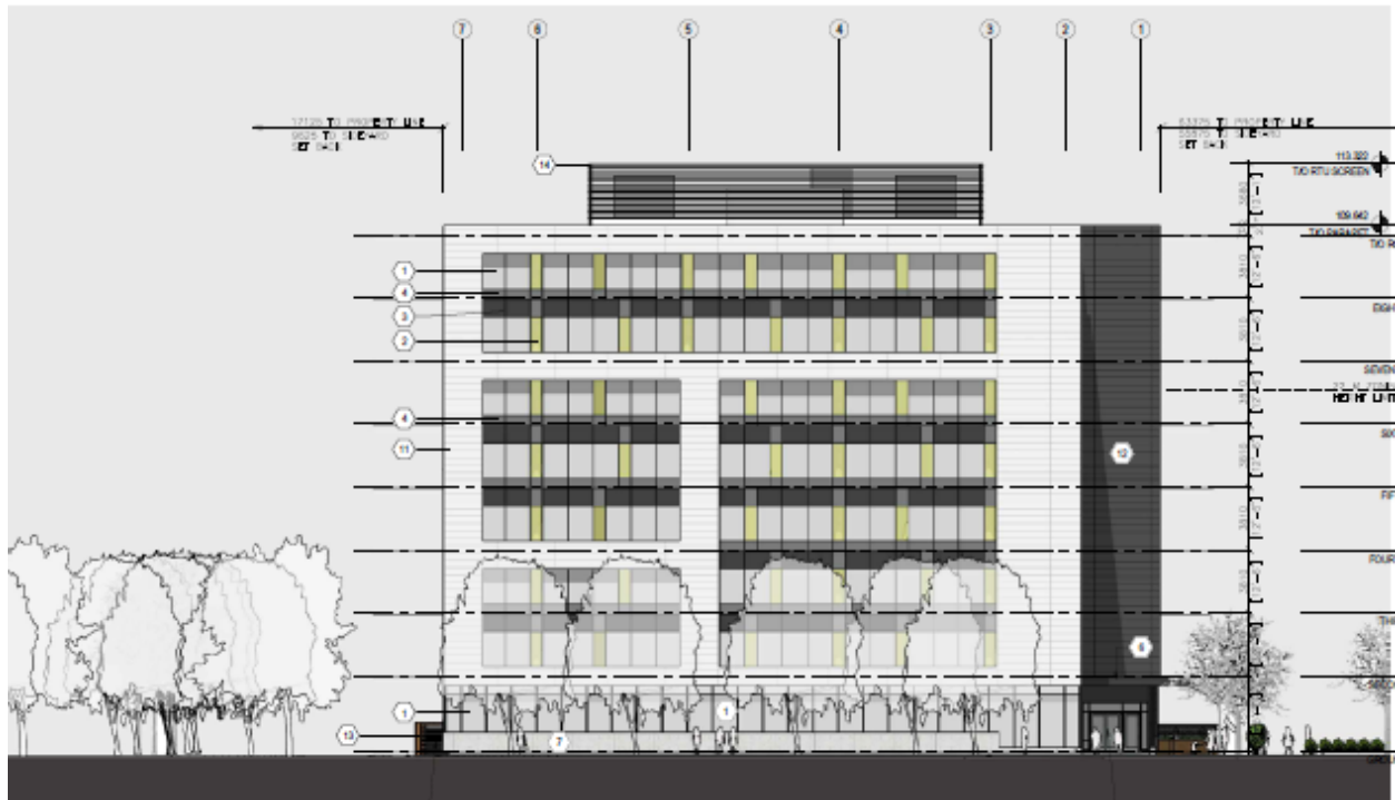
SITE ACCESS AND PARKING

Stairs are increasingly becoming a desirable means to access the lower floors and to move between floors in a tenancy, rather than just an emergency exit requirement. Accordingly, the design highlights the stairs at the front of the building with a generous glazed stairwell. The ground floor combines an attractive corporate entry foyer with convenient bicycle facilities.