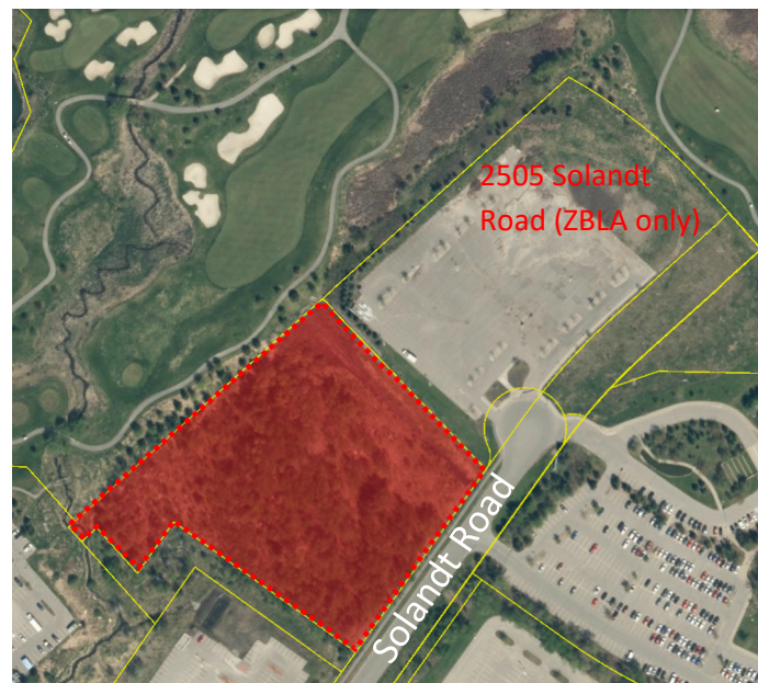
Figure 1: Subject site and 2505 Solandt Road

The subject site, shown in Figure 1, is on the north west side of Solandt Road in the central part of the Kanata North Business Park. It is 2 hectares in area and roughly rectangular with approximately 120 metres of frontage along Solandt Road.