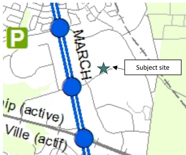
Figure 3: Excerpt of OP Schedule D indicating proximity of Subject site to the future BRT stop.

Per 'Schedule D – Rapid Transit and Transit Priority Network' in the Official Plan , the subject site is also within 500-metres radius of the future Bus Rapid Transit Station stop at the corner of Solandt Road and March Road, as shown on Figure 8. This rapid transit corridor has not yet been built.