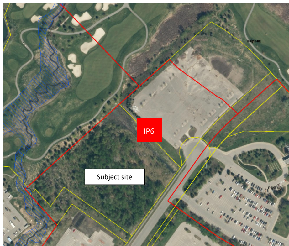
Figure 6: Existing Zoning

The zone has a height limit of 22m for the site, which is not enough for the proposed 8 storey building. Refer to Section 3.1.2 of this Rationale for a description of the proposed zoning by-law amendment.