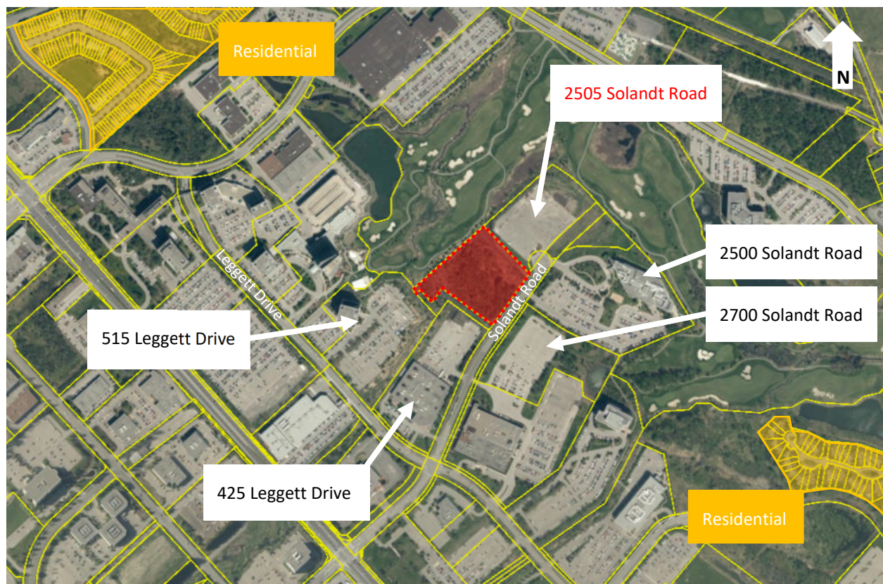
Figure 2: Surrounding Land Uses

Further afield, the Kanata North Business Park continues – as the subject site is roughly in the centre of the park, it is 540m to the nearest non-business park land use, the residential Marshes Village to the south east.