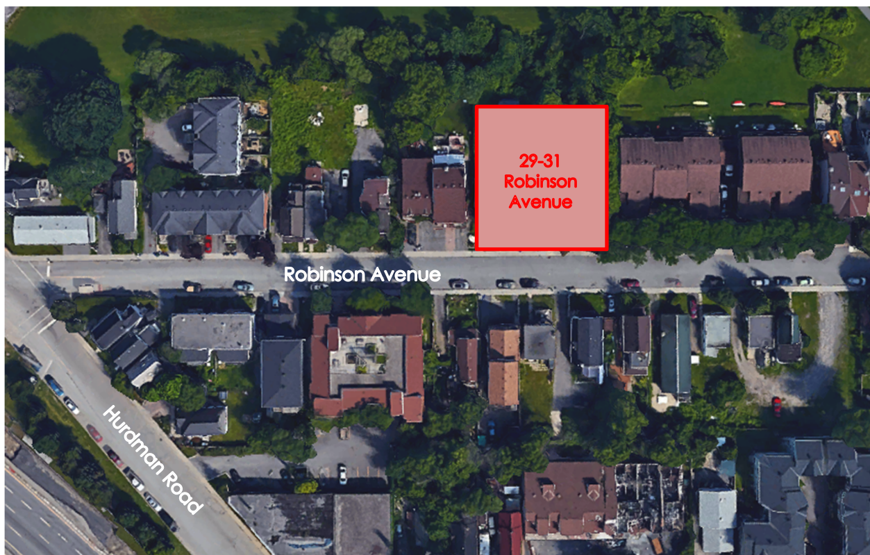
Figure 1: Location Plan

Stantec Consulting Ltd. has been commissioned by Robinson Village 2 Limited Partnership to prepare a servicing study in support of Site Plan Control submission of the proposed development located at 29 Robinson Avenue. The site is the combined properties of 27, 29 and 31 Robinson Avenue situated east of Hurdman Road and Robinson Avenue intersection within the City of Ottawa. The proposed development would replace three existing two-storey dwellings with a 4 storey apartment building comprised of 46 total residential units. The site location is shown as Figure 1 below. The 0.12ha site is presently zoned R5K (Residential Fifth Density Zone), which permits the proposed development plan. The intent of this report is to provide a servicing scenario for the site that is free of conflicts, provides on-site servicing in accordance with City of Ottawa design guidelines, and utilizes the existing local infrastructure in accordance with the guidelines outlined per consultation with City of Ottawa staff.