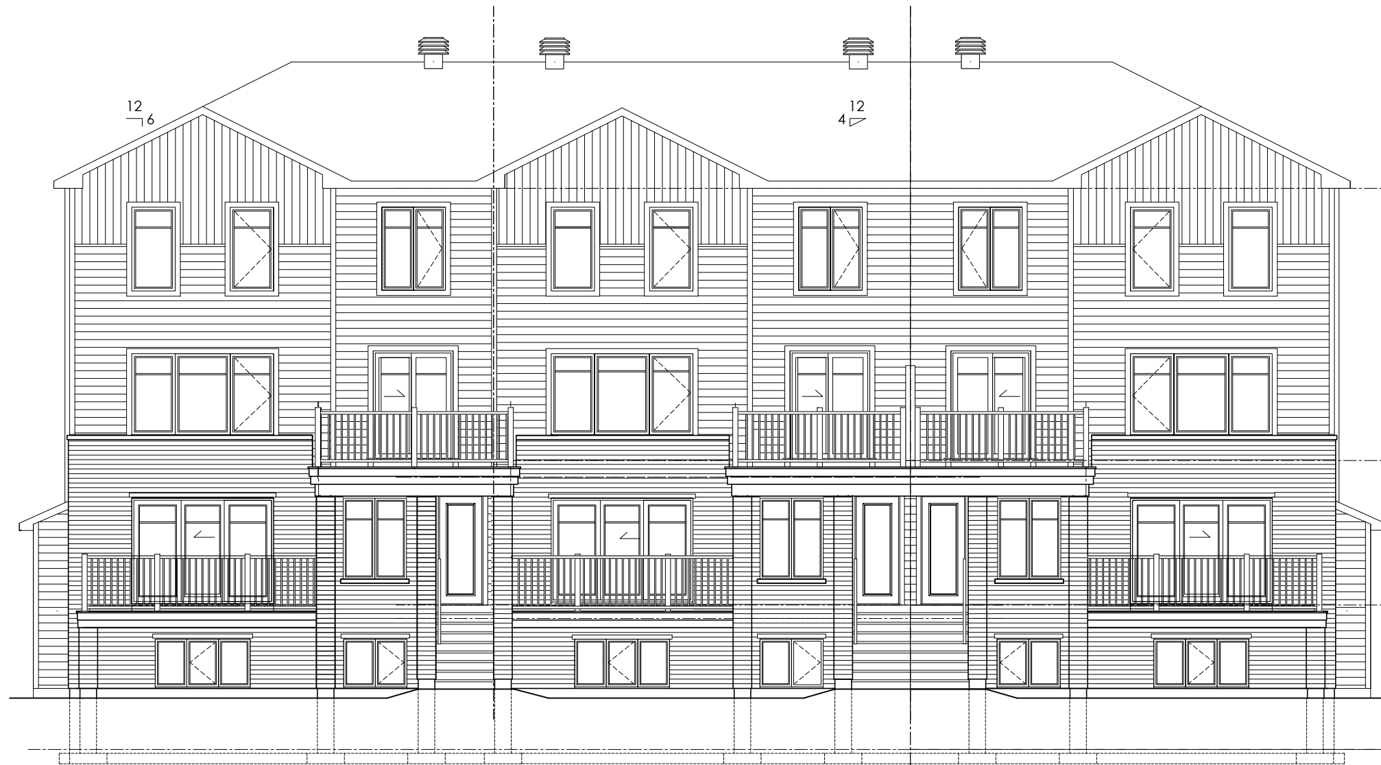
THE JASMINE & THE ROOIBOS FRONT ELEVATION C-END UNIT