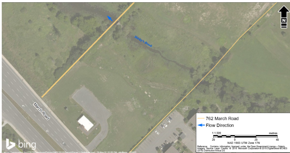
FIGURE 1 Length of Shirley's Brook through the study area

Matrix Solutions Inc. was retained to provide a meander belt width assessment of Shirley's Brook at 762 March Road in Kanata, Ontario. Since original conceptual site plan approval, MVCA has updated regulations mapping for Shirley's Brook including meander belt hazard delineations. Previous meander belt width considerations accounted for a 55 m wide meander, however the meander belt width was updated by MVCA to approximately 85 m through the study area. The MVCA requested a meander belt width assessment be submitted to demonstrate that the proposed development is beyond the hazard. The following report provides a detailed meander belt width assessment based on the less than 100 m reach of Shirley's Brook through the study area. This section of Shirley's Brook is part of a sub-reach extending from the crossing at Klondike Road to Shirley's Brook Drive. Figure 1 presents the extents of Shirley's Brook within the study area.