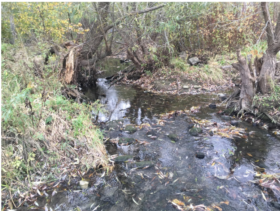
Matrix Solutions Inc. October 16, 2018