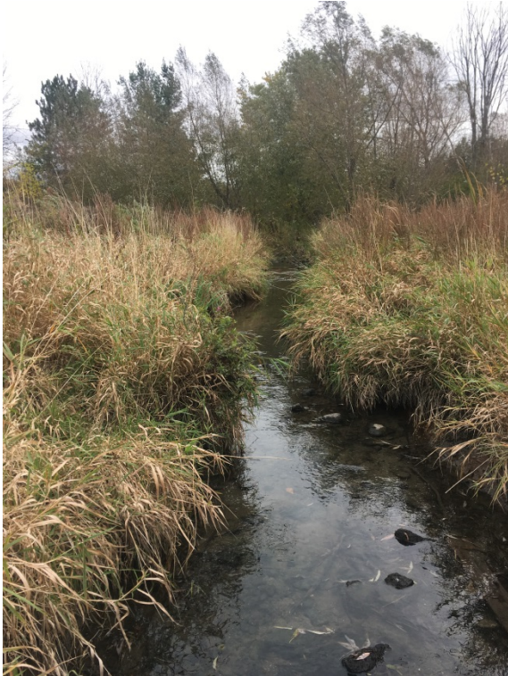
Matrix Solutions Inc. October 16, 2018