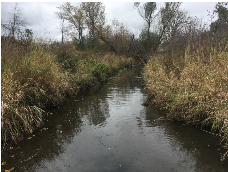
Matrix Solutions Inc. October 16, 2018