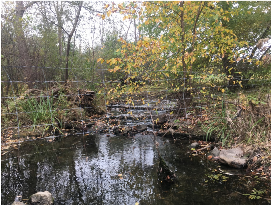
Matrix Solutions Inc. October 16, 2018