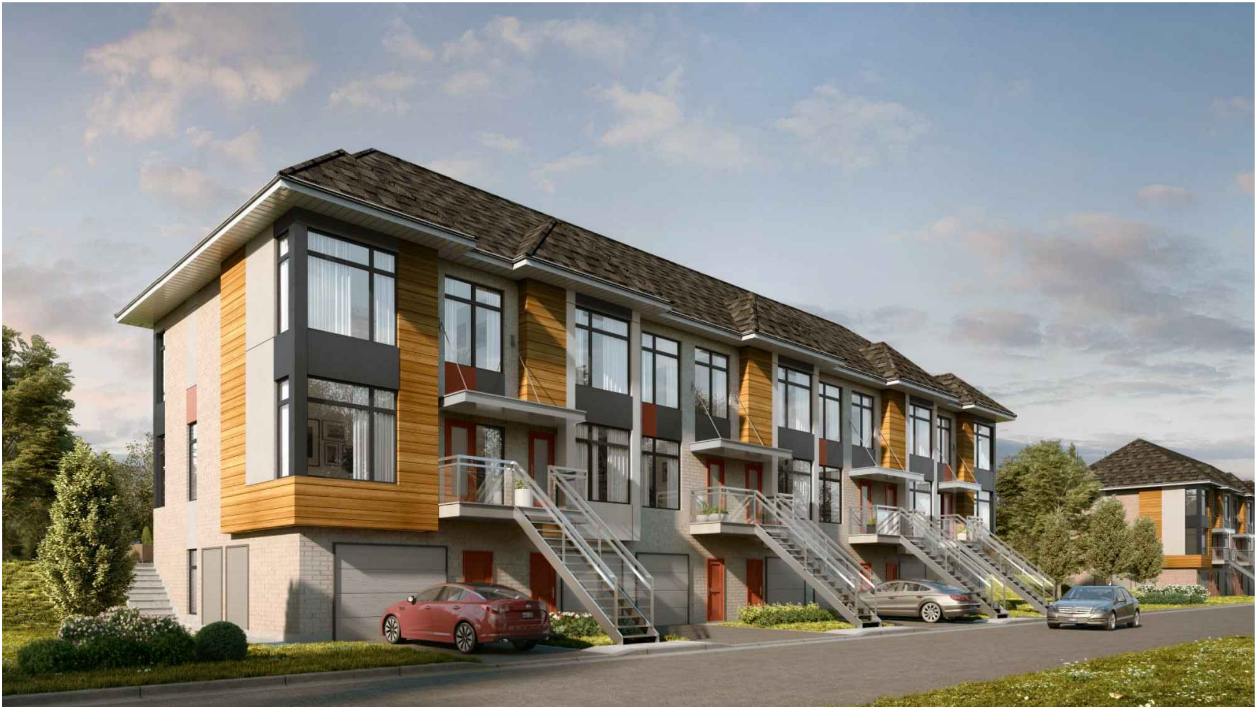
BLOCKS 5 & 8