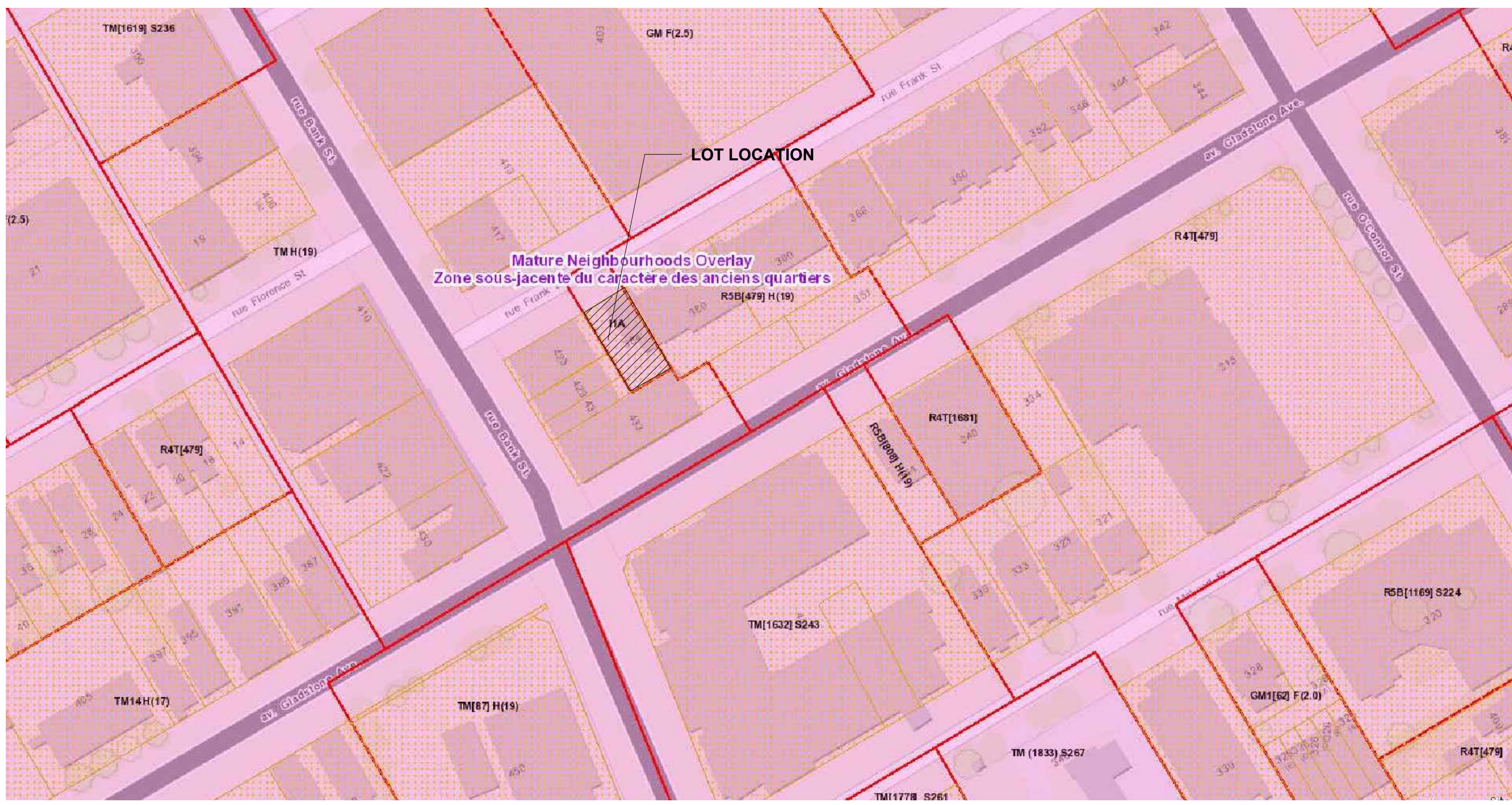
2 KET PLAN & CONTEXT A1 SCALE: NTS