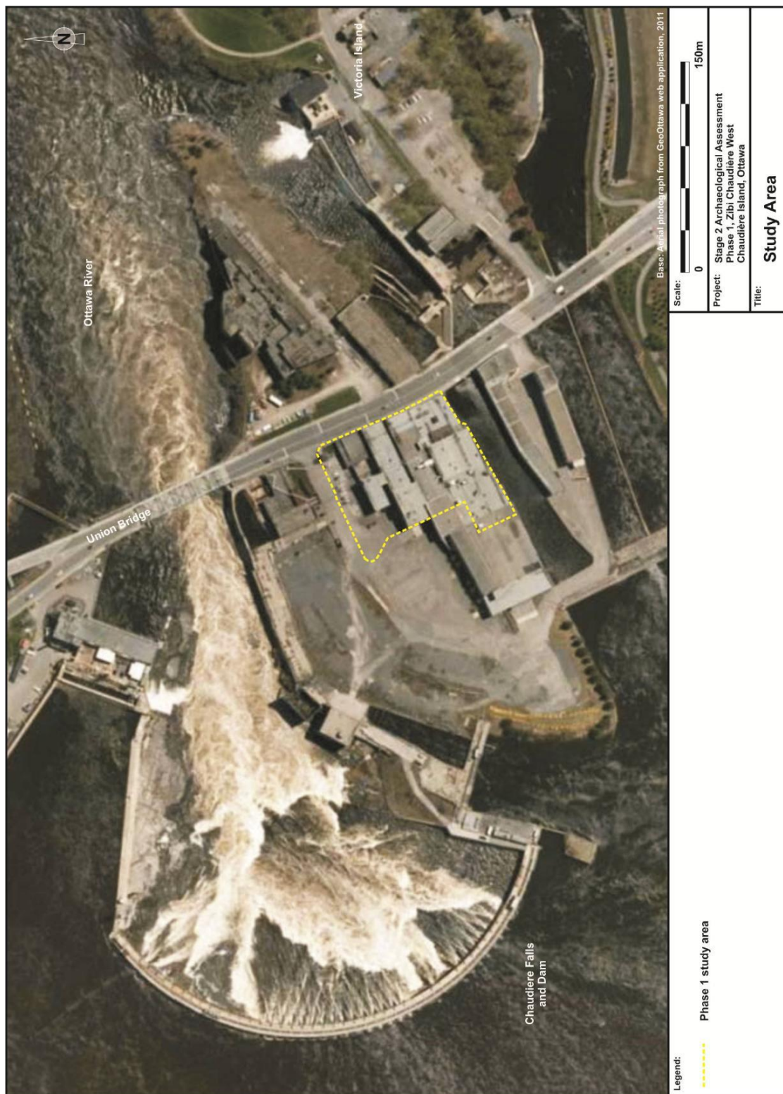
Figure 1. Recent aerial photograph depicting the Phase 1 Zibi Chaudière West study area where the required Stage 2 archaeological assessment has been completed.