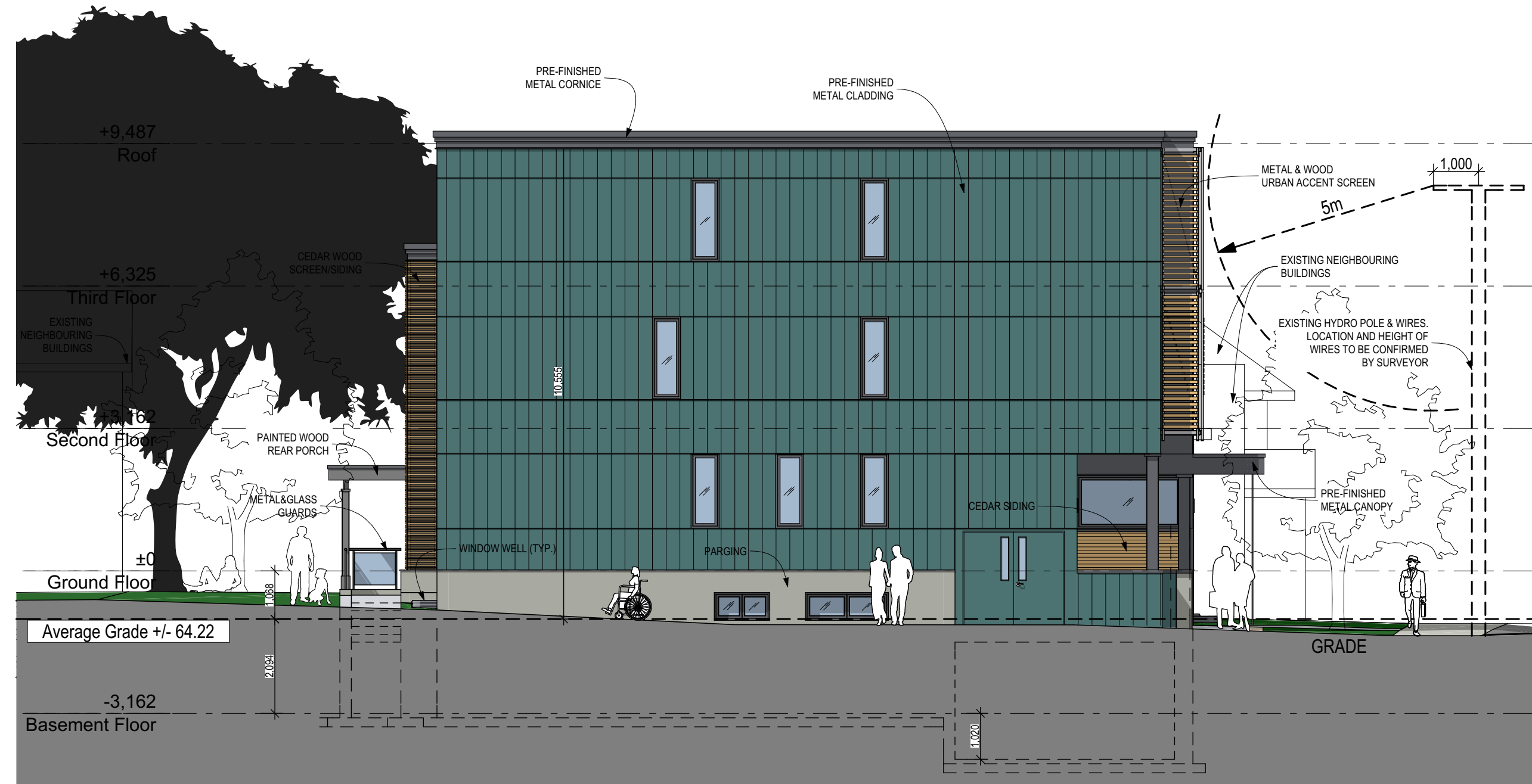
3 South Elevation A-04 SCALE: 1:100