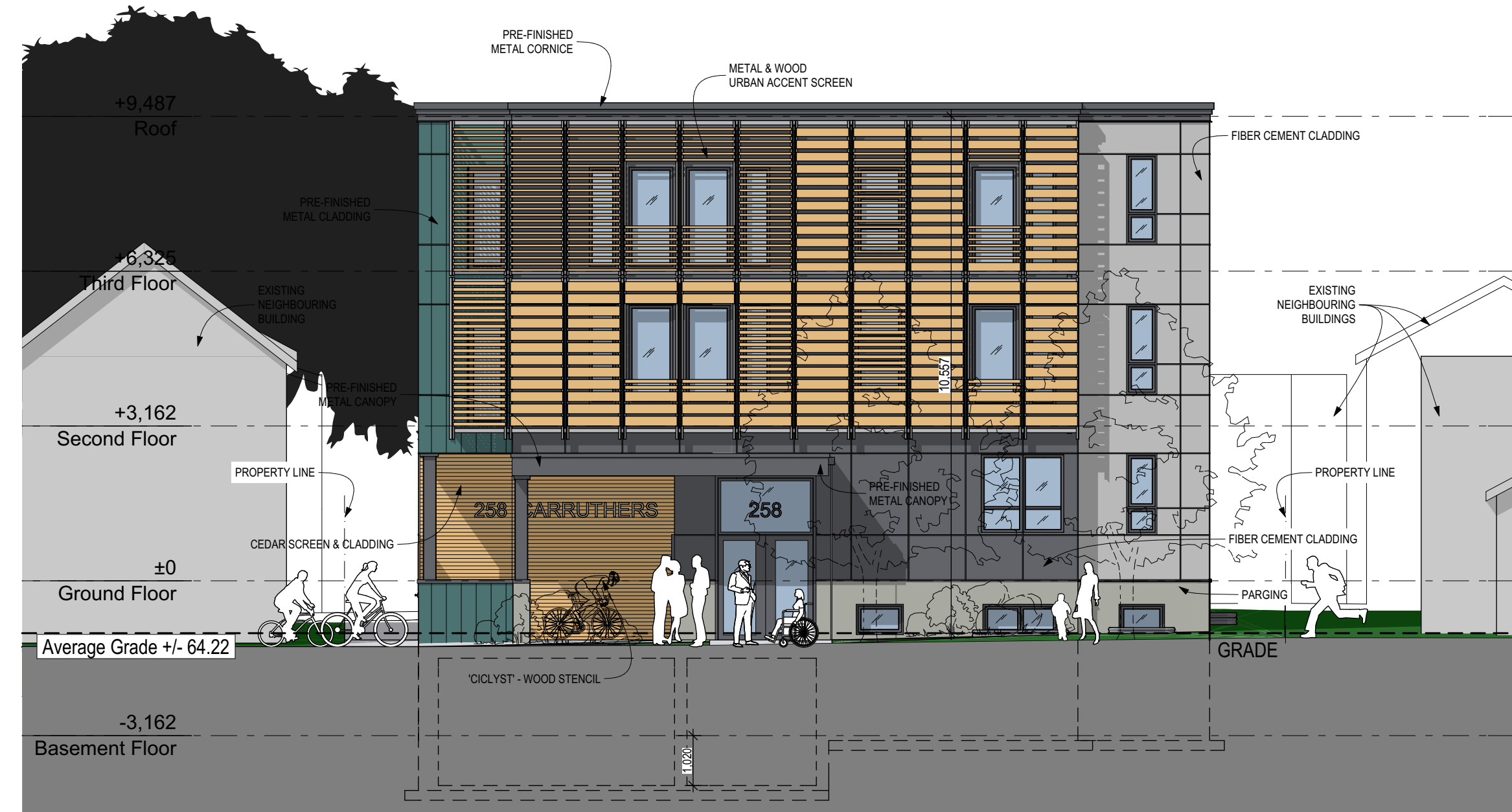
1 East Elevation A-04 SCALE: 1:100