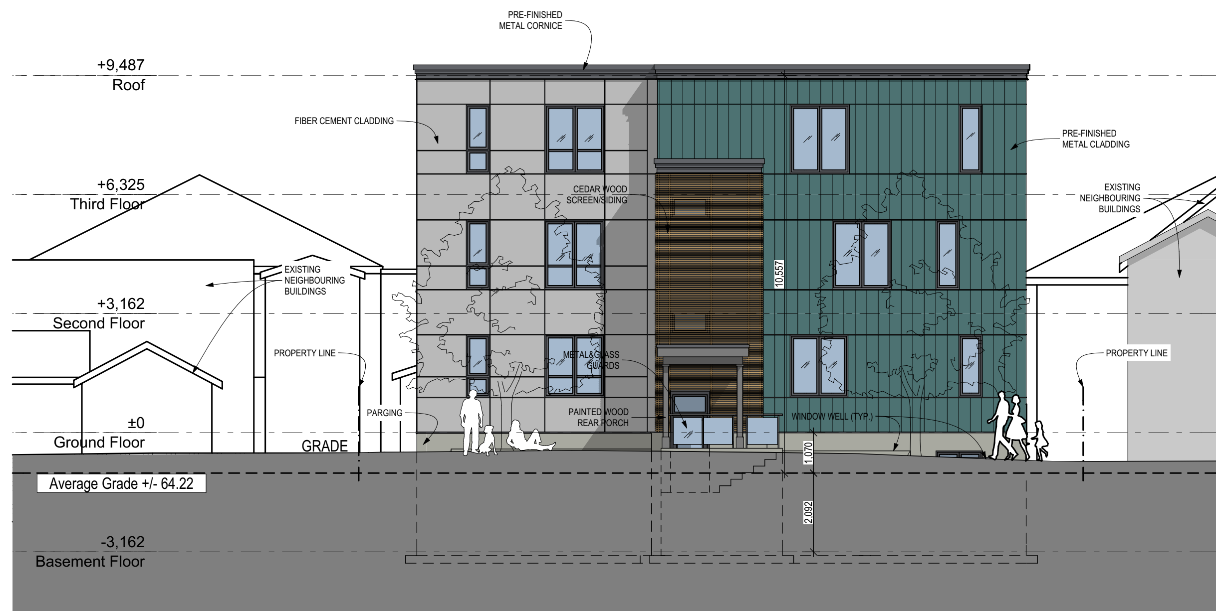
4 West Elevation A-04 SCALE: 1:100