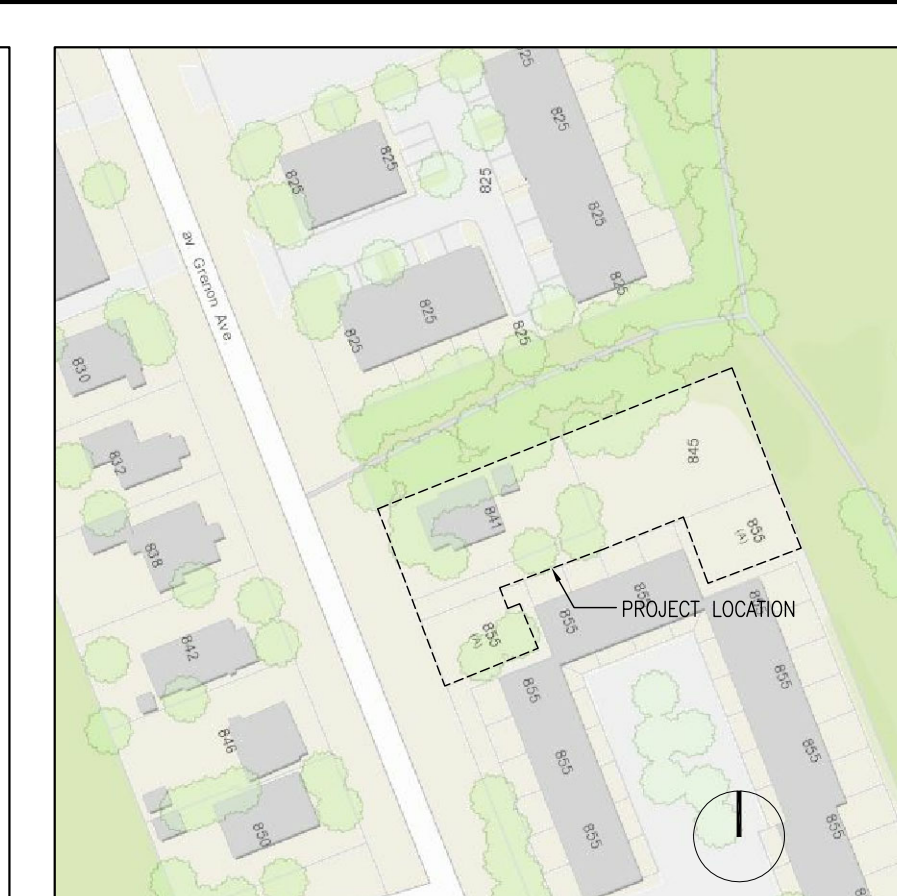
LOCATION PLAN SCALE: NTS