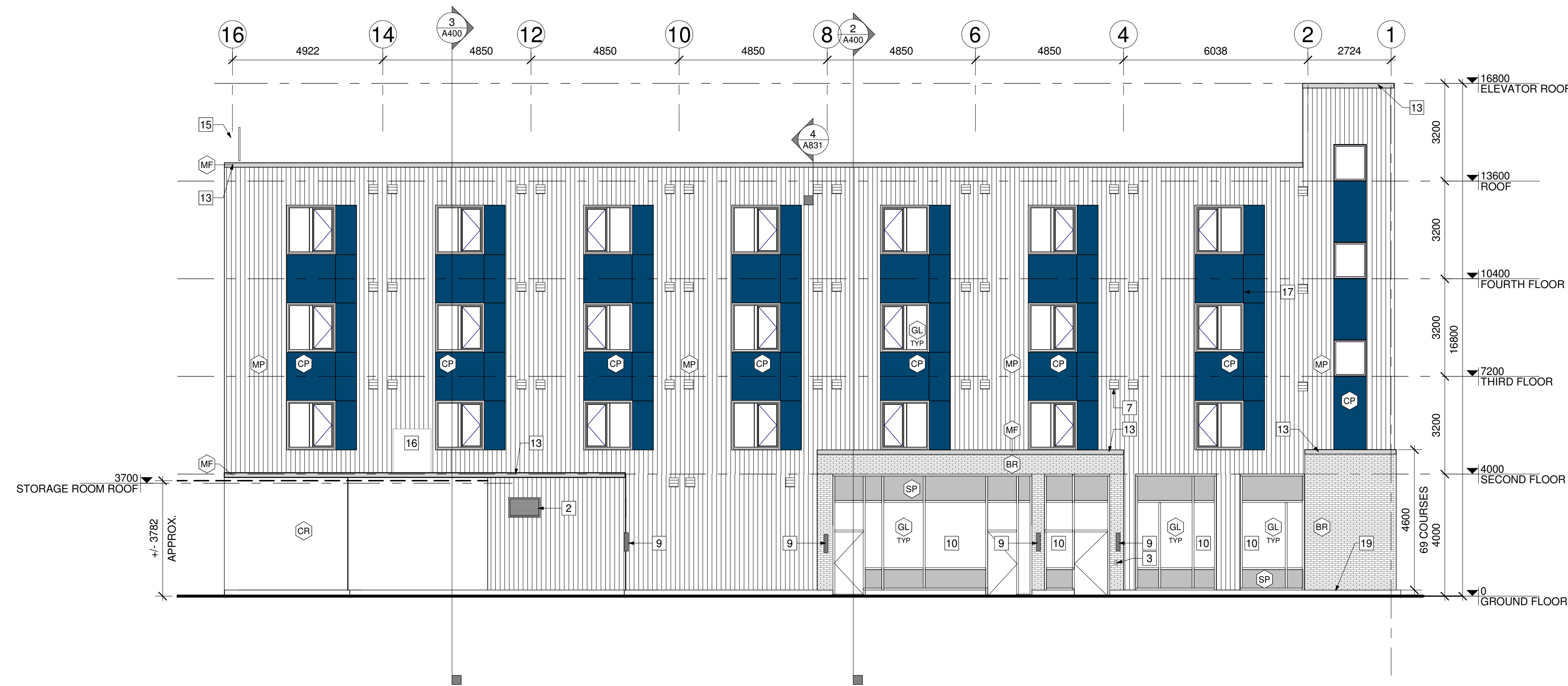
1 ELEVATION - NORTH A300 1:100