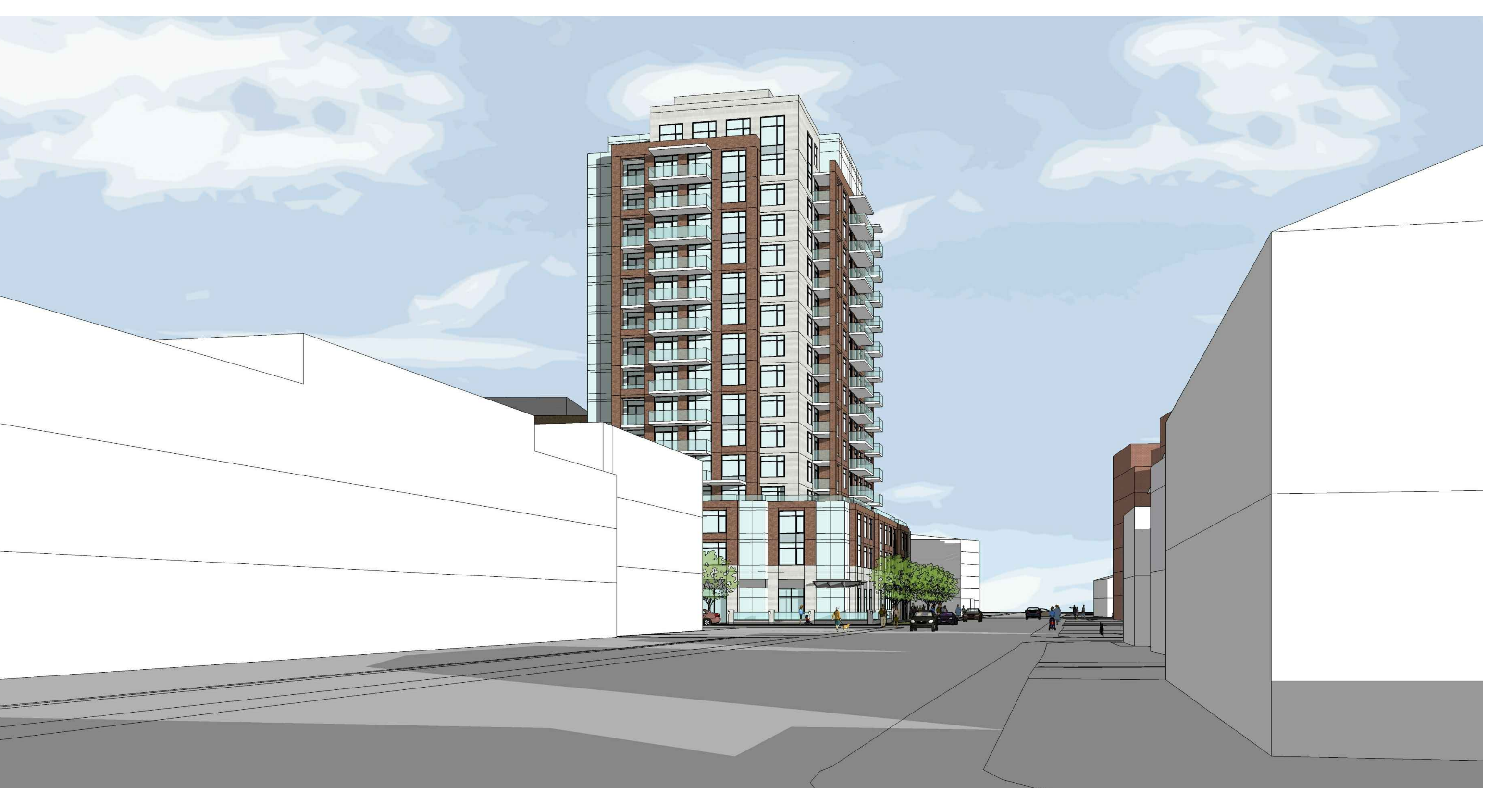
VIEW SOUTH ON CAMBRIDGE

IT IS THE RESPONSIBILITY OF THE APPROPRIATE CONTRACTOR TO CHECK AND VERIFY ALL DIMENSIONS ON SITE AND TO REPORT ALL ERRORS AND/OR OMISSIONS TO THE ARCHITECT.