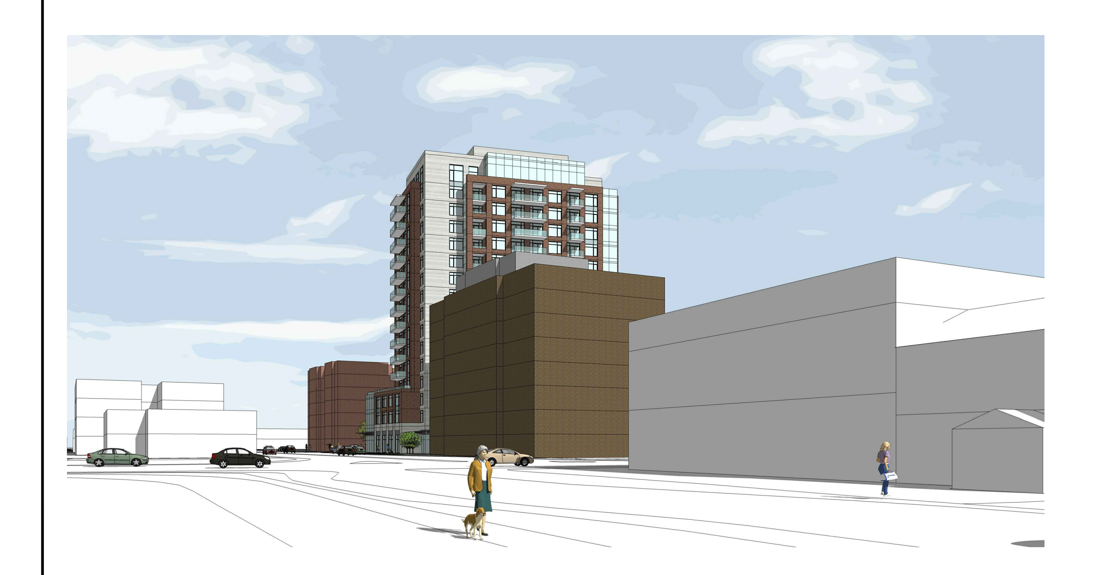
VIEW WEST ON GLEBE AVENUE