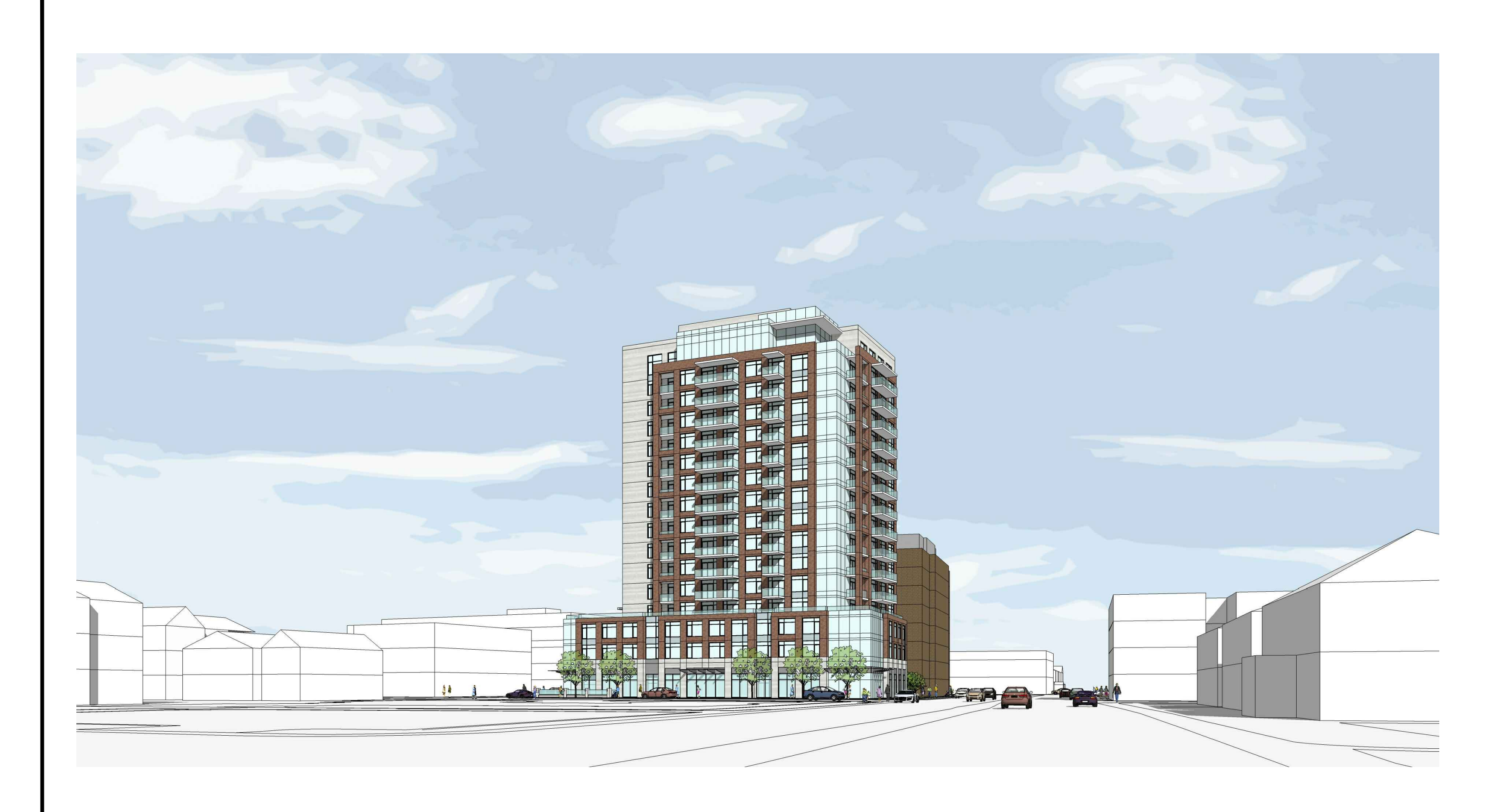
VIEW EAST ON CARLING