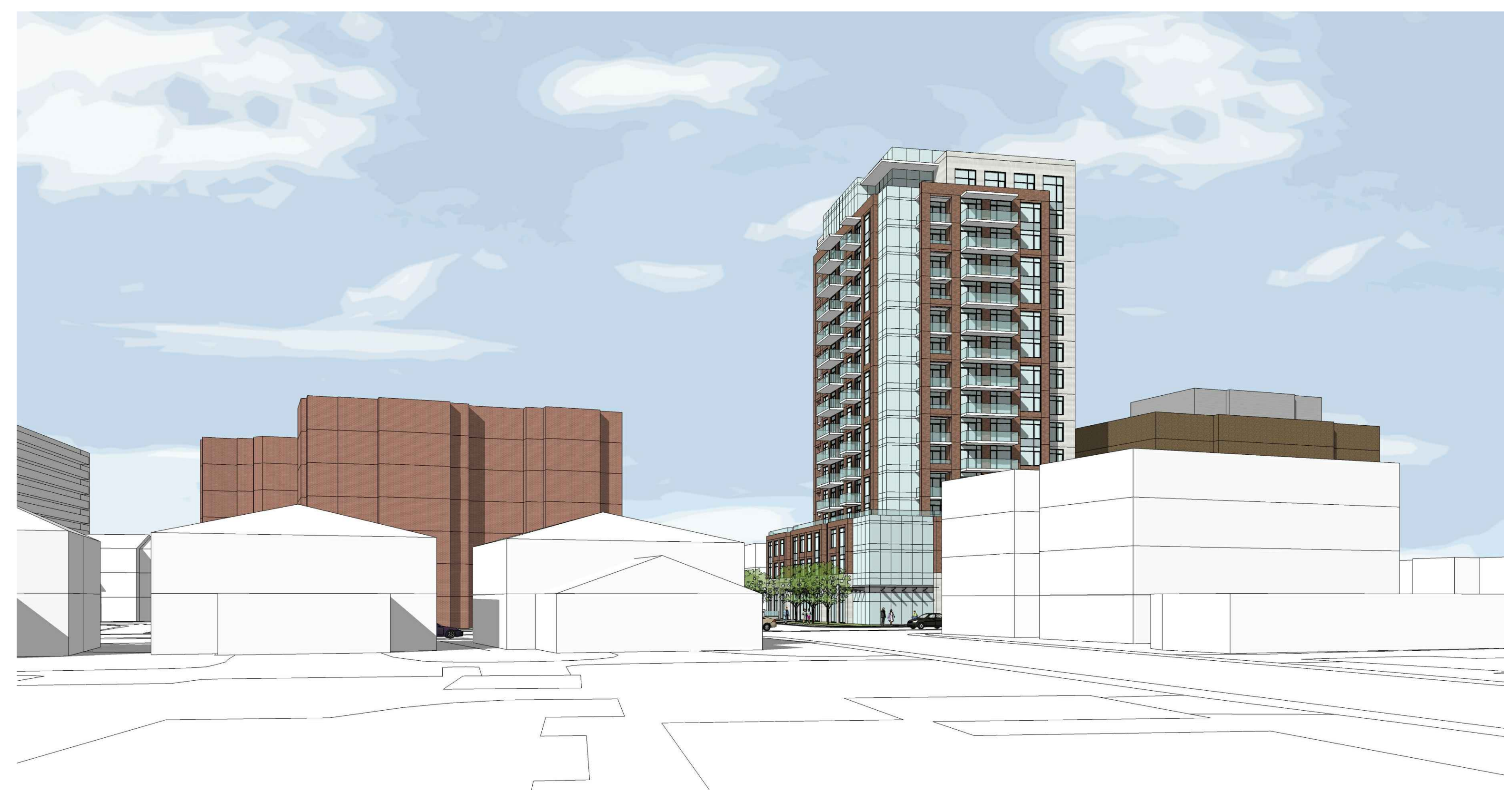
VIEW NORTH ON CAMBRIDGE