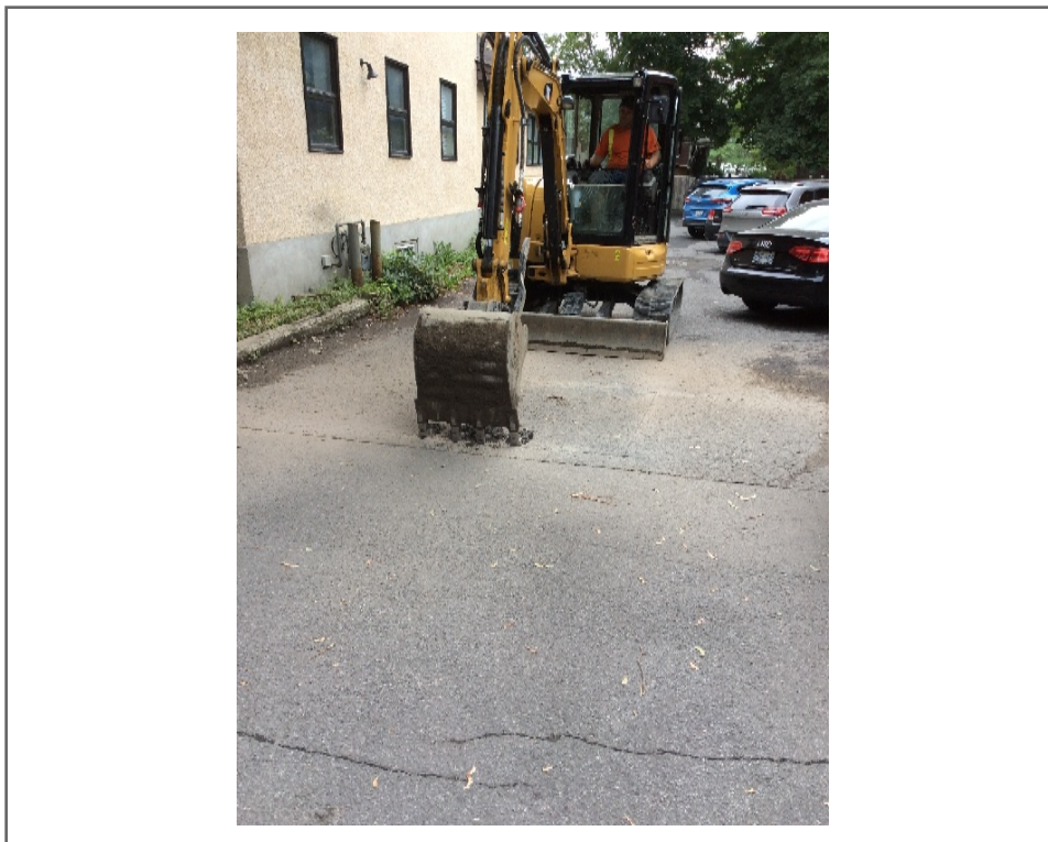
Test pit 2