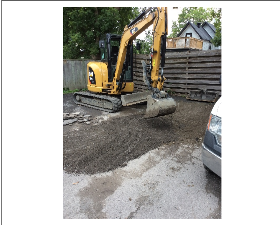
Test pit 1