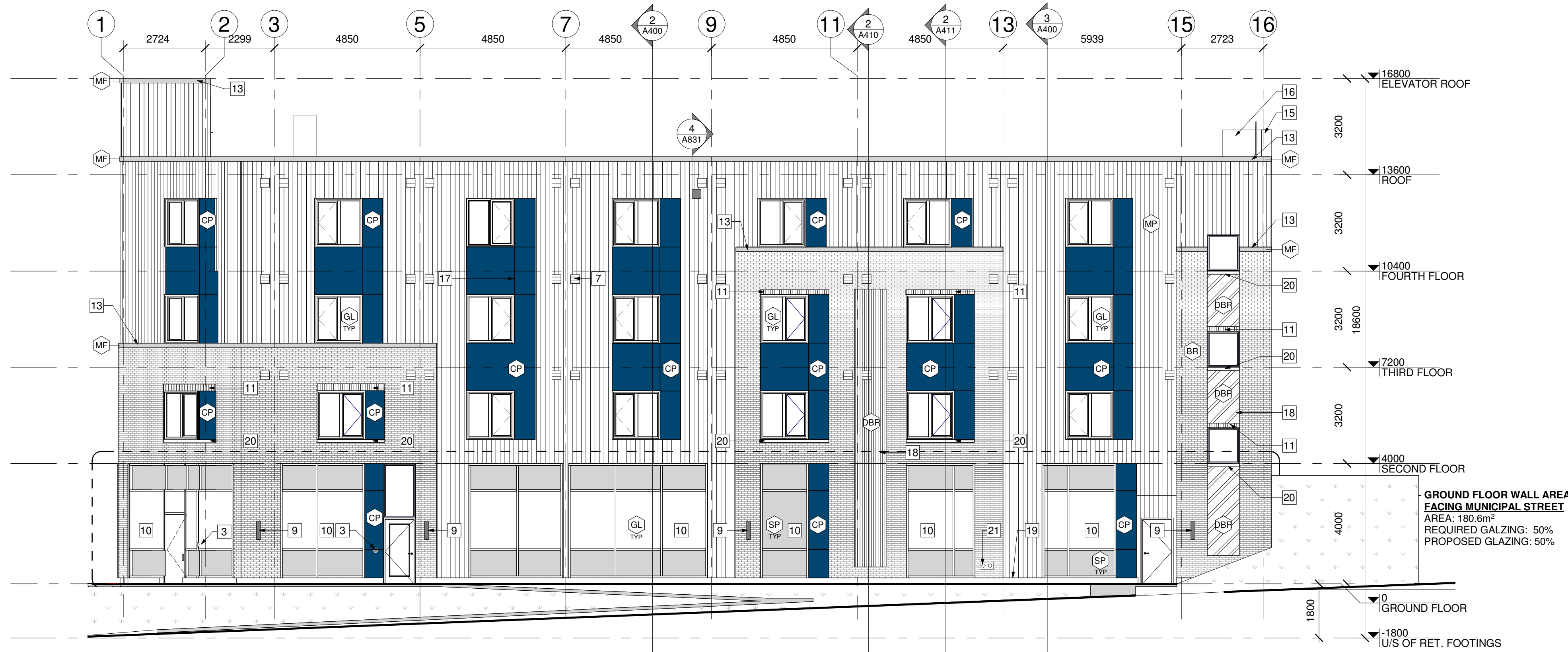
1 ELEVATION - SOUTH A301 1:100

CONSULTANT ROLE: LANDSCAPE CONSULTANT NAME: LASHLEY-ASSOCIATES ADDRESS: 950 GLADSTONE AVE. SUITE 202, OTTAWA, ON, K1Y 3B6 PHONE: 613-233-8579