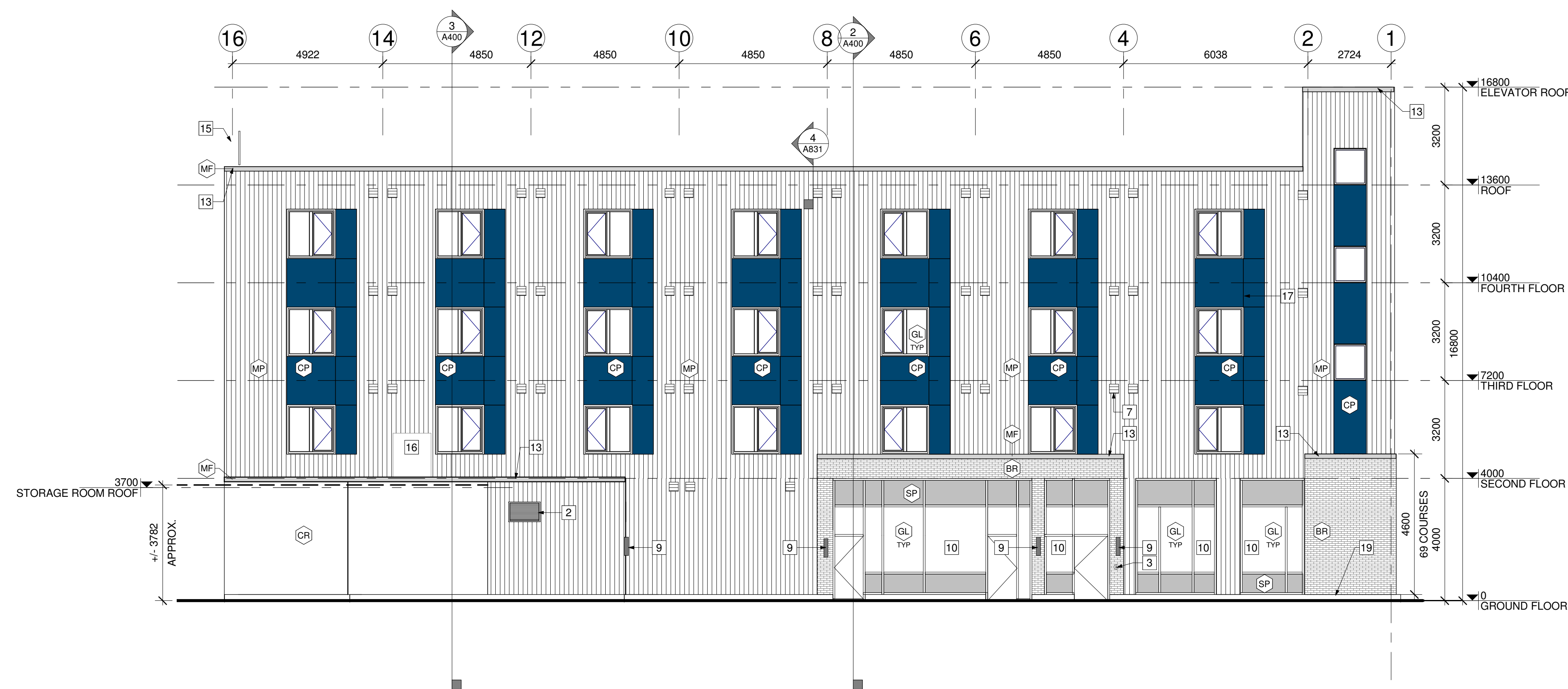
1 ELEVATION - NORTH A300 | 1:100

CONSULTANT ROLE: LANDSCAPE CONSULTANT NAME: LASHLEY ASSOCIATES ADDRESS: 950 GLADSTONE AVE. SUITE 202, OTTAWA, ON, K1Y 3B6 PHONE: 613-233-8579