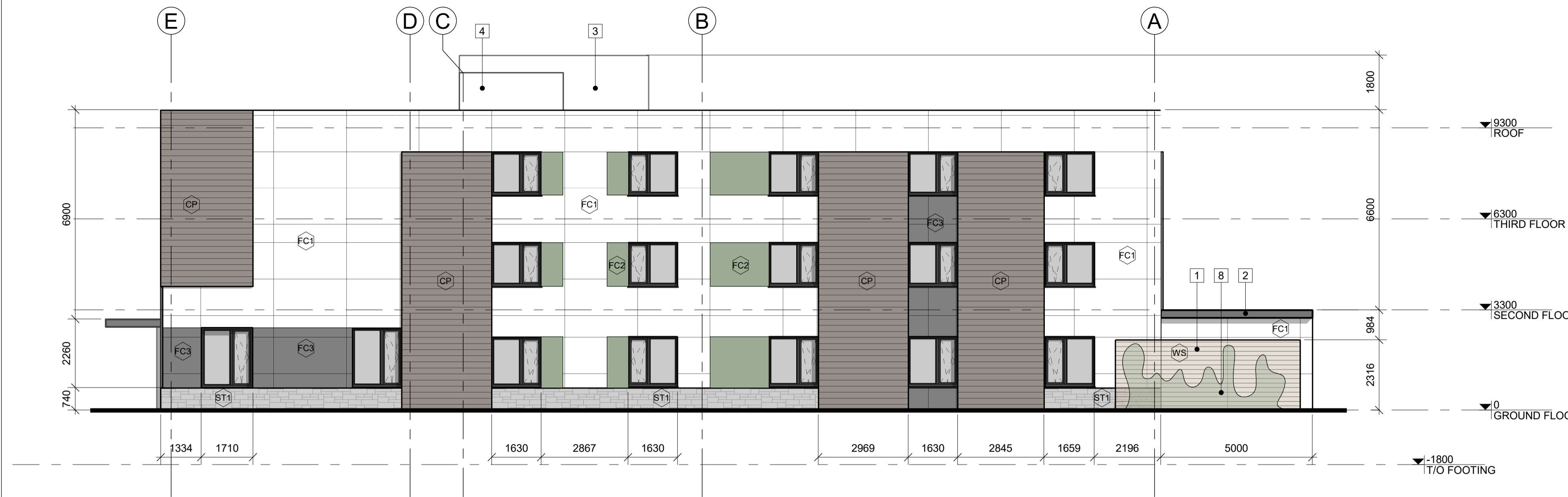
1 EAST ELEVATION A.300 1:100