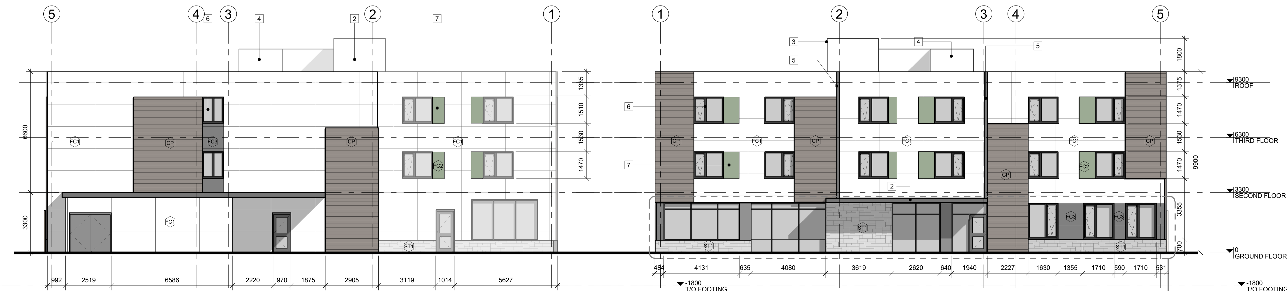
3 NORTH ELEVATION A.300 1:100